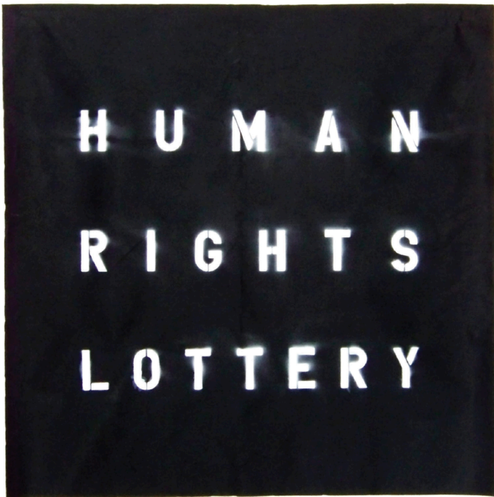
Tom Bogaert HUMAN RIGHTS LOTTERY , 2009 Banner, spray paint on nylon fabric