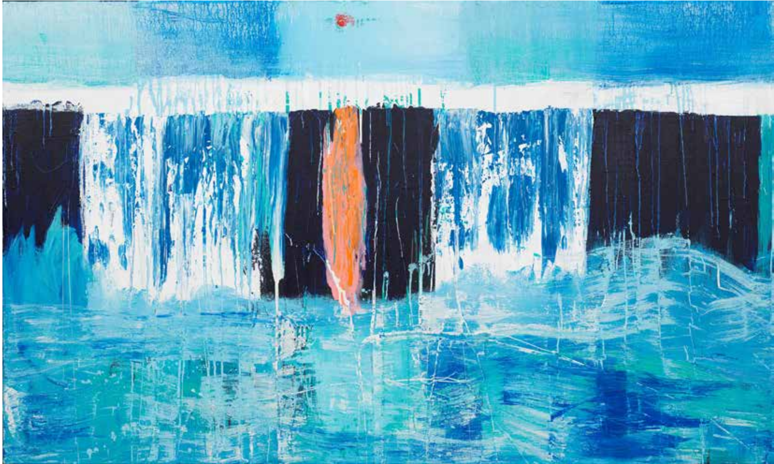
The Melting 36 x 60 inches