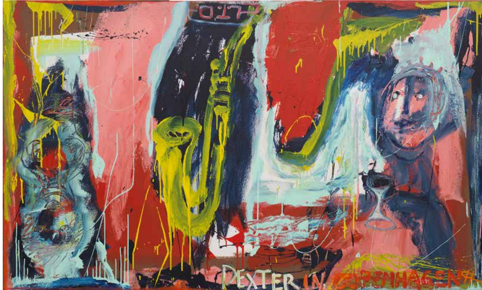
Dexter Gordon 36 x 60 inches

American jazz musician Dexter Gordon blew his horn at an impromptu Copenhagen street fair...unforgettable!