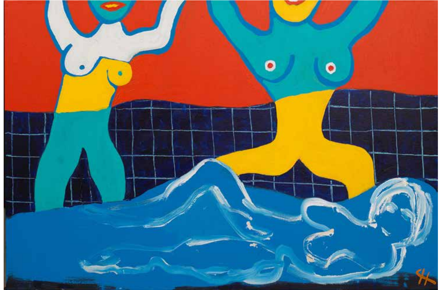
Dreaming in the Tub 36 x 60 inches

Danes often refresh for the second round while dreaming in the tub