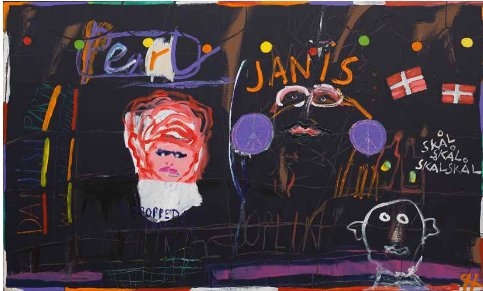
Janis 36 x 60 inches

The guy in the lower right corner is all ears for Janis