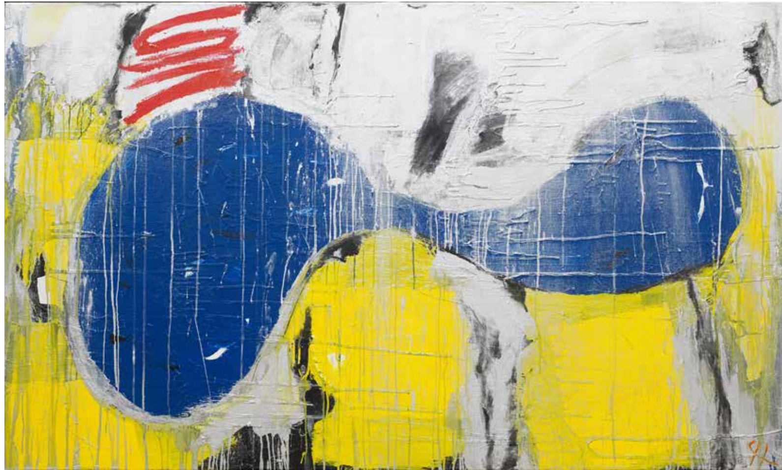
Silver Lake 36 x 60 inches