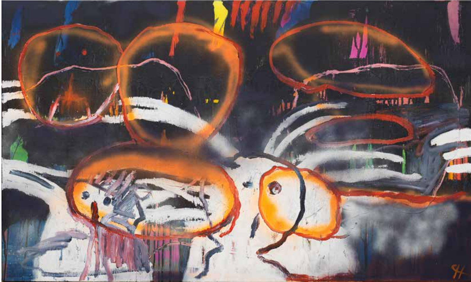
City Nights 36 x 60 inches