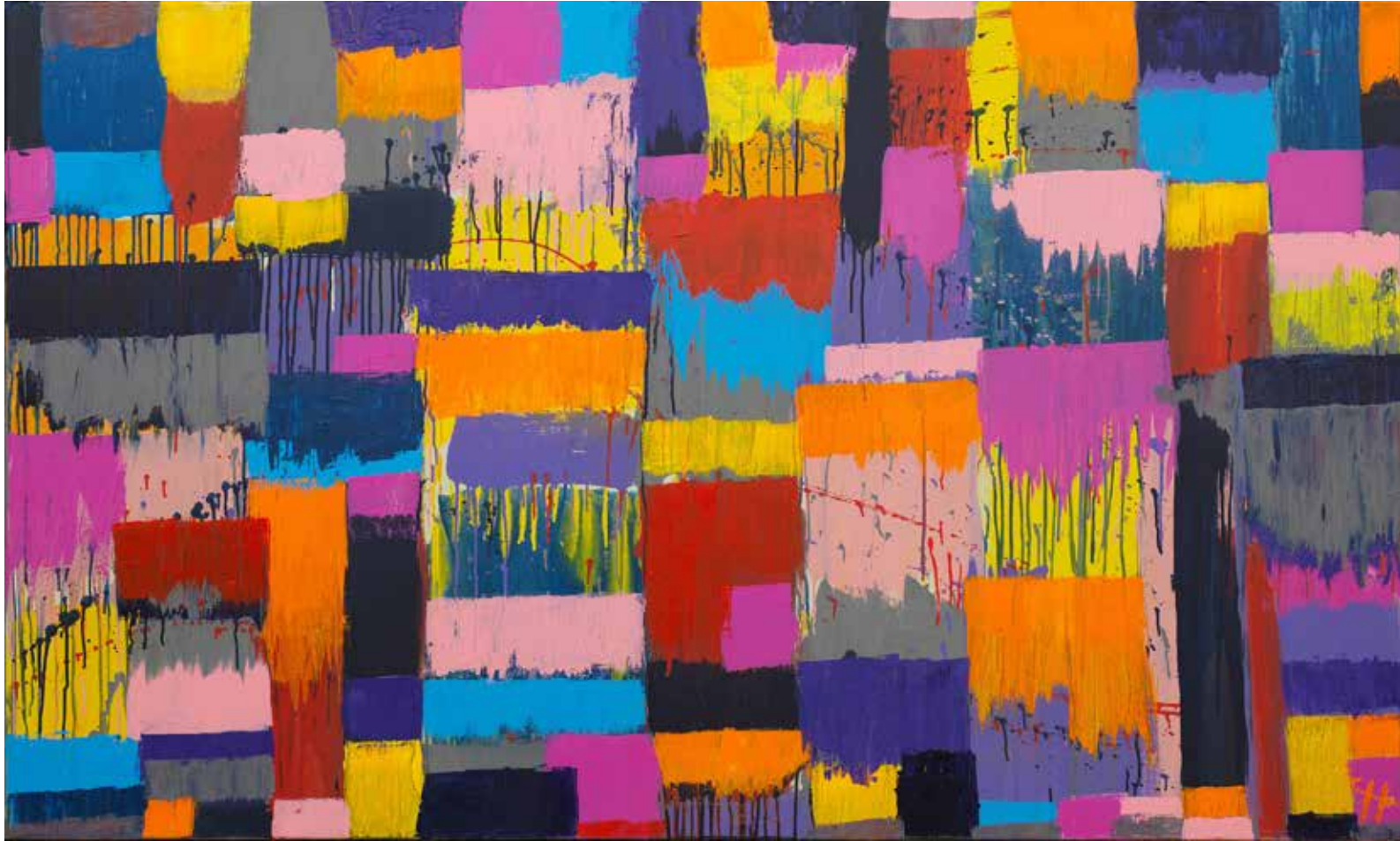
Color Blocks No. 6 36 x 60 inches