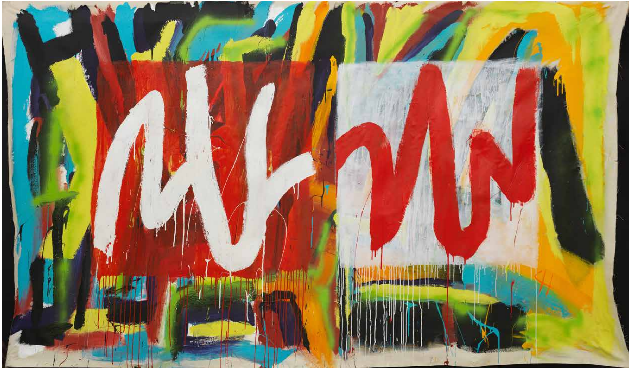
Separation Unstretched Canvas 52 x 91 inches