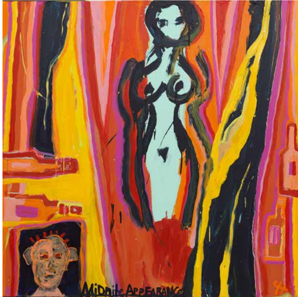
Midnight Appearance 48 x 36 inches

Who makes an appearance at midnight is anybody's guess