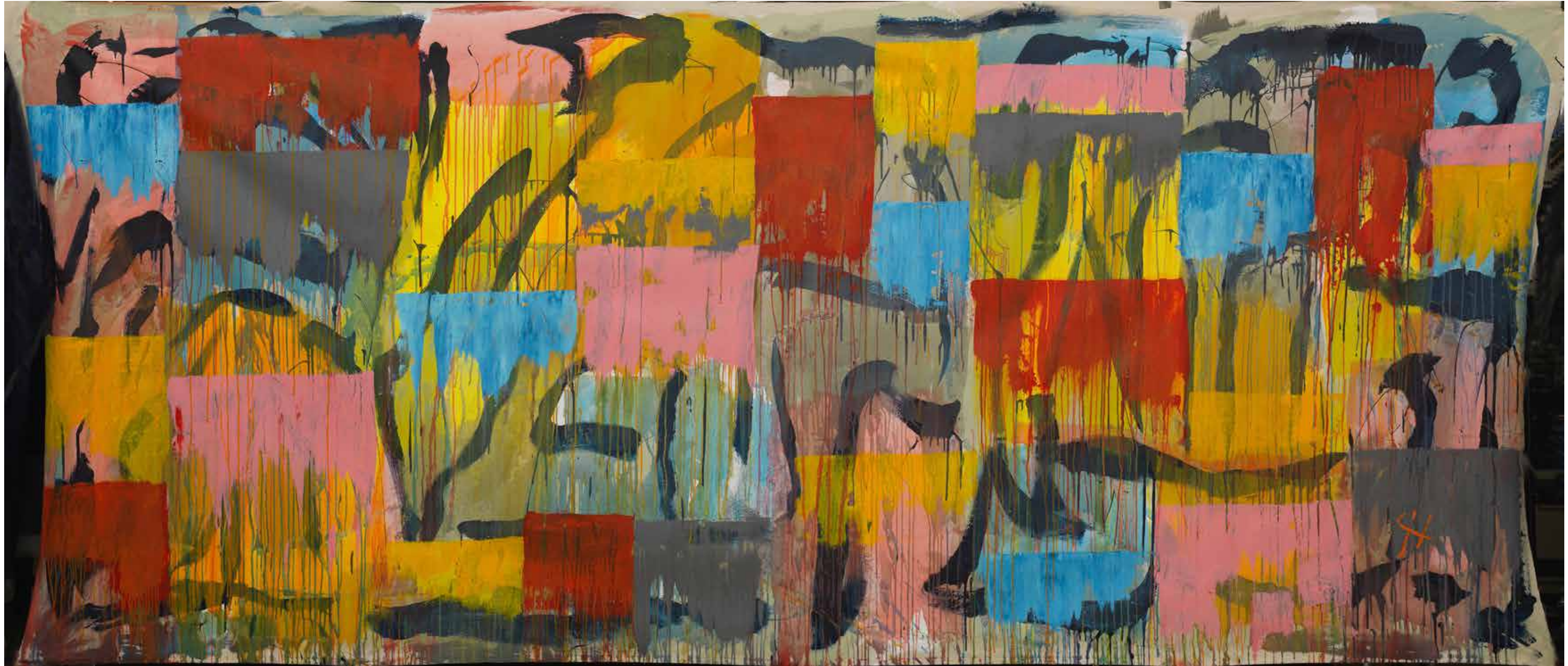
Color Blocks No. 5 Unstretched Canvas 52 x 122 inches