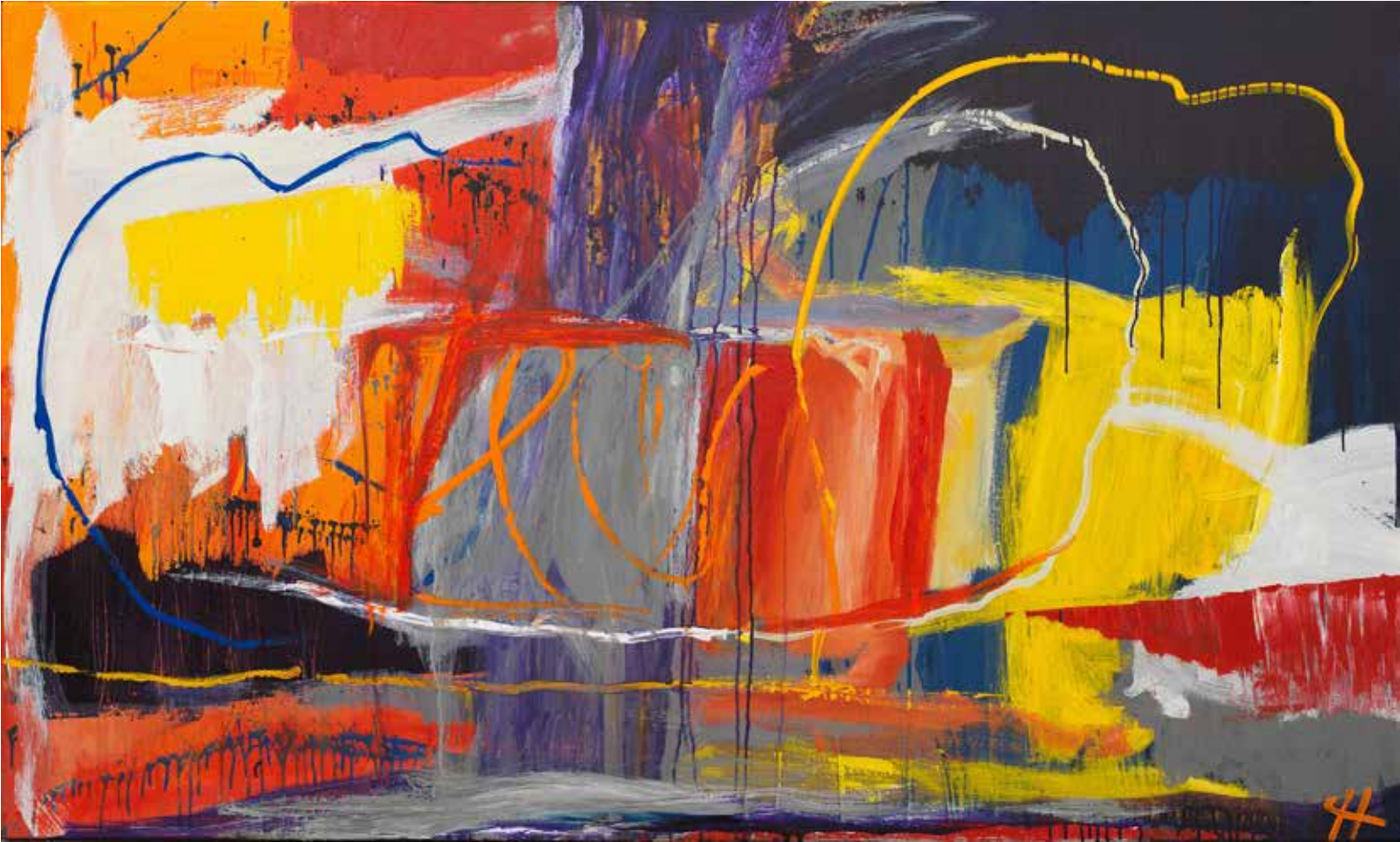
Dreaming in Color 36 x 60 inches