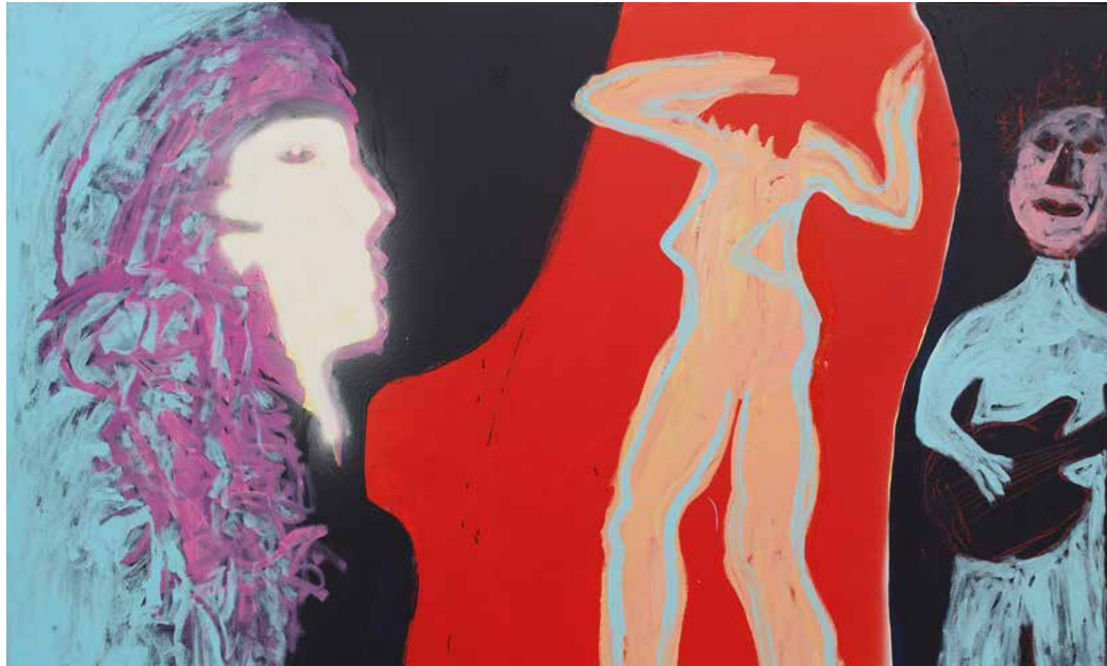
After Midnight 36 x 60 inches

After midnight anyone can lose their head (maybe even literally) but let's not go there tonight