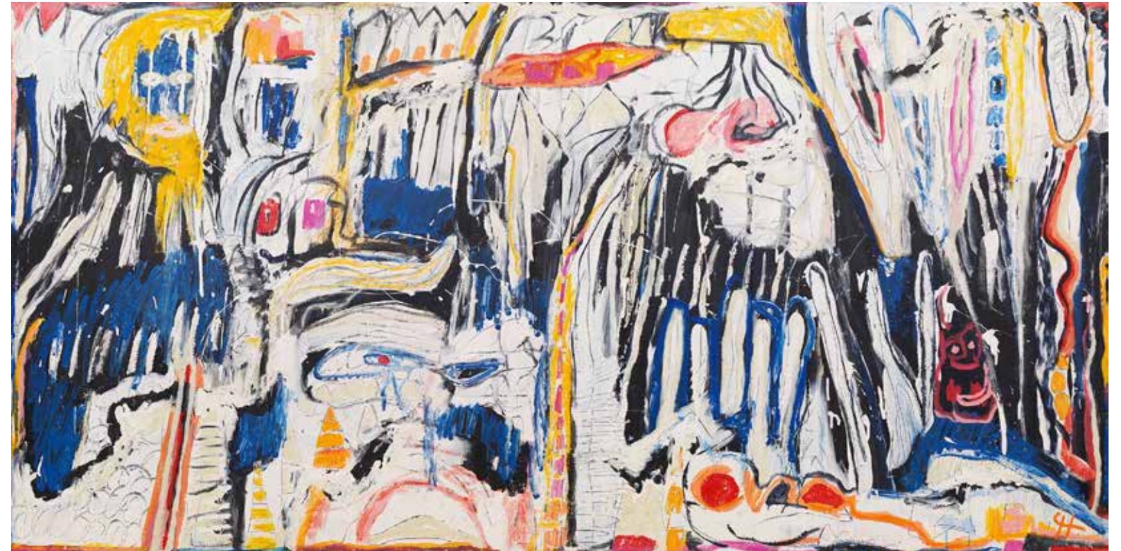
Hugge 48 x 96 inches

All the delicious elements of a Danish Party, an angry old drunk guy, a topless woman, a smiling fat man and a strange animal