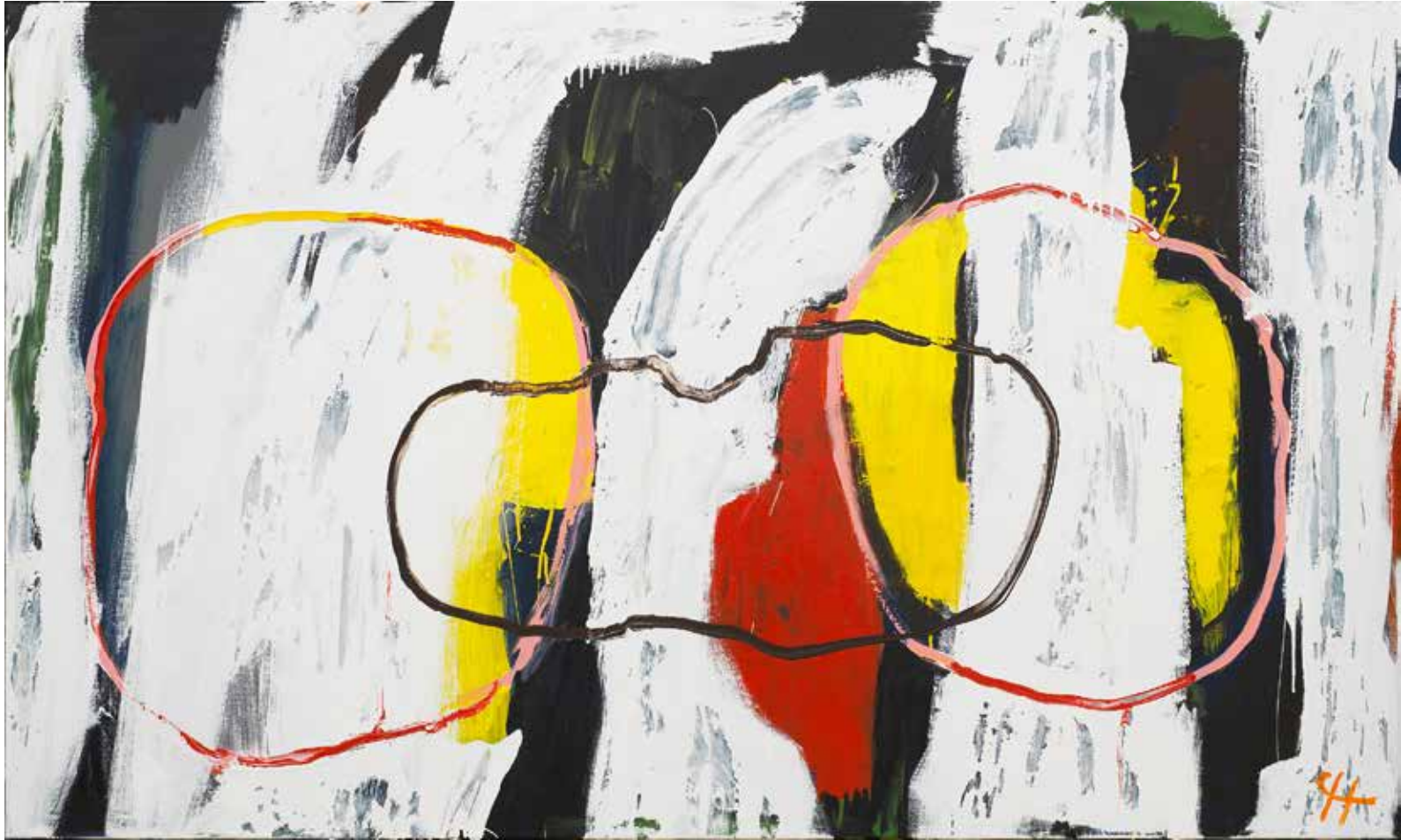
United 36 x 60 inches