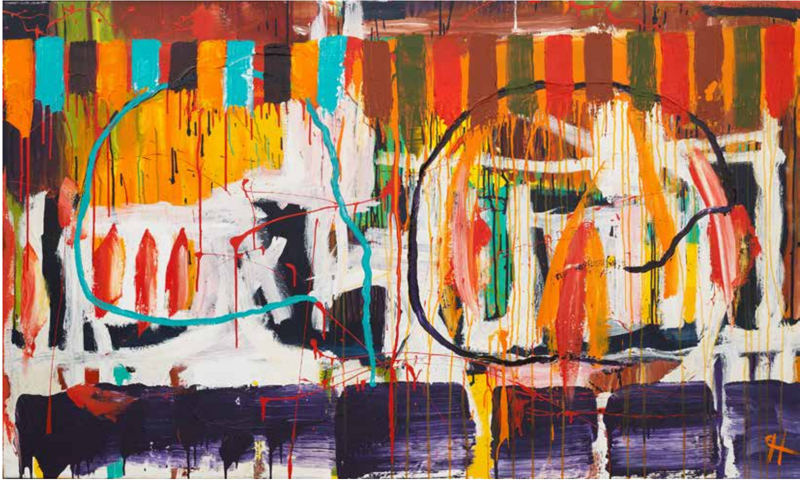
Looking Out 36 x 60 inches