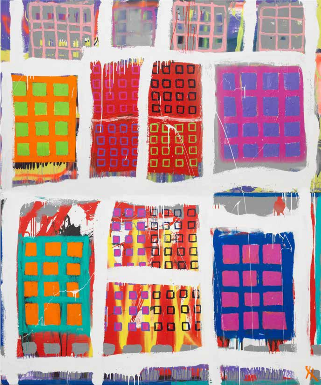
Isolation 72 x 60 inches