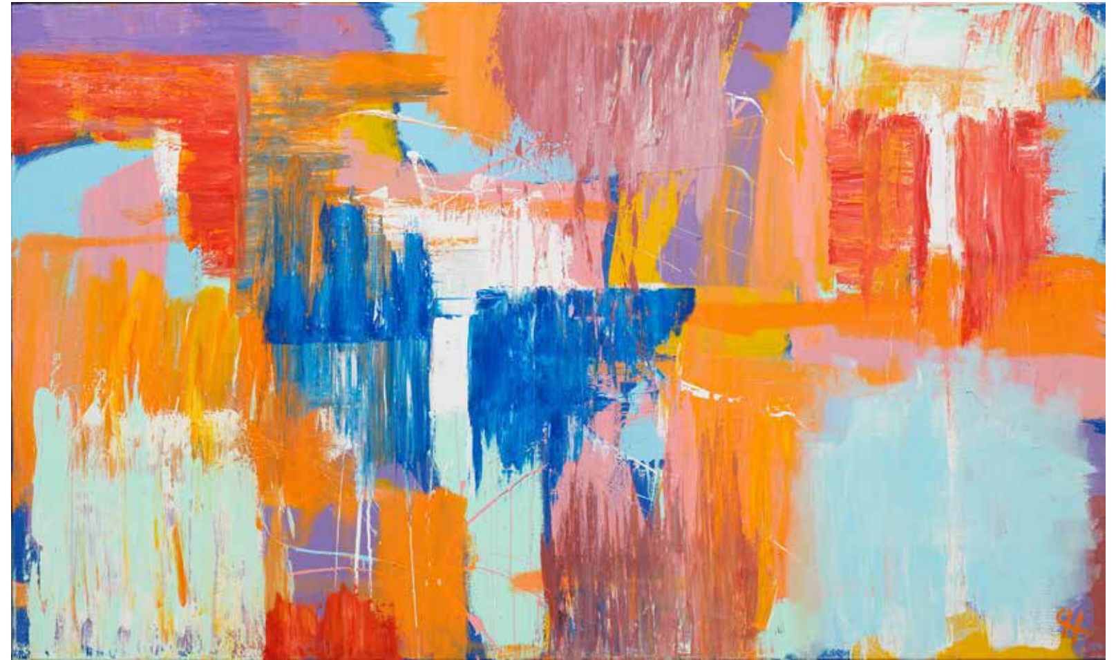
Canyon 36 x 60 inches