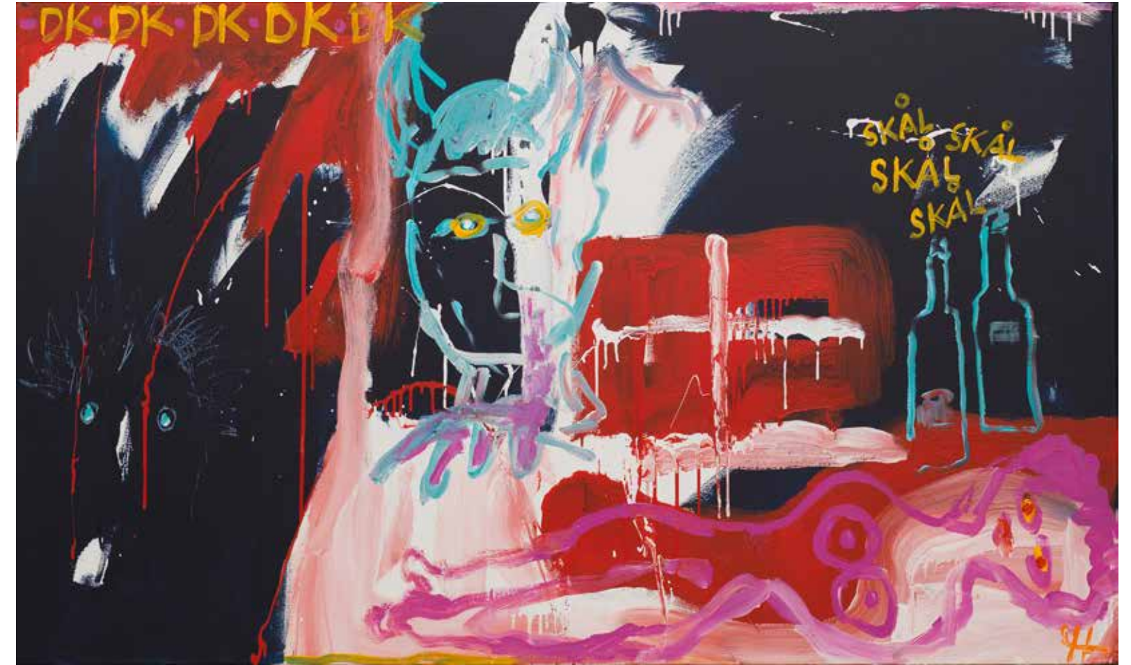
Skål 36 x 60 inches

Too many skåls for this young lady waking up from a patriotic nap under the Danish flag