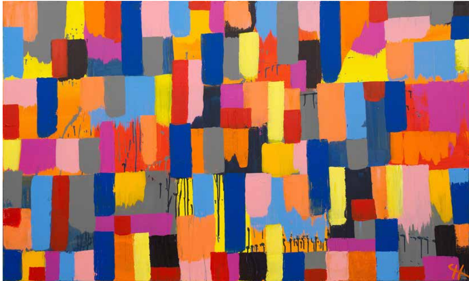
Color Blocks No. 3 36 x 60 inches