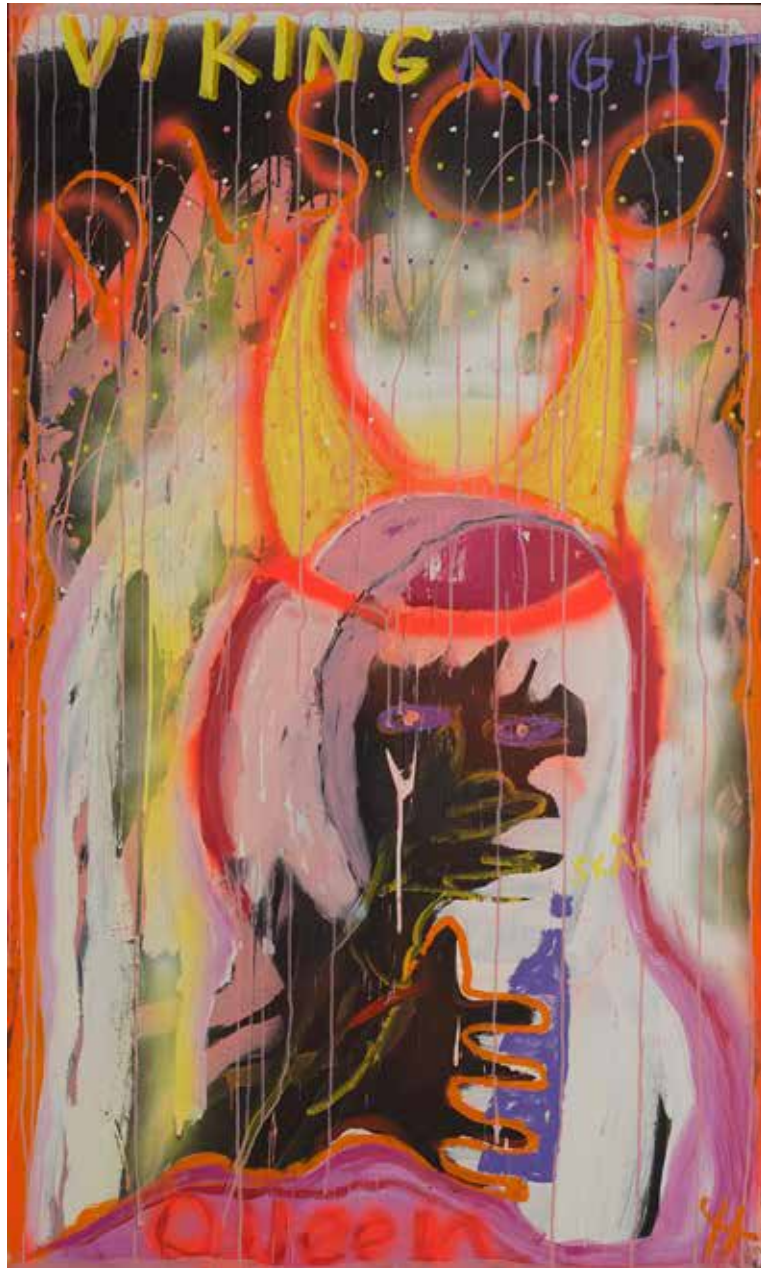
Viking Night 60 x 36 inches

Viking Night at the disco. Far fetched and festive