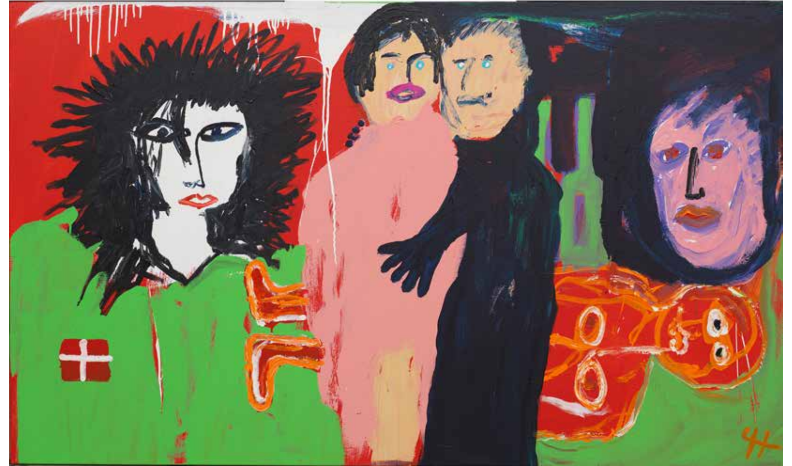
Let the Dance Begin 36 x 60 inches

My boy is ready, but the guy to the right has had enough. Let the dance begin!