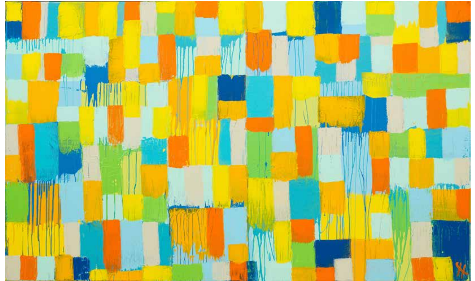
Color Blocks No. 4 36 x 60 inches