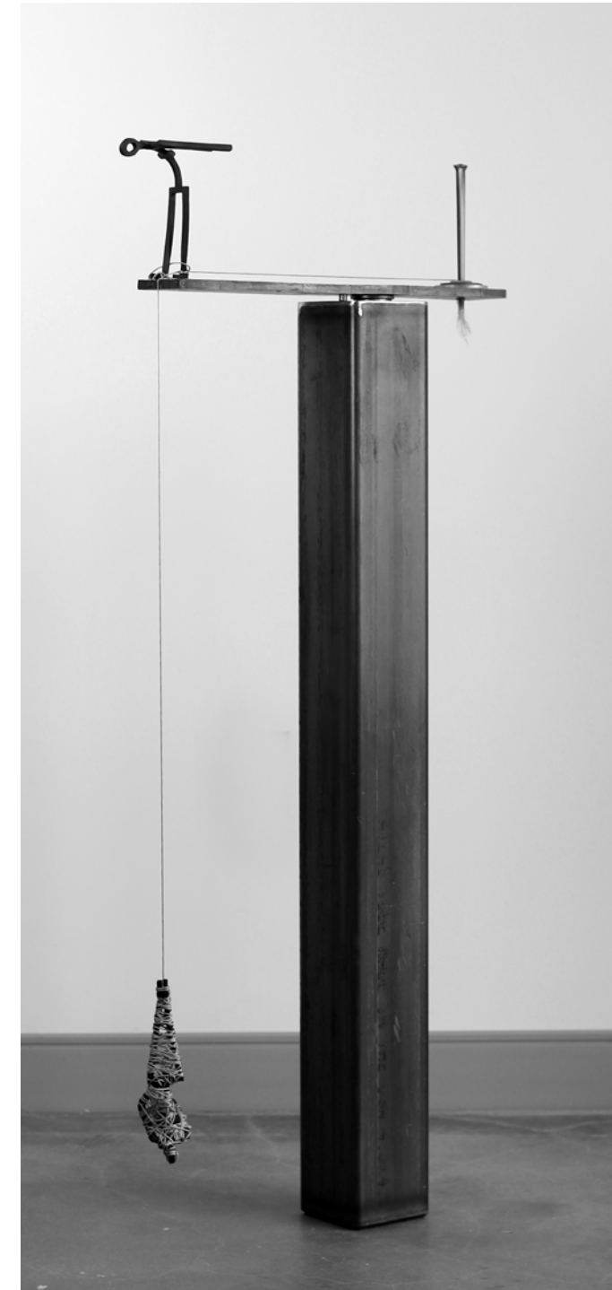
What Exactly it is , 55" x 24" x 5", steel, wallpaper, string, iron nail, cast plastic, acrylic sheet, copper paper, liver of sulfur, hardware, magnets, 2020

Elasticity is one of the fundamental characteristics of queer; its very nature is fluid. Thus, this series of artwork is faulty, even pointless, in its endeavor to exact queerness through form.