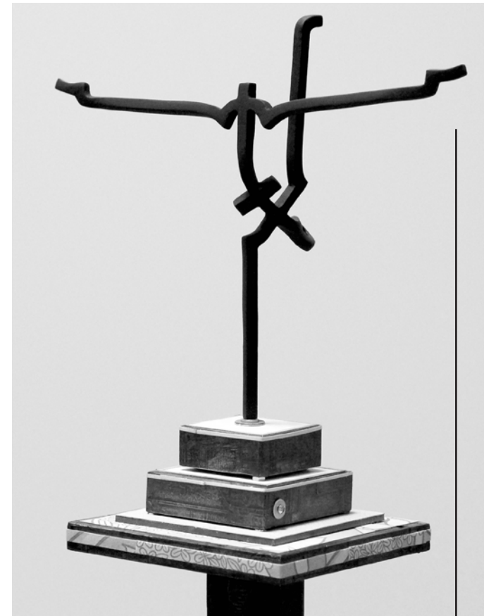
A Performative Surprise, 60.5" x 10" x 3", railroad jack, steel, wallpaper, cast plastic, acrylic sheet, copper paper, liver of sulfur, hardware, magnets, 2021