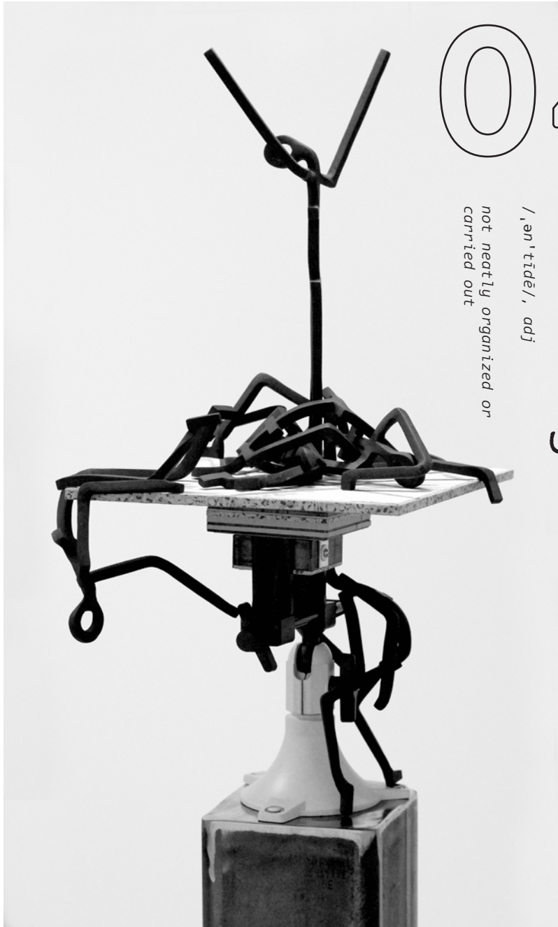
An Inherently Untidy Experience, 61" x 12" x 12", vise, steel, wallpaper, cast plastic, acrylic sheet, copper paper, liver of sulfur, hardware, magnets, 2021