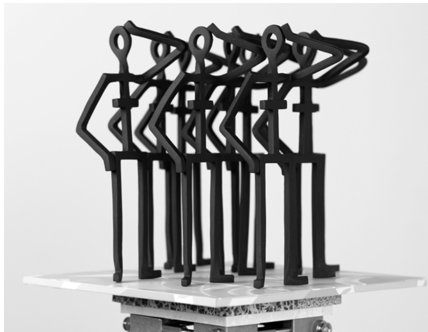
Am I that Name? 22" x 54" x 15", car jack, steel, wallpaper, leather, cast plastic, acrylic sheet, copper paper, liver of sulfur, hardware, magnets, 2021