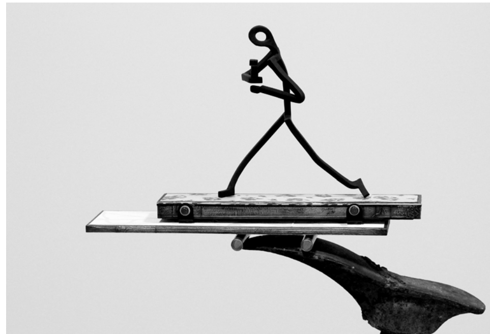
A Strict Devotion to an Ambiguous Task, 39" x 18" x 8", shoe form, caster, wood, books, steel, wallpaper, cast plastic, acrylic sheet, copper paper, liver of sulfur, hardware, magnets, 2021

An attempt to explore queer through visual art is self-contradictory as it explains queer fluidity through the materiality of artwork that is fixed and static.