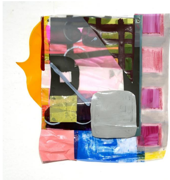
Ivelisse Jimenez, adapted variant file #1 , 2020, Enamel over vinyl

Ideologically, to reconfigure Western culture, so it might be less elitist (obscure) and more socially and politically meaningful, Modernism and its critique were to be dismantled because they were too formalist, too esoteric, too high-minded, too chauvinistic, too alienating, too racially exclusive, etc. Collaterally, the type of abstract painting these artists' work to sustain has been critically marginalized. Problematically, the post-Modern culture of approachability, replication, and identity, which took its place has been used by neo-liberals and neo-conservatives alike to instrumentally and institutionally advance the logic of standardization, purposefulness, and the transactional, which stands in stark contrast to the work of these artists.