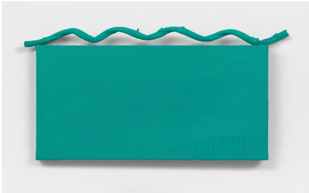
Mary Heilmann, Glassy Wall , 2020, Acrylic on wood and canvas, 9 x 18 1/4 x 1 1/8 inches

Nina Yankowitz spray painted and stained unstretched and pleated printings from the late 60- early 70s, concretely externalize the tensions and conflict of painting's inherent Illusion and literalism. Unlike Cohen, Yankowitz aesthetic is lyrical as well as physical. As with many post-Minimalists and Feminists, Yankowitz at the time was concerned with what her chosen/ given materials would allow her to do—the canvas came to be draped forms, and the formless sprayed or stained paint a unifying multi-colored field of color at times descriptive of the form and at other times not.