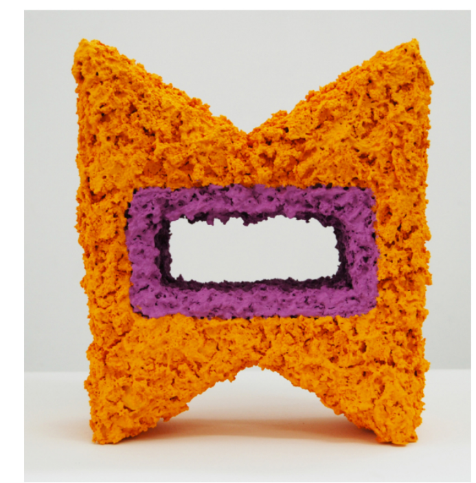
Rebecca Murtagh, Aperture: Orange Burst and Ultra Violet, 2015, Courtesy of the artist

Project 8 and color as form / form as color C2C Project space, San Francisco September 19–October 18 (by appointment)