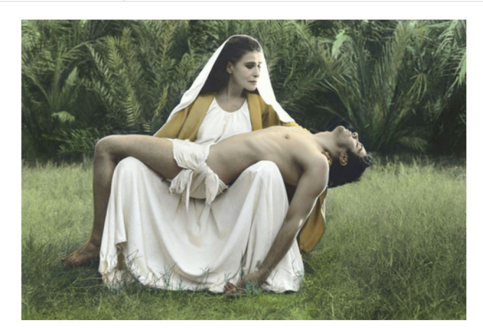
North America's Must-See Exhibitions This Fall by The ArtSlant Team

HOME MAGAZINE CALENDAR GALLERIES ART SHOP ARTISTS JOBS ADD