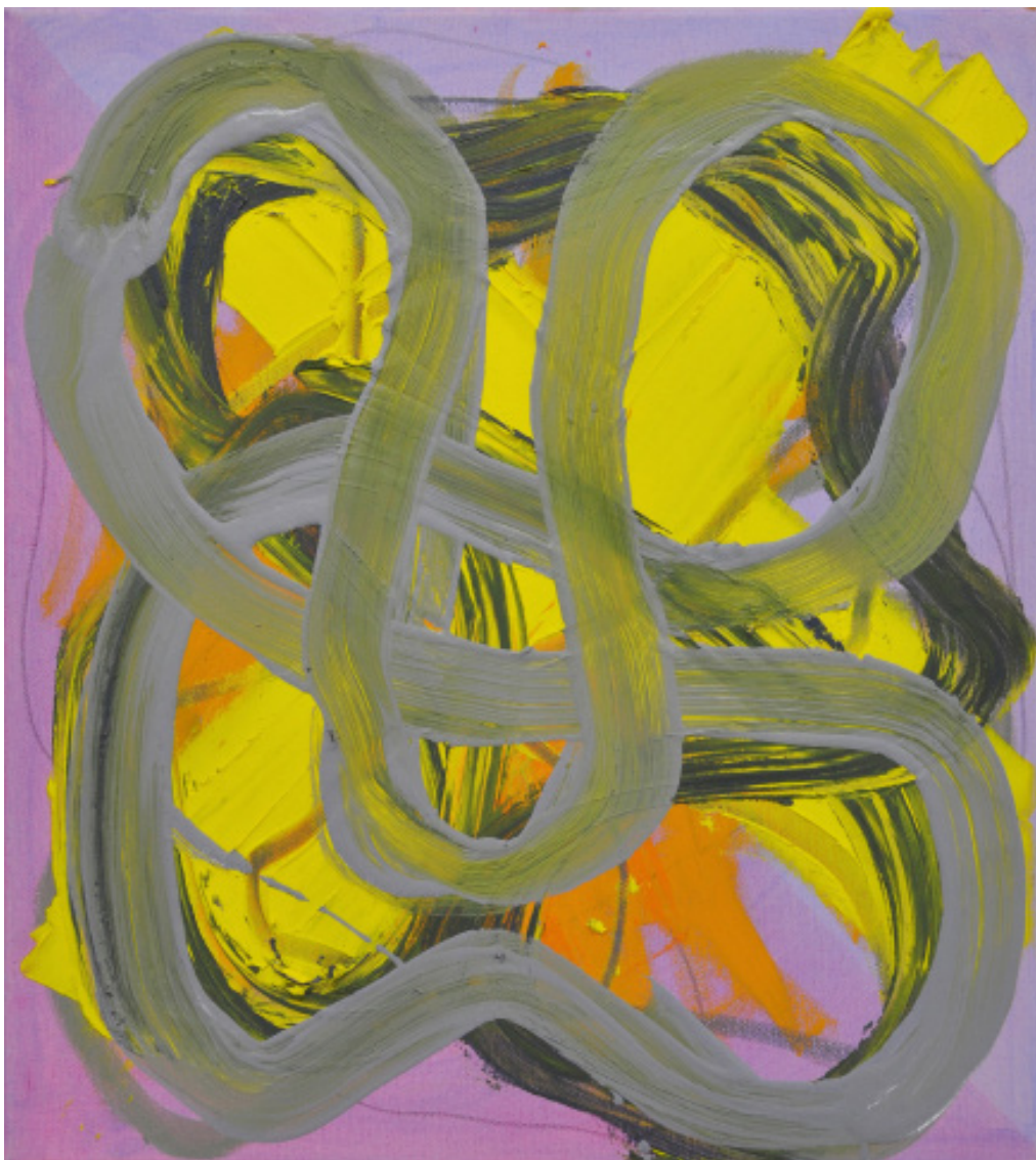
Toro 2015 oil on linen 19 x 17 in.