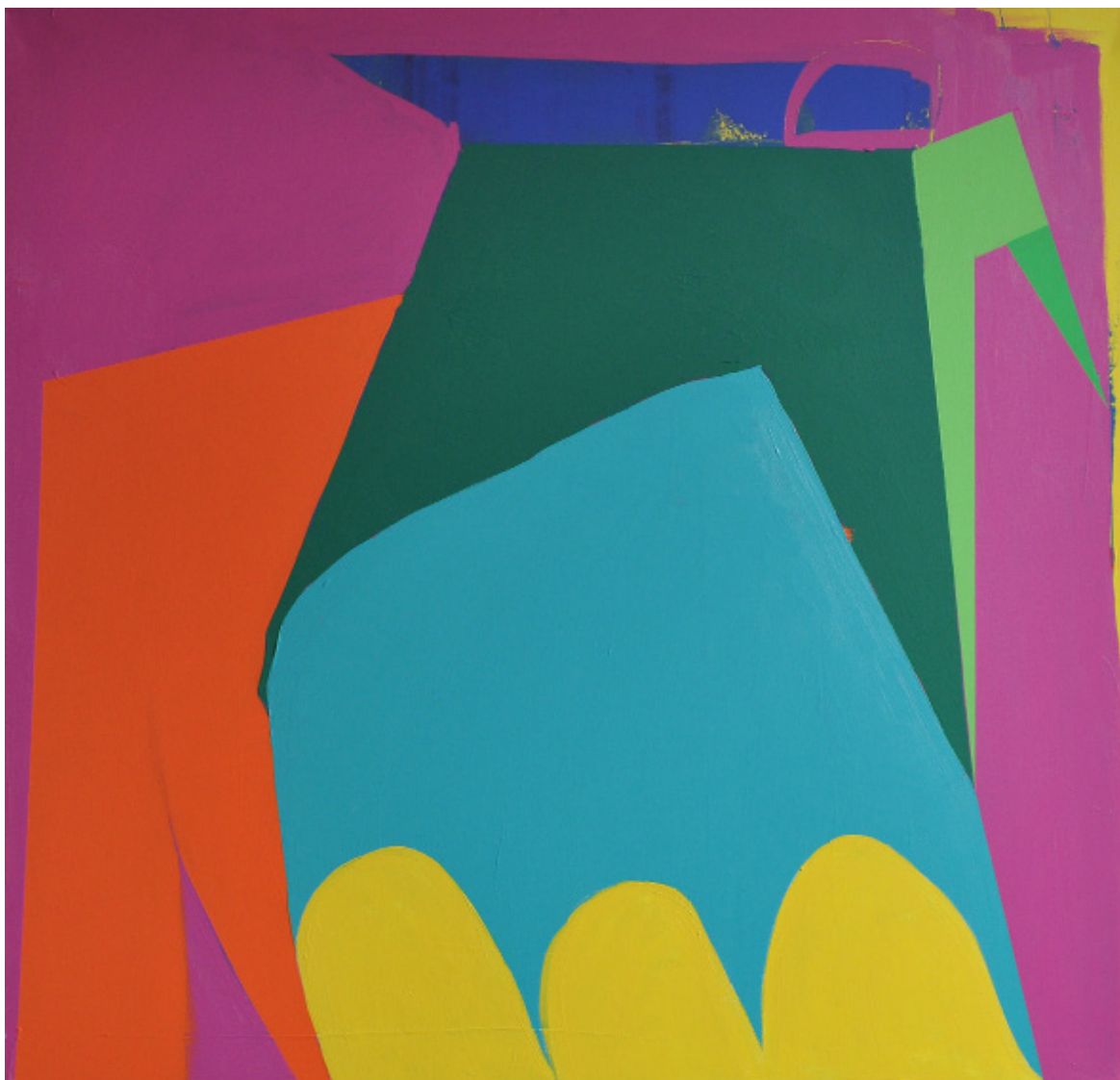
Devil Bat 2015 acrylic on canvas 48 x 50