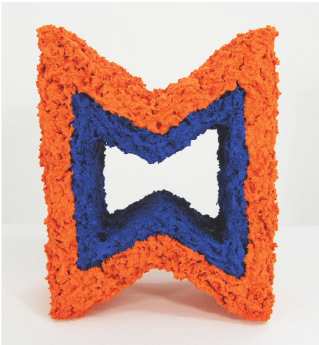
Aperture: Orange Burst and Blueblood 2015 reclaimed house paint, wood and mixed media 10 x 8 x 4 in.