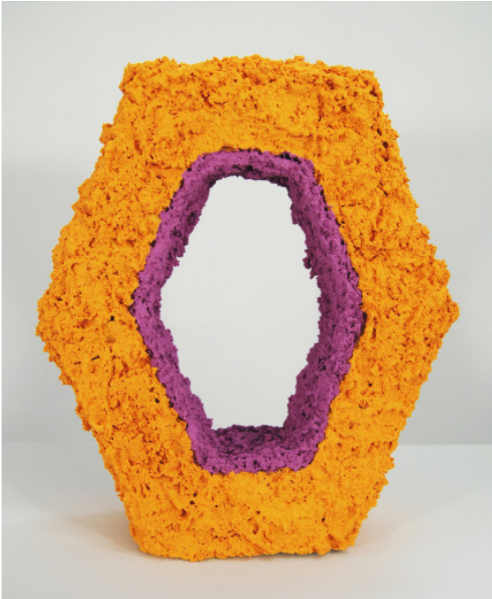
Aperture: Orange Burst and Ultra Violet (Hexagon) 2015 reclaimed house paint, wood and mixed media 15 x 13 x 5 in.