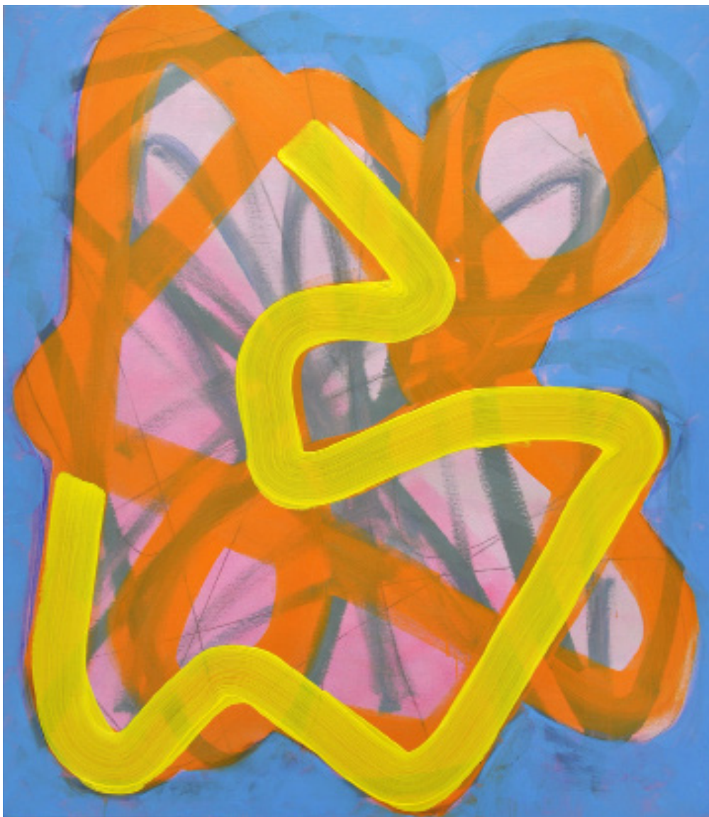
Zephyr 2015 oil on linen 40 x 35 in.