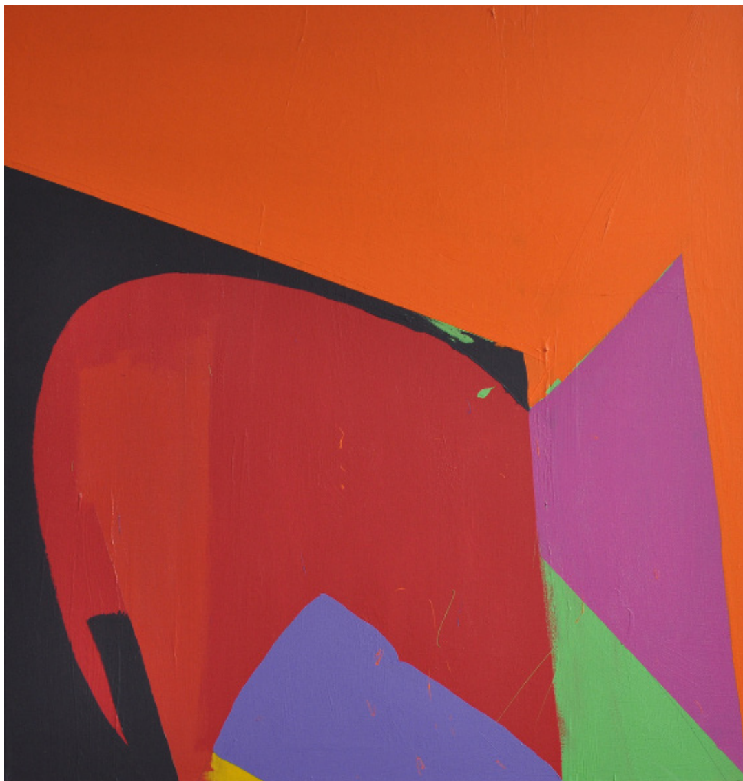
Big Corsair 2015 acrylic on canvas 50 x 48 in.