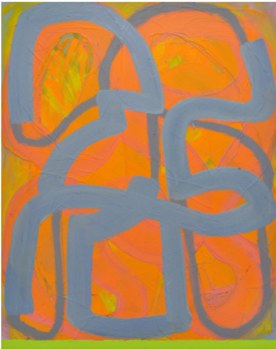
Equinox 2015 oil on linen 40 x 32 in.