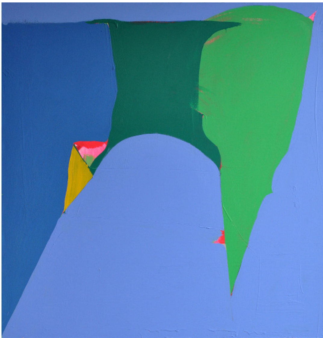
Lucifer 2015 acrylic on canvas 50 x 48 in.