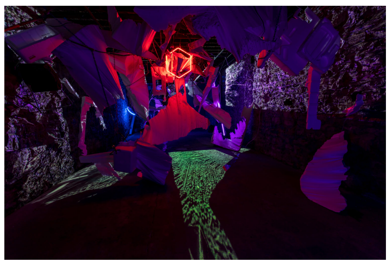
Tra Bouscaren's "Night Blooms', 2019.

The timeline of events are important given that this crisis began festering only days before Barbara's demise and ensued for several months following her passing. The stress Olijnyk was under for weeks prior to her death must have