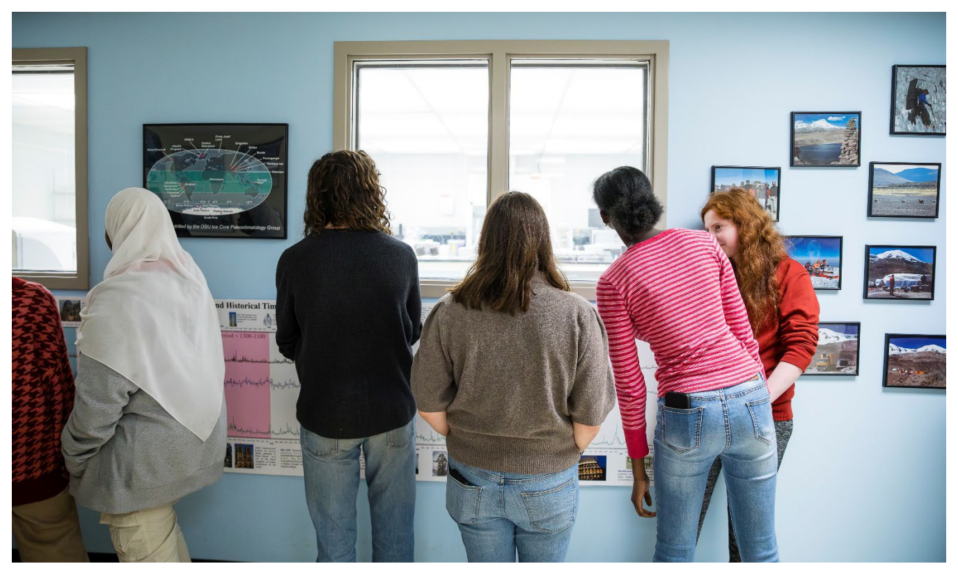
K-12 students at Byrd Polar and Climate Research Center as part of Expanded Classroom.