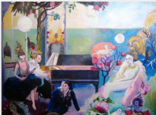
The Skylight Gallery

One particularly alluring work of art in the show is an oil painting by Patricia Wersinger known as Cythere which was inspired by Jean-Antoine Watteau's painting Pelerinage a l'île de Cythere . Wersinger's replication is an aesthetically pleasing blend of soft, pastel colors. The subjects are a group of women who appear to be in a dreamy state of mind and are dressed in fancy 18th century attire, with a view of the ocean in the background.