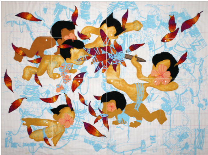
The Skylight Gallery