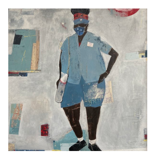
24 Carat Art by Debbie Taylor-Kerman; Mixed Media on Wood; 24x24in; 2020

Preparing for the upcoming show, "Women of Substance: Past Present and Future," the organizers delighted in unwrapping all the art – as if were the holidays.