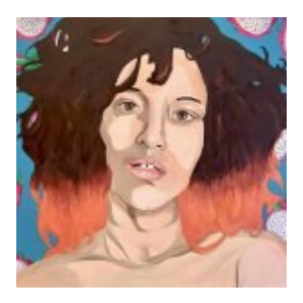
Amante de la fruta del dragón Art by Tafy LaPlanche; Oil on Canvas; 24x36in; 2021.