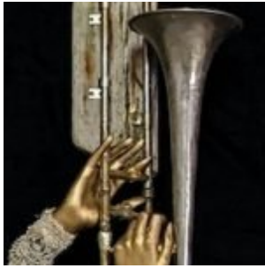
Homage to Melba Liston Wilhelmina GrantCooper; Assemblage; 45x15x9 in; 2023