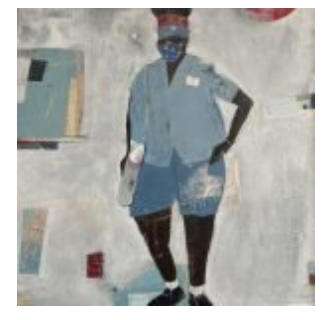
24 Carat Art by Debbie Taylor-Kerman; Mixed Media on Wood; 24x24in; 2020