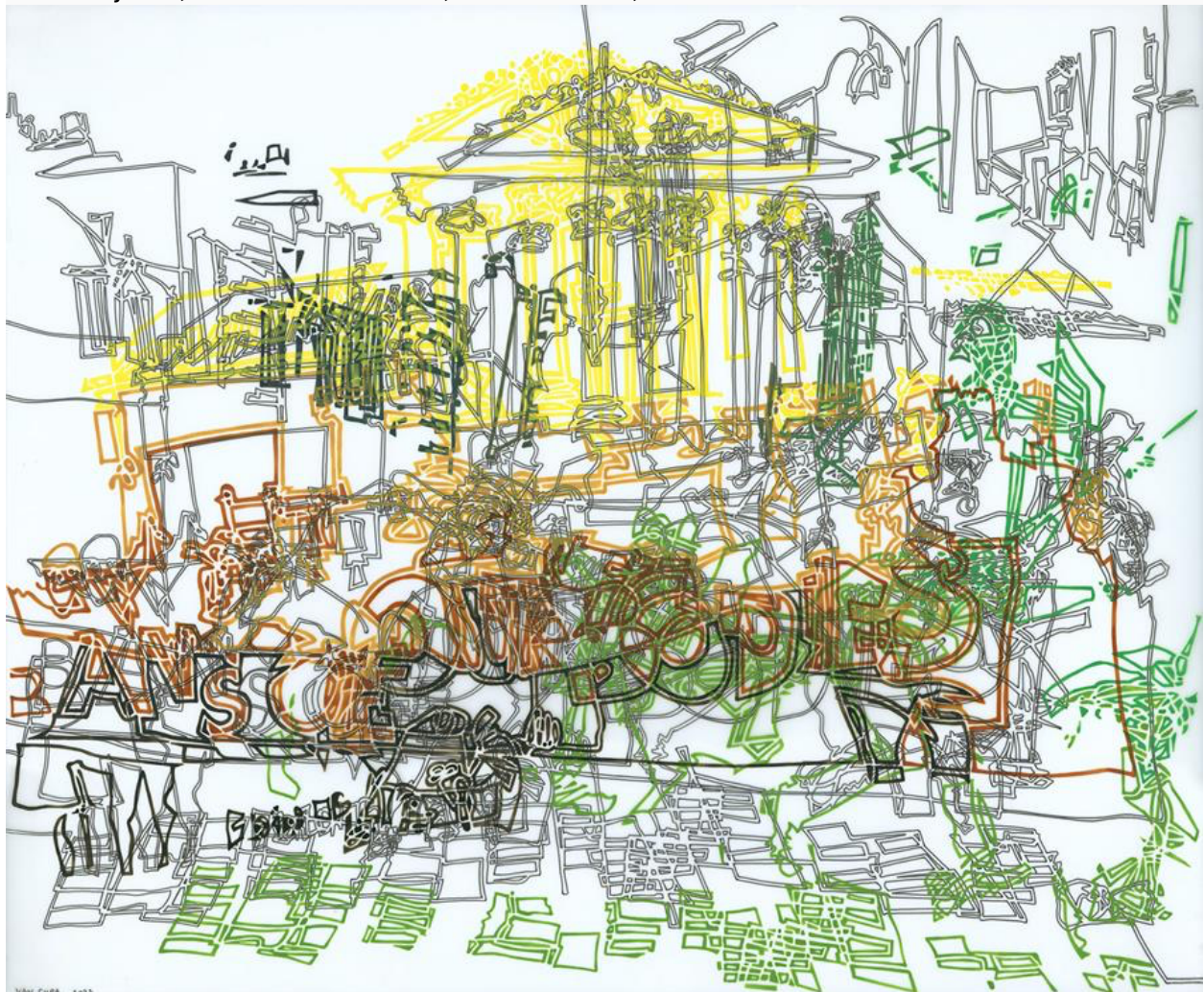
Marjorie Van Cura, Untitled 0623 , ink on translucent film, 14 x 17 in.

DFN Projects; 16 East 79th Street, Garden Level, New York