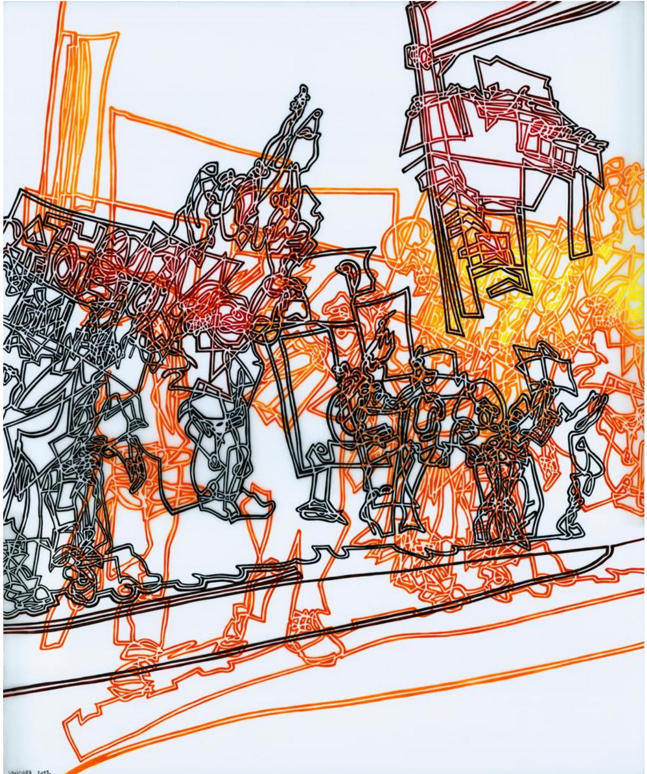
Marjorie Van Cura, Untitled 0822 , ink on translucent film, 17 x 14 in.

CLICK HERE FOR A PRIVATE VIEW OF THE EXHIBITION