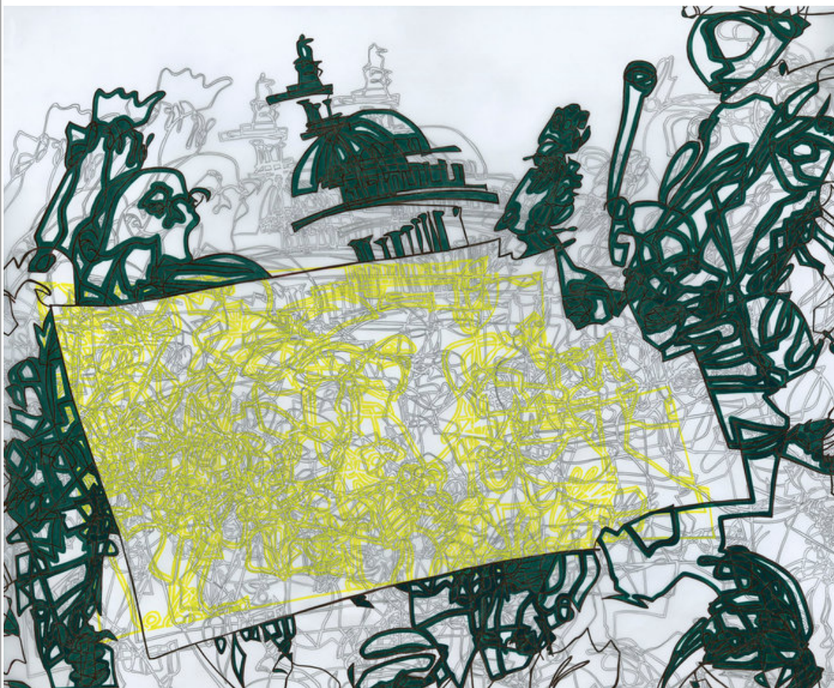
Image Above: "Untitled 0321", 2021, graphite and ink on translucent film, 14 x 17 inches

"Marjorie Van Cura is driven by the ever-evolving realities of the present day. The culmination of thirty years of painting, Van Cura's recent landscape- based abstractions are inspired by pivotal moments in contemporary history as represented by an inescapable ubiquity of mass media."