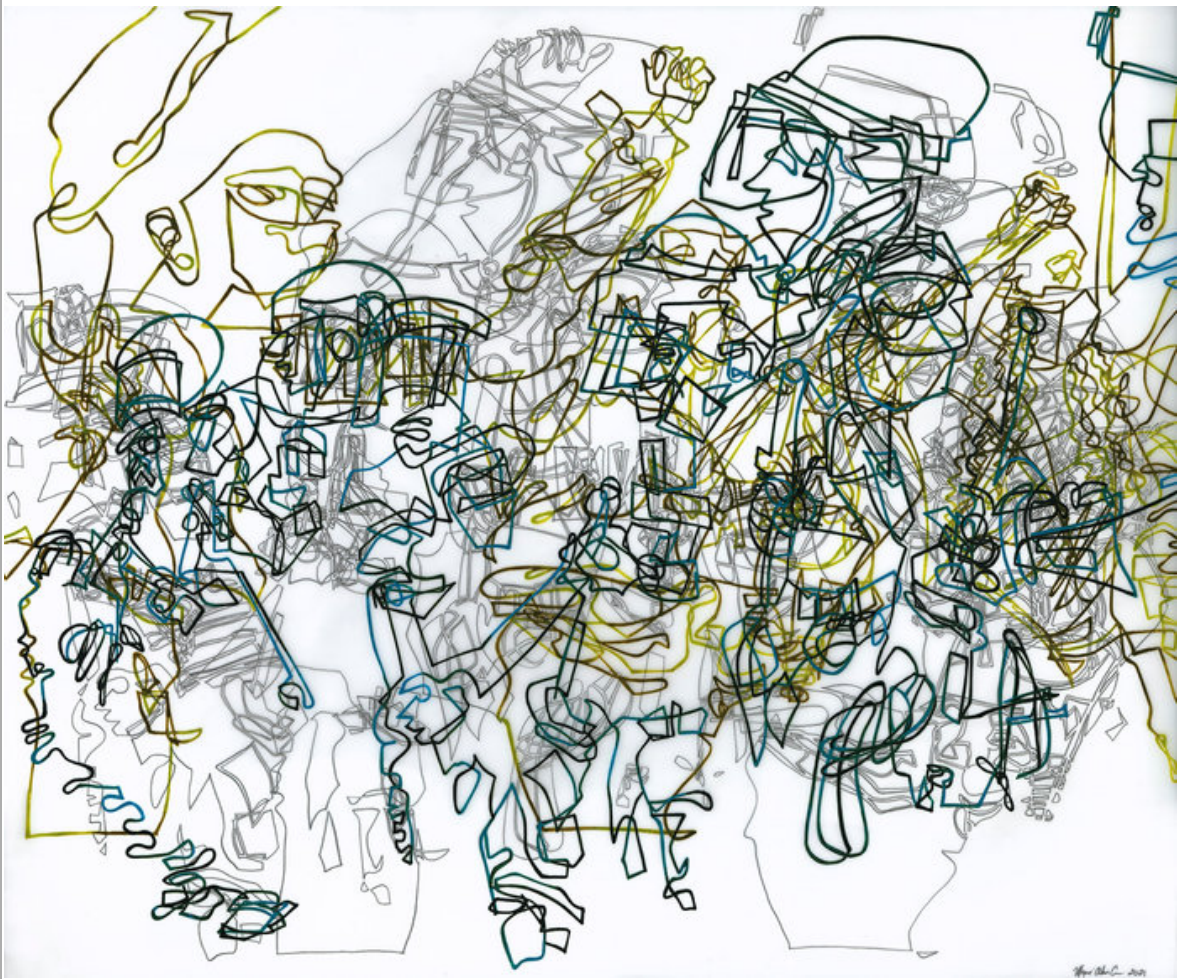
"Untitled 0821" 2021, graphite and ink on translucent film, 14 x 17 inches

"Deeply impacted by environmental and sociological phenomena that continue to transform humanity, Van Cura pinpoints real life current events-based images that are striking in both conceptual paradox and aesthetic complexity, using them as a departure point for her densely-layered paintings. These works distill the familiar yet alarming urgency of the moment into a language that is graphic and expressionist, in order to create an entirely new and foreign space."