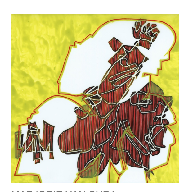
MARJORIE VAN CURA UNTITLED 0921, 2021 Ink on translucent film 6 x 6 inches