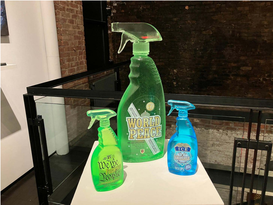
Works by Airco Caravan