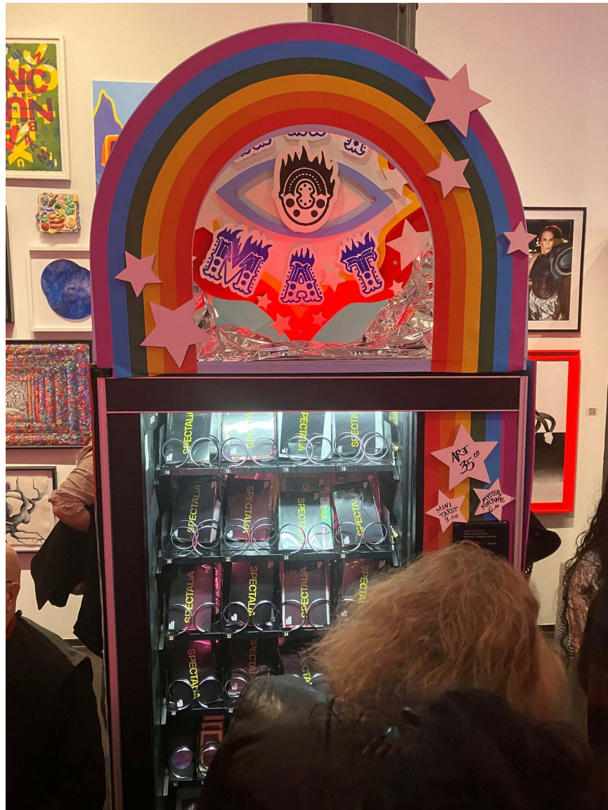
The ART-O-MAT sells mini artworks for $35