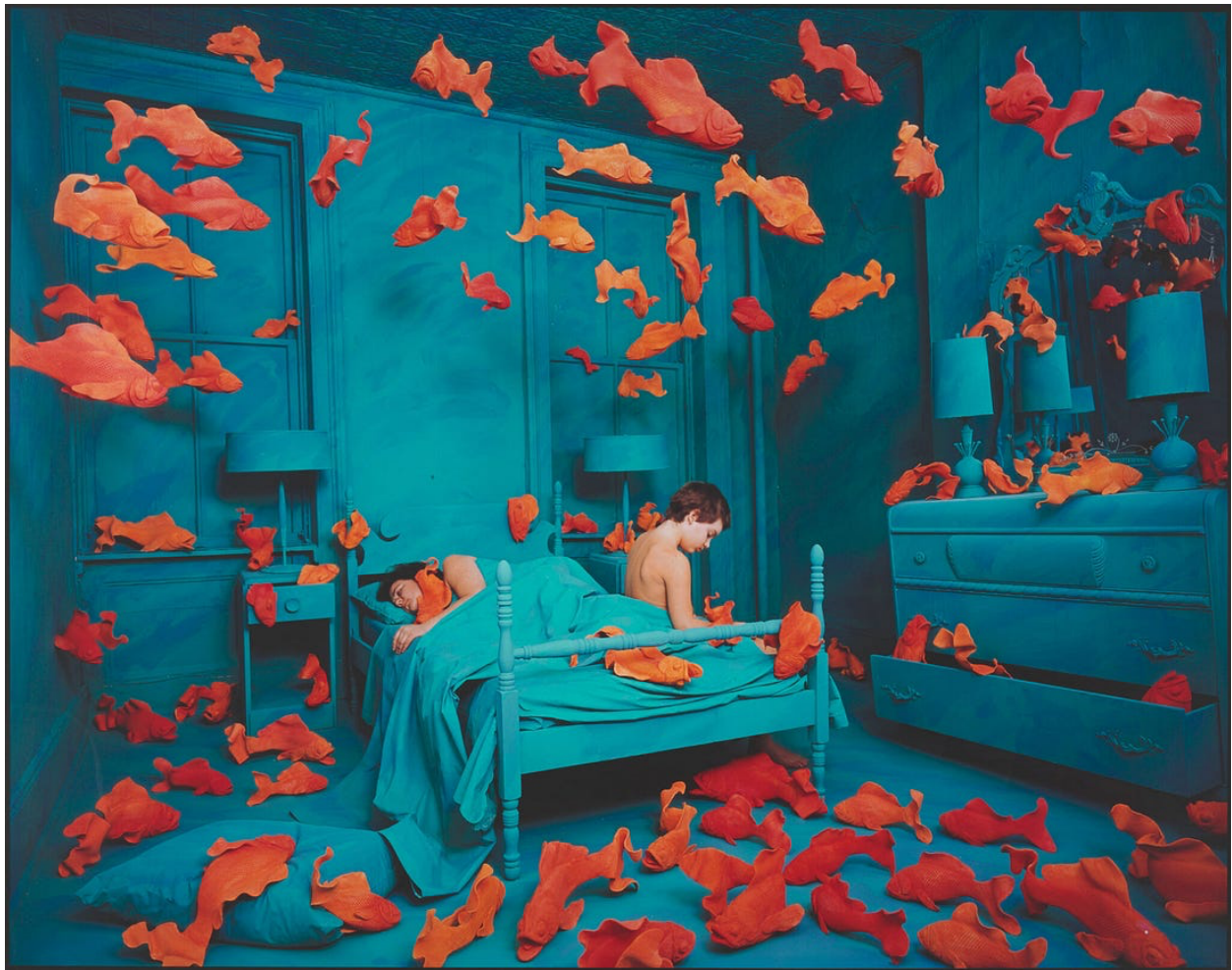
Sandy Skoglund (American, b. 1946). Revenge of the Goldfish , 1981. Cibachrome print (edition 7 of 30).

“The Every Woman Biennial, founded by C. Finley, originally launched as The Whitney Houston Biennial in 2014, as a one-night extravaganza of art and performance by women. It was conceived as a tongue-in-cheek response to the Whitney Biennial in 2014, not to negate but to supplement opportunities for more women artists outside the Whitney Biennial. It evolved into extended exhibitions and performance Biennials, always based in NYC, as well as simultaneous editions in LA and London. It has provided a platform for thousands of women and non-binary artists for their work to be exhibited, performed and collected.”