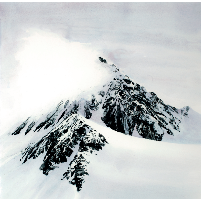
Ice Cloud, Antarctica (2019) Emma Stibbon. Intaglio with watercolour, 575 x 580 mm. At Bastian Galerie