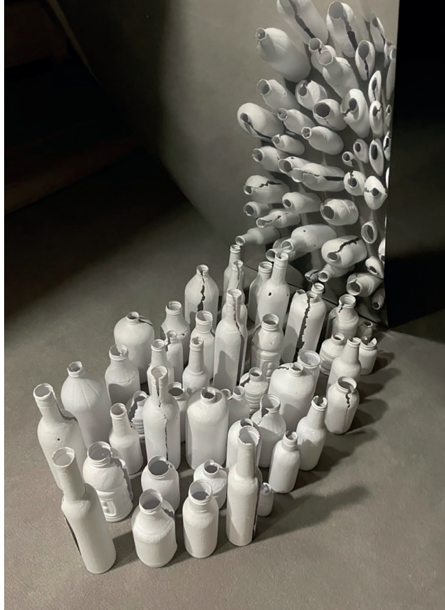
Installation view: Between Presence and Absence: The Illusionary Reality (2022) Sun Young Kang. Paper cast using discarded paper, dimensions variable. At Minnesota Center for Book Arts