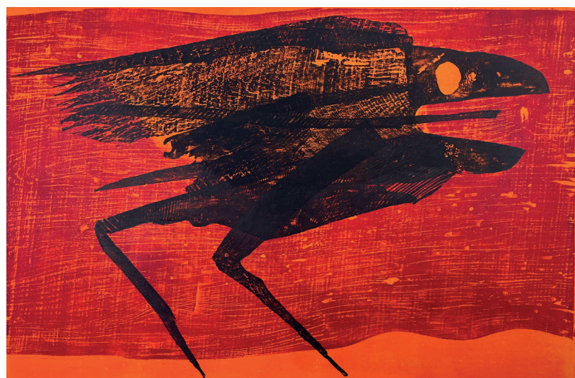
Young Bird (c.1967) Tadek Beutlich. Relief print (wood and lino), 520 x 790 mm. At Morley Gallery