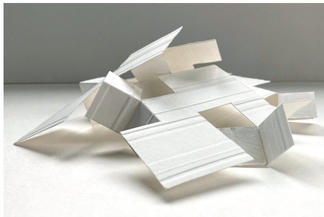
L.XXIX.LXX.III.II.VI.IV.I (2022) A. Rosemary Watson. Hand-printed cut and folded, blind embossed collagraphs, dimensions variable (c. 120 x 70 x 90 mm). At New Haus Gallery