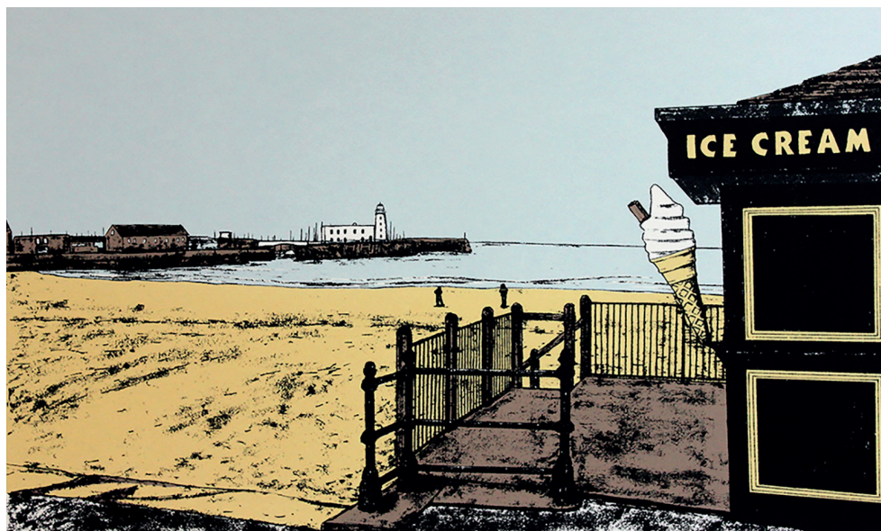
Scarborough (2020) Sarah Harris. 4-colour screen print, 213 x 345 mm. At The Craft Centre & Design Gallery