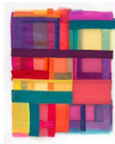
Footing fabric, thread, pins, plastic 29" x 24" framed: 34" x 28"