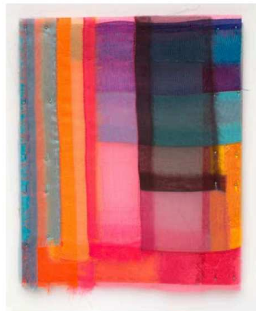
Start fabric, thread, pins, plastic, paint 7 1/4" x 6 1/2" framed: 11" x 10"