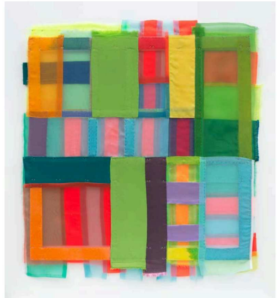
Zone fabric, thread, pins, plastic 22" x 20" framed: 26" x 24"