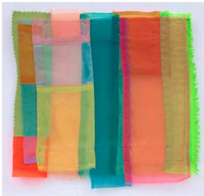
Guide fabric, thread, pins, plastic 10" x 11" framed: 14" x 15"