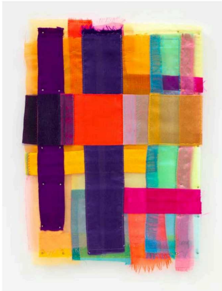
Mast fabric, thread, pins, plastic 10" x 7" framed: 14" x 11"