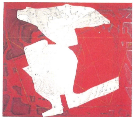
Above: Images of Interior Pages