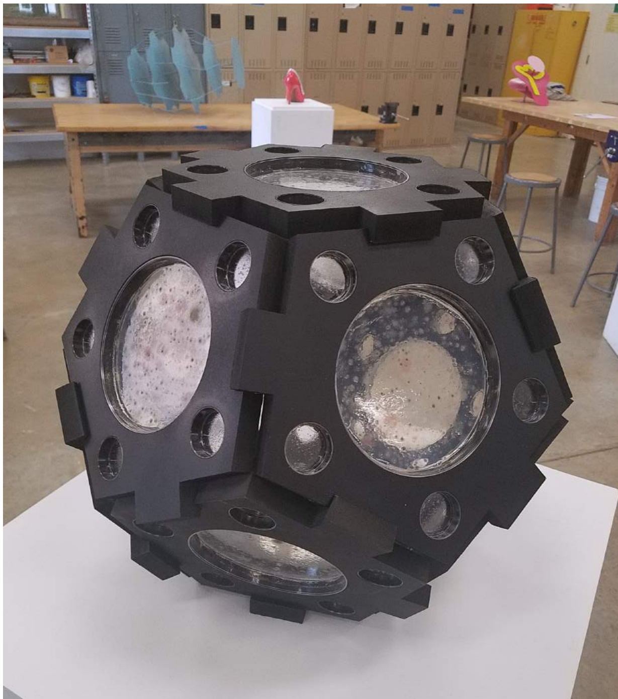
Student Work Holden Paz Spring 2019 Advanced Sculpture, Death Star MDF, mold cultures, protein suspension, petri dishes