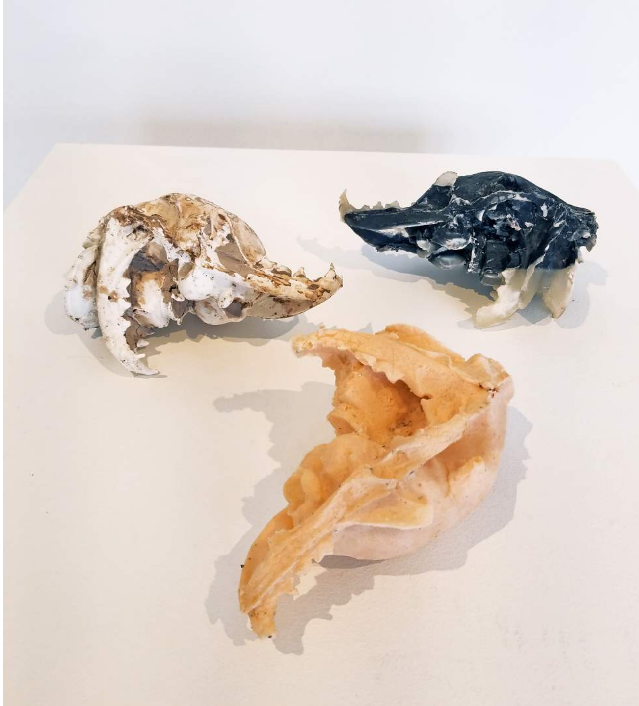
Student Work William Hall, 2019 3D print in PLA, cast multicolor resin and cast foam from combined 3D model of a cat skull and truck engine