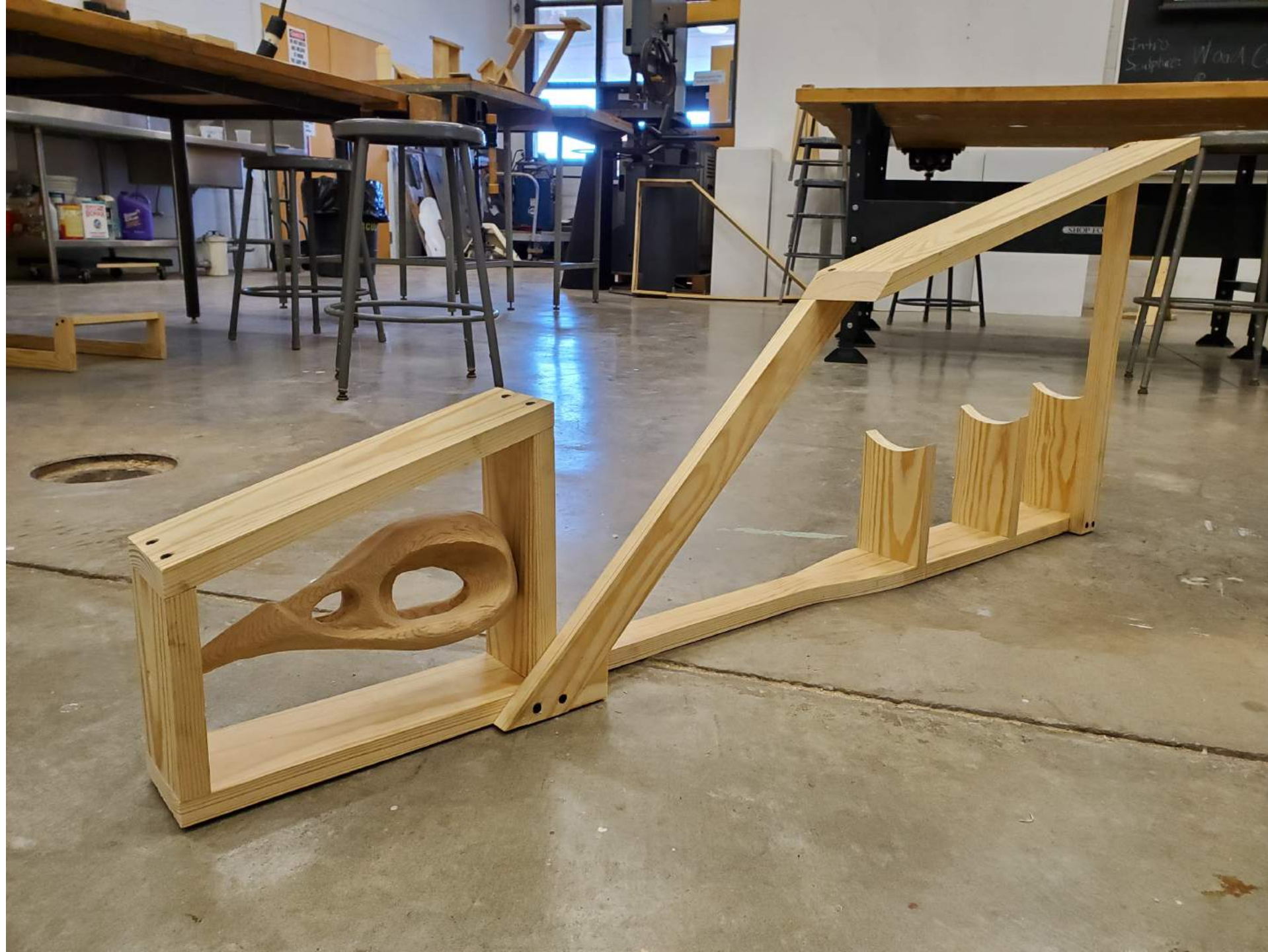
Student Work Ozzy Delatore, Intro Sculpture, Auburn University Wood Body prop Construction with cedar carving