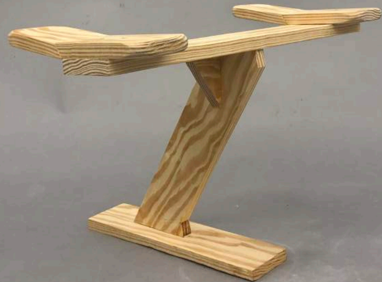
Student Work Ester Santee, 2022 Intro Sculpture, Texas A&M Wood Construction/Body Prop