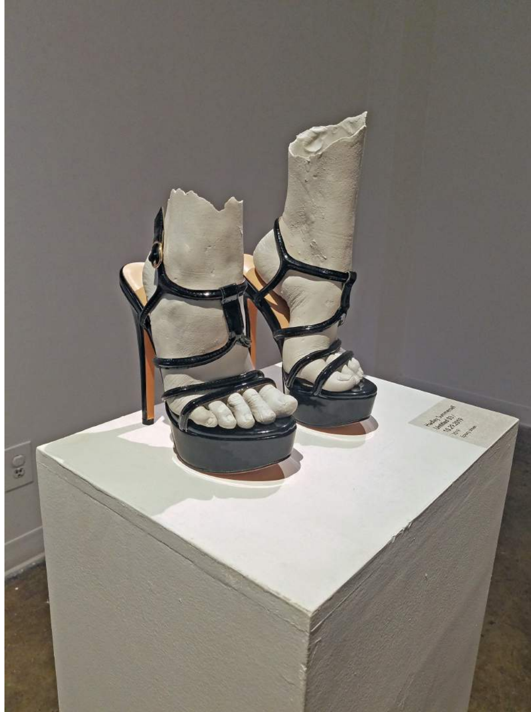
Student Work Hadley Summersell Untitled, 003 , 2019 free form epoxy cast, leather shoes Senior Thesis exhibit