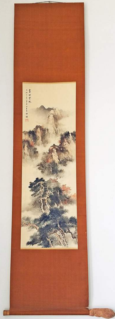
Student Work: Holden Paz, 2018 Chinese Scroll, sweet potato Object Poems

Students were asked to make written lists of objects and materials and to choose two objects from their list to seamlessly combine. Emphasis was placed on the two objects holding distinct but disparate subjective meanings.