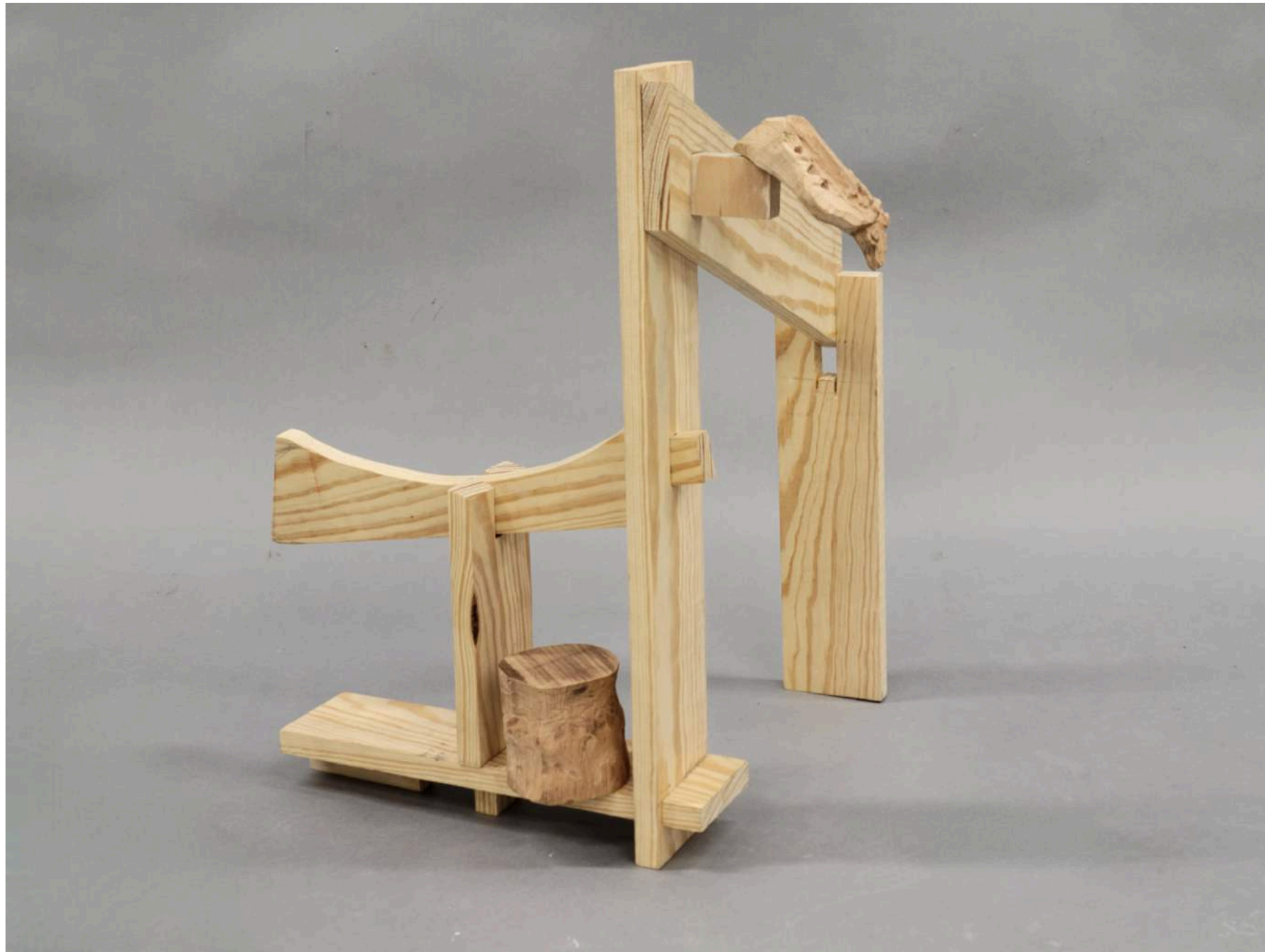
Student Work Lauren Labonte, 2022 Intro Sculpture, Texas A&M Wood Construction with cedar carving