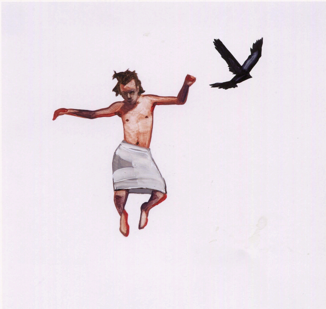
Still from Get Naked , Video, 2008, Sound design by Paul Fauerso