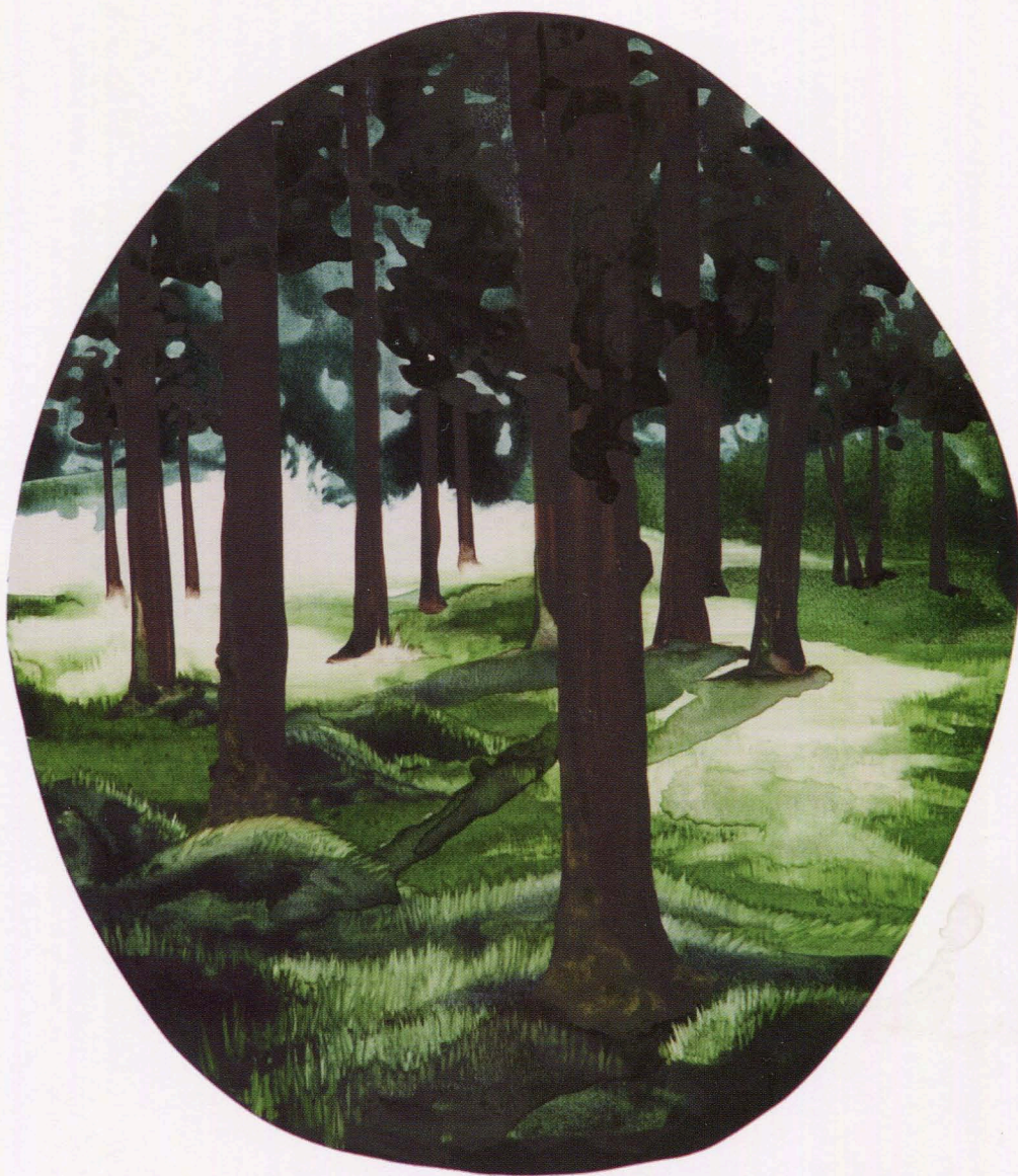
Dale Forest , watercolor on paper, 45" x 45", 2007