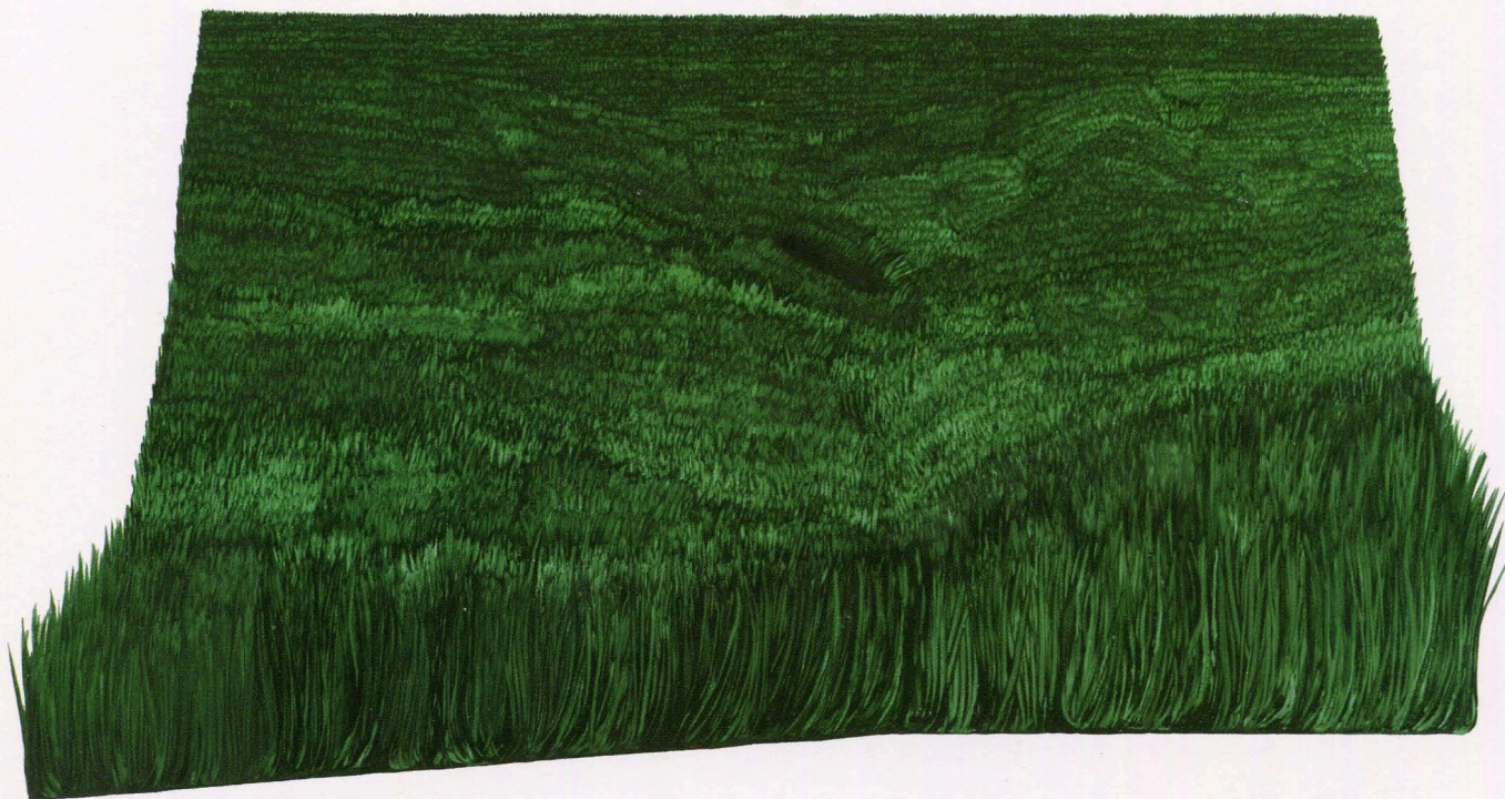
Field study (3) , watercolor on paper, 45" x 66", 2008