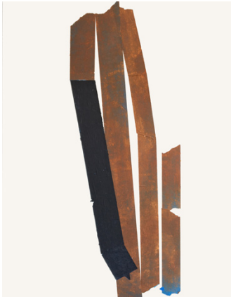
Christine Hiebert, Untitled (mm. 19.10) , 2019. Earth, black ink on blue tape, on paper. 23.5 x 18 inches

During the decades-long run of Margarete Roeder Gallery, Margarete exhibited works by established, mid-career, and emerging American and European artists in all media, with a particular emphasis on drawings and prints. Other areas of specialization include installations, minimal and conceptual works, and contemporary abstract German artists. The gallery also represented the Estates of John Cage and Merce Cunningham.