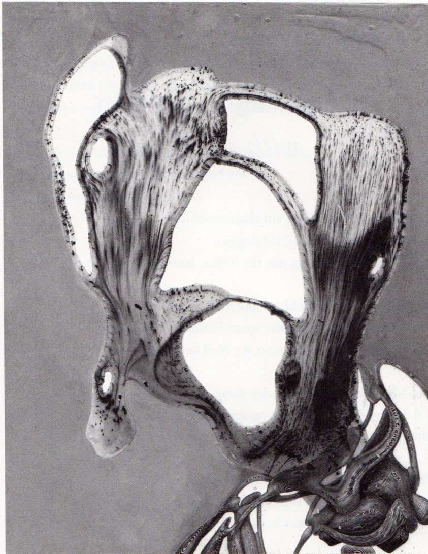
Jeffrey Bishop , Untitled-07 #16 , 2007, oil, ink, acrylic on paper, 11 x 8.5 in.