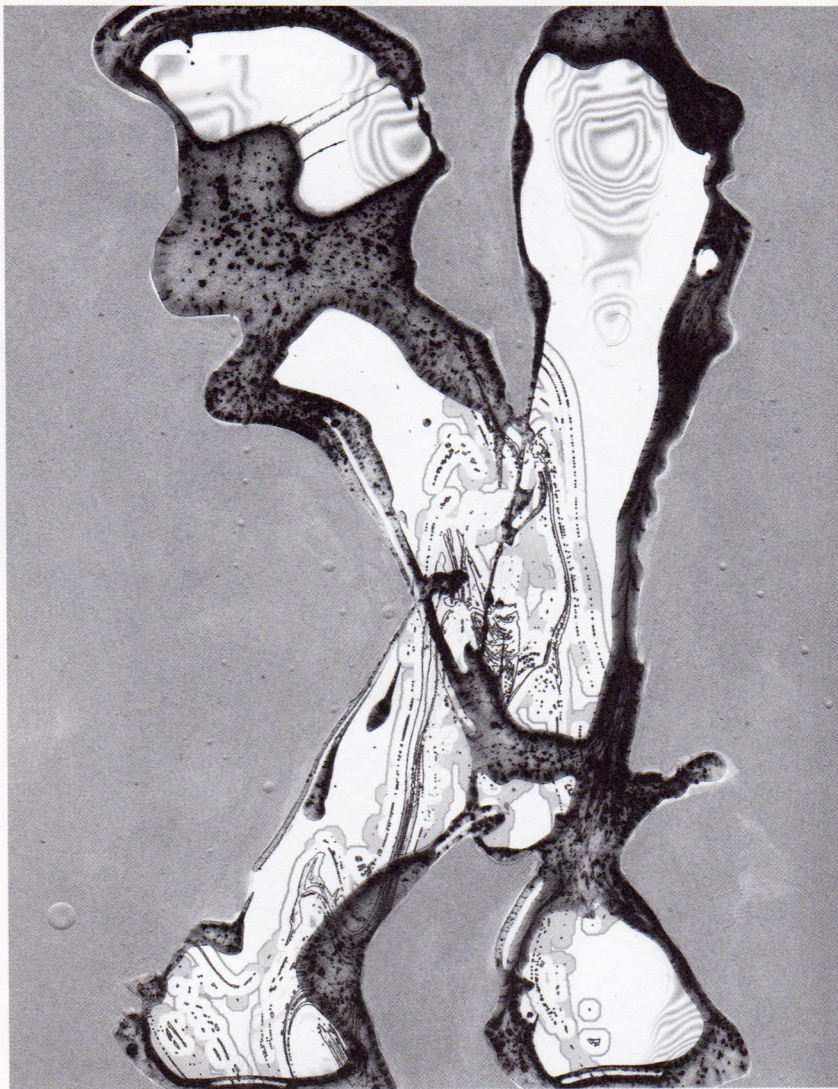
Jeffrey Bishop , Untitled-05 #15 , 2005, oil, ink, acrylic on paper, 11 x 8.5 in. Courtesy of the artist.