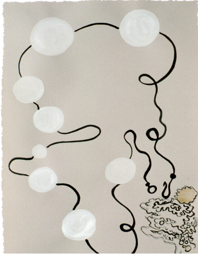
Fig. 2 Night Vision Series #34 , 1999, acrylic on paper, 8.5 x 5.75 inches

Over the course of her five-decade career, New York-based, California-born Japanese American artist Helen Oji has elaborated a remarkably diverse yet cohesive oeuvre across media—painting, sculpture, drawings, prints, installation and performance. Drawing inspiration from historical and popular Japanese arts and traditions—mythology, fairy tales, ukiyo-e prints, film, craft, fashion, zodiac—Oji injects contemporary formal and conceptual concerns with references to her heritage. Recurring forms and motifs allude to the common themes and concerns pervading Oji’s vibrant personal universe. Her artistic trajectory unwinds like a ball of yarn, a sort of Ariadne’s thread unraveling through space and time, and metaphor for the creative process.