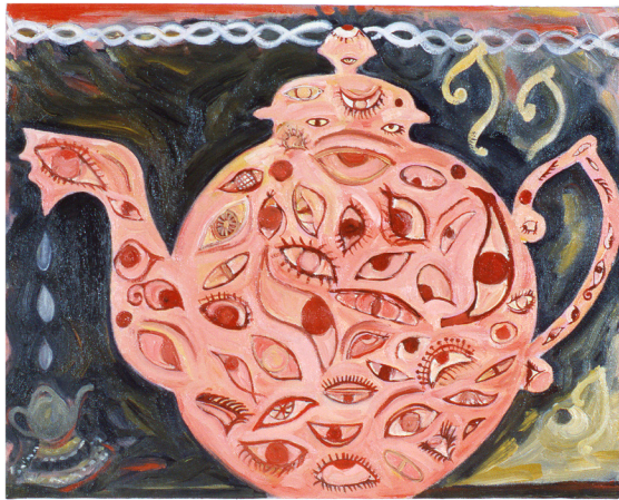
Fig. 6 Storyteller , 1994, oil on canvas, 16 x 29 inches, Private Collection

transition from these cataclysmic scenes of powerful natural forces to the whimsical still lifes of the “Everyday Objects” series. (fig. 6) The enigmatic symbolism and electric palette of floating martinis, teapots and cups, umbrellas, jewelry, timepieces and eyes in fanciful arrangements lead inward to the “Night Vision” series, in which cosmic imagery issues from the mind’s eye (fig. 2). Curvy lines and circular forms in primary hues set against solid, often neutral, grounds conjure macrocosmic and microcosmic realms invisible to the human eye. The elemental forms reminiscent of the basic building blocks of life animate the volumes of papier-mâché or pipe cleaner sculptures and infuse subsequent paintings and works on paper with a meditative Zen-like quality. (fig. 7) Like visual haiku rendered with a pop aesthetic, Oji’s current body of work, “Animal Friends” and “Playful Abstractions,” celebrates the life-affirming creative impulse and its capacity to transform our world through humor and the joyful, lively effects of color and line.