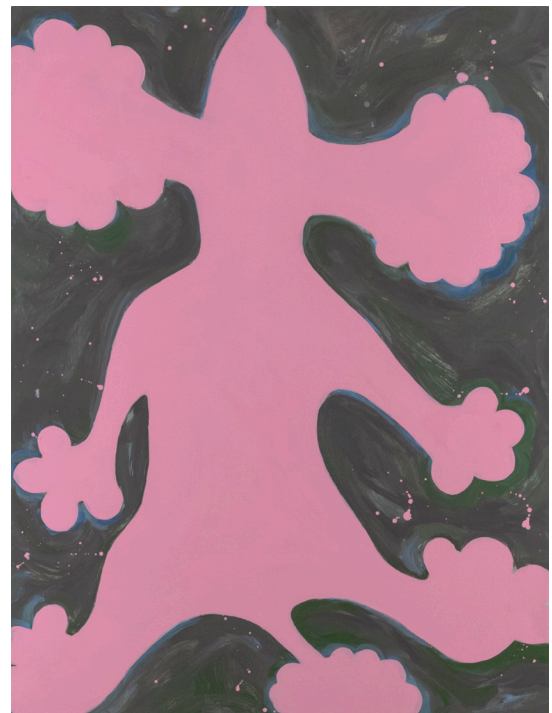
Fig. 7 Poodle Joy , 2018, acrylic on canvas, 42 x 32 inches

Oji manifests her embrace of expressive freedom and shifting concerns in the