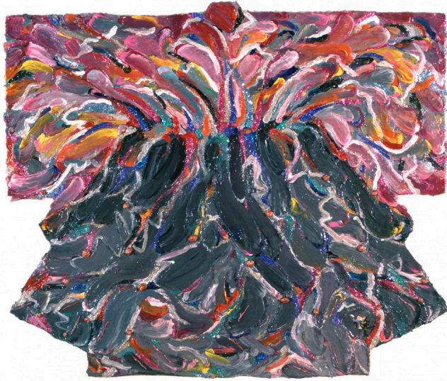
Fig. 4 Mt. St. Helens , 1980, acrylic, rhoplex, glitter on paper, 60 x 72 inches, Public Collection

and fabrics offer surfaces for both concealing and representing while mirrors and shadows augment this mise-en-abyme of painting. Hiding behind a checkered Bed Spread (1974), a bright-eyed young girl develops into a kimono-clad female in Woman with Fans (1974), which announces Oji's departure from figuration to the pared down abstraction of the Kimono series, exhibited in the 1980 "New Imagists" group show at the Alternative Museum (fig. 1). Upon arriving in New York Oji—inspired by the exploration of materials and process in Dorothea Rockburne's folded works—adapted the technique to create shaped paintings, collapsing a minimalist approach and the Japanese tropes of origami and kimonos to embody the equivocal, elusive qualities of representation and self.