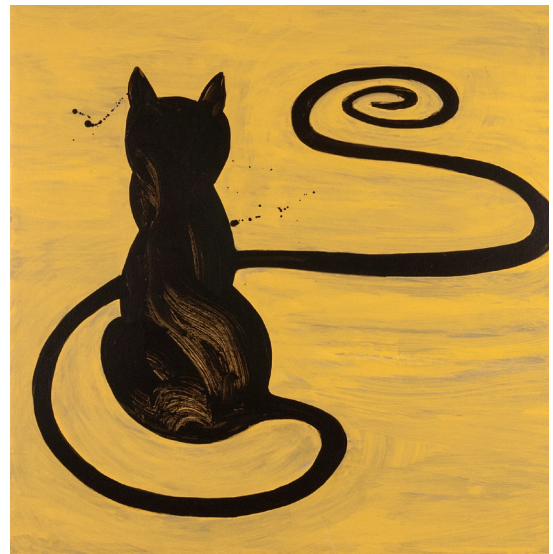
Fig. 3 Anticipation , 2018, acrylic on canvas, 30 x 30 inches

Blending European, American and Asian references in fantastical landscapes and intimate scenes associated with “Funk Figuration,” the self-referentiality of Oji’s meticulously-rendered formative works in watercolor or acrylic underlies her recent abstractions. A distillation of her early iconographic repertoire, spare graphic forms in bold colors are layered, often combining control with looser gestural handling of paint. (fig. 3) Elemental formal relationships, such as the sinuous lines of spirals or looping figures connecting to other shapes, or the silhouettes of “spirit” animals like the black cat, appear time and again in works from the 1970s— The Intruder (1974), The Taming of the Cat (1974), Moon Child (1973)—resurfacing in the past decade— Black Cat (2012), Anticipation (2018), or in other guises, Feline Effervescence (2019), Reach (2018), Paw Paw #3 (2015).