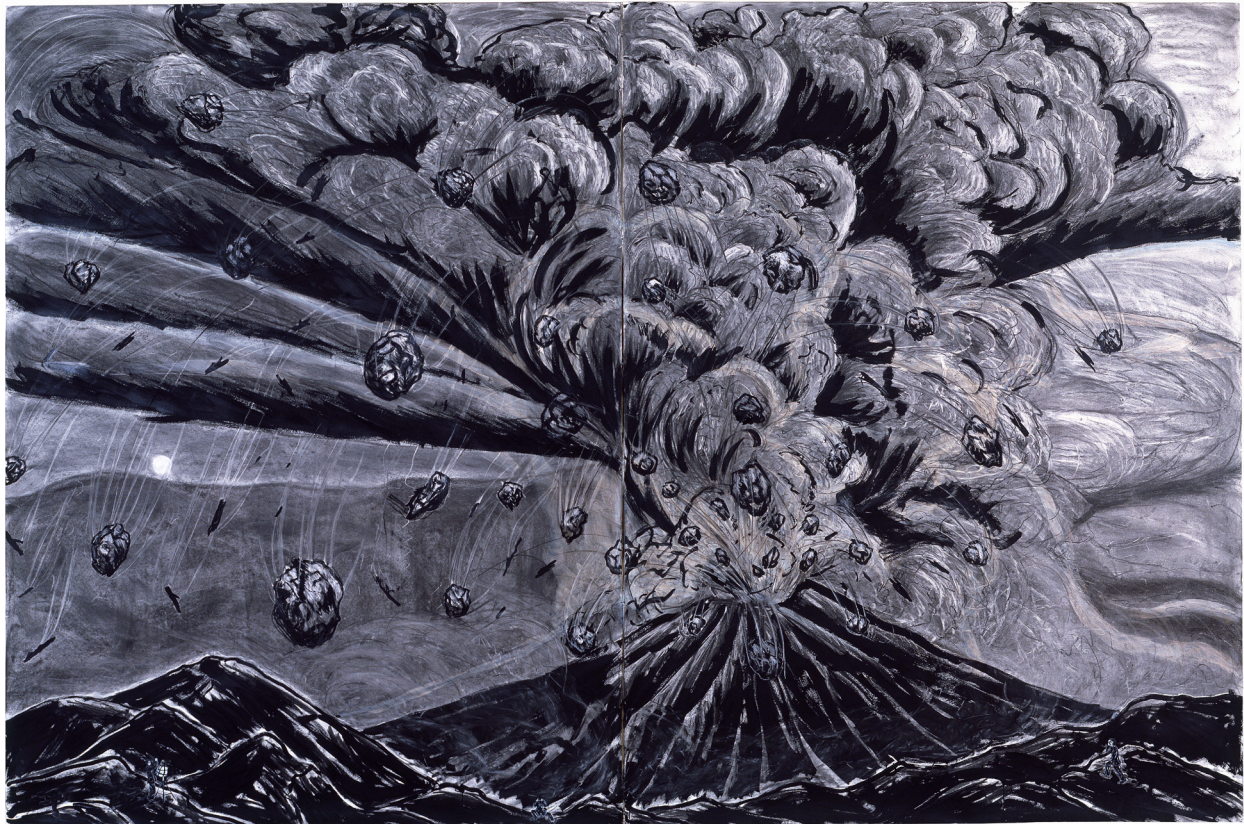
Fig. 5 Volcano Series #42, Clouds of Stone (diptych), 1983, charcoal, acrylic on paper, 96 x 144 inches

(fig. 4) One kimono painting, titled Mt. St. Helens (1980), whose glitter-encrusted impasto incorporates actual volcanic ash, recasts the fiery eruption of the volcano that year as an exuberant explosion of color and creation, prefiguring the darker