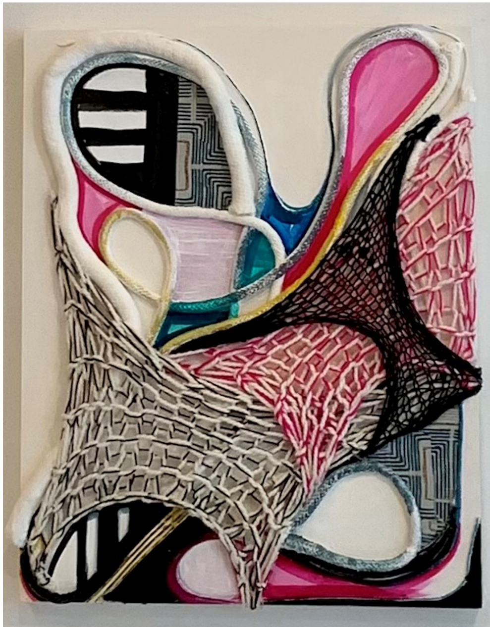
Unstoppable 30"x24" fabric, knitting, cord filler, paint

Mastrangelo uses upholstery cord to compose and draw her images. She then integrates paint, fabric and most importantly, her knitting, to connect and bond the forms. Her background, in painting early on and sculpture later, is integrated in these wall relief pieces, where the play between texture and design next to a painted color, a three-dimensional cord, or a piece of yarn come together into a harmonious whole.