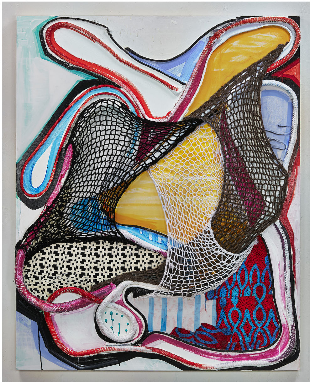
Shining Lights 60"x48", fabric, knitting, cord filler, paint

She does not have a preconceived design in mind, and when the image starts to become something recognizable, she changes it. The knitting plays a dominant role as it curves, catches, binds and dictates the rhythm of her compositions. In the larger works, as in Unbridled Passion , the artist says it is easier for her to focus on an inner rhythmical beat, and remain in sync with that beat until the drawing is complete.