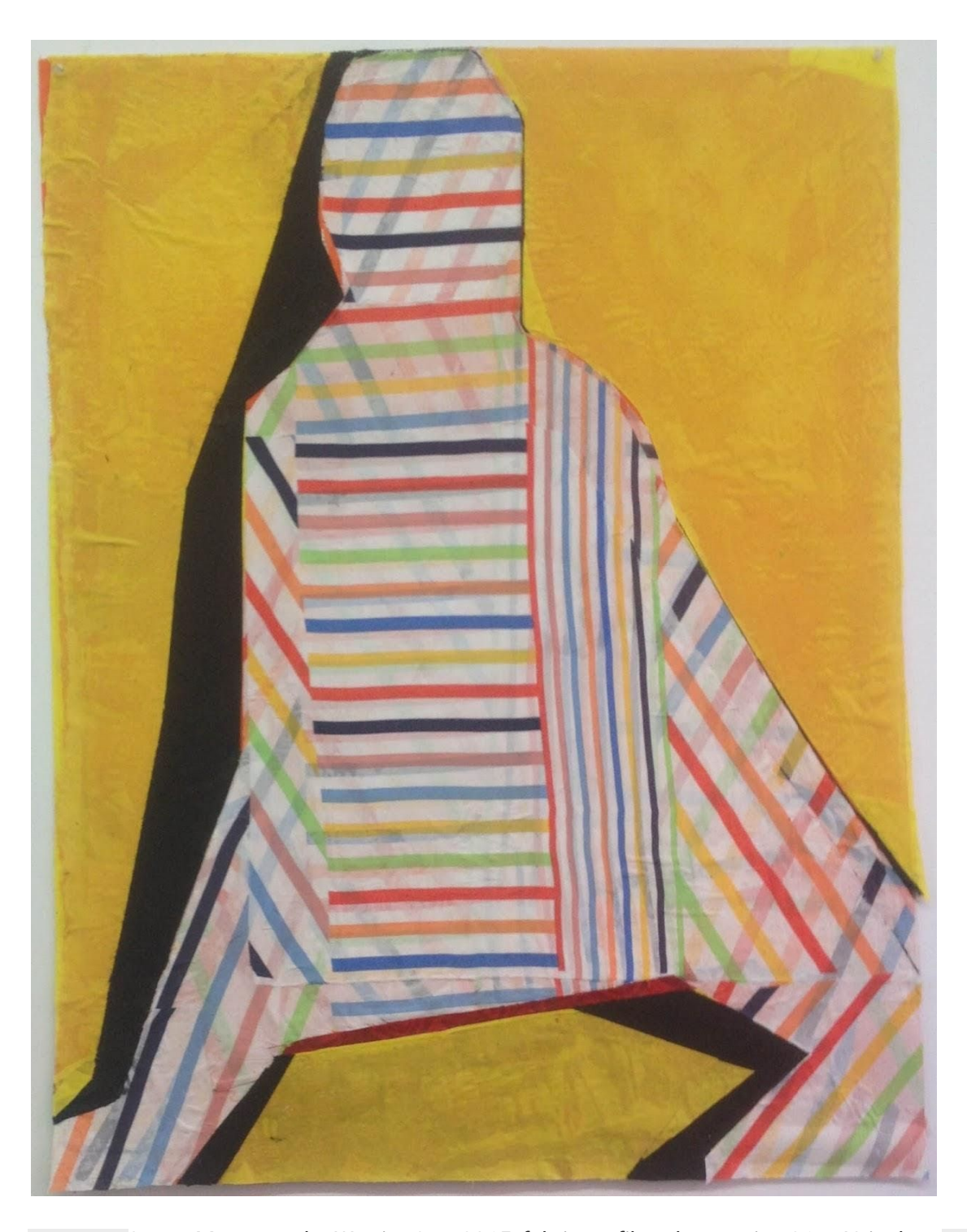
Susan Mastrangelo, Warrior One, 2015, fabric on fiberglass scrim, 31 x 40 inches.