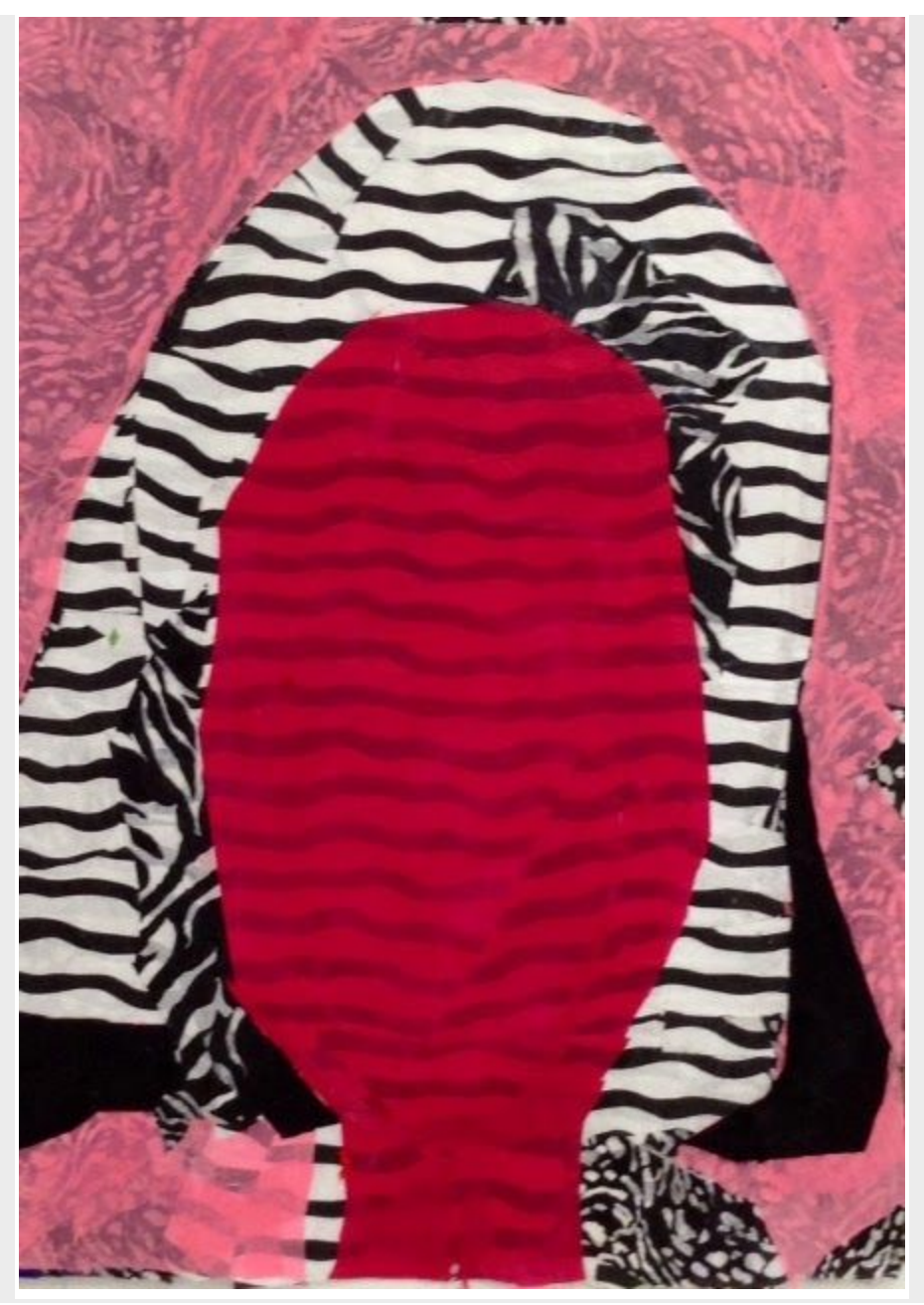
Susan Mastrangelo, Power, 2015, fabric on fiberglass scrim, 40 x 40 inches.

In November, a selection of Mastrangelo's new work will be on view at The Painting Center in "Ulterior Motif,"