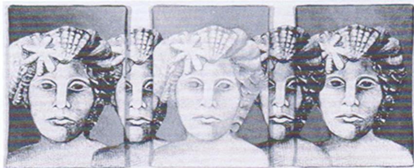
"Mediterranean Woman", acrylic and mixed media.