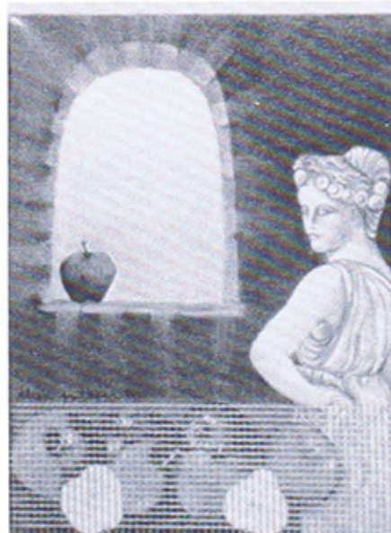
"Golden Times III", acrylic and mixed media.

Two upcoming one-person exhibitions of Elisa Pritzker's work are being presented in upstate New York. The artist's new series reflect the influence of Greek Mediterranean forms and styles as well as the traditions of the Hudson Valley.