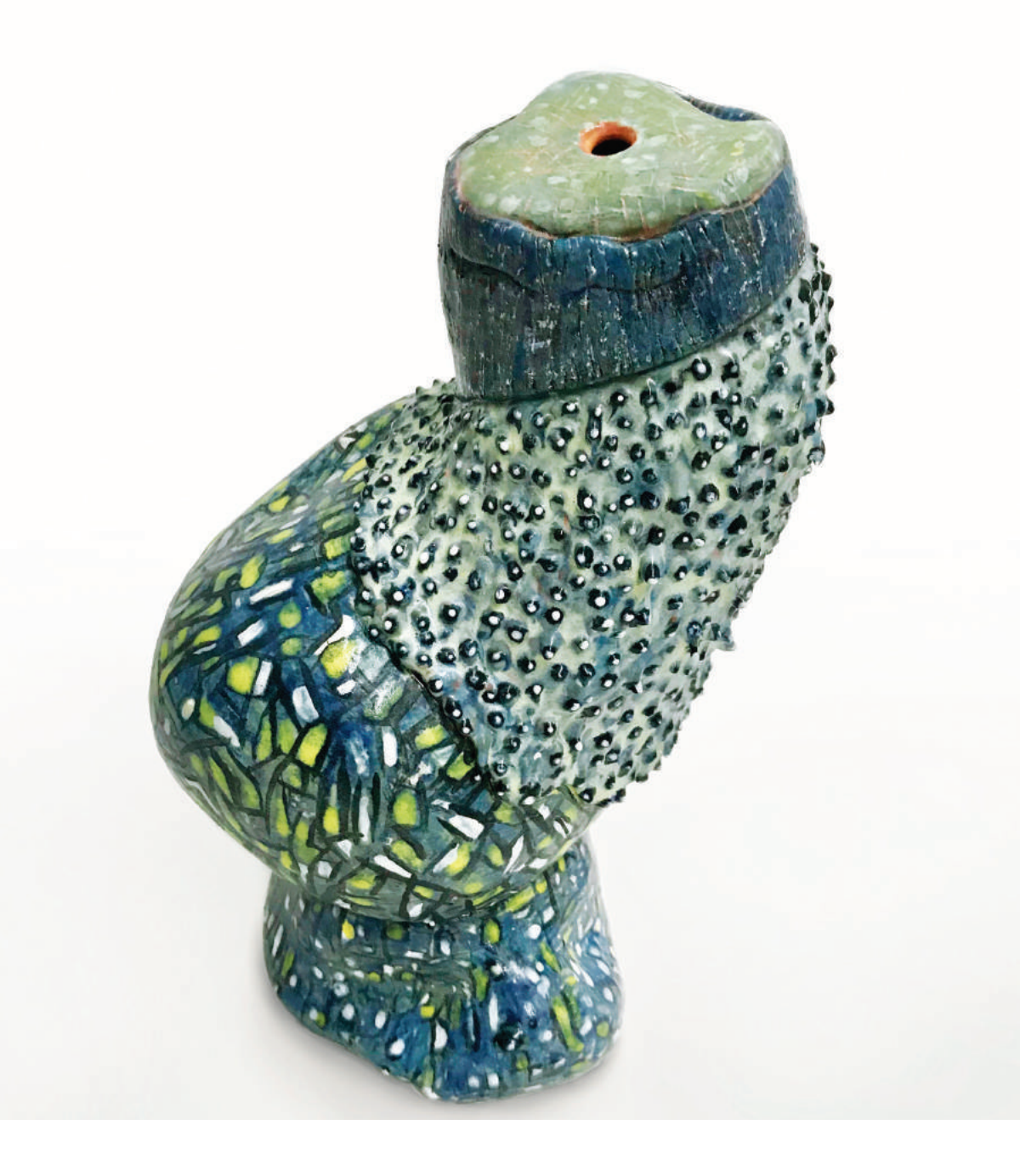
stancer 4, 2020, 9 3/4 x 5 x 5 inches, private collection