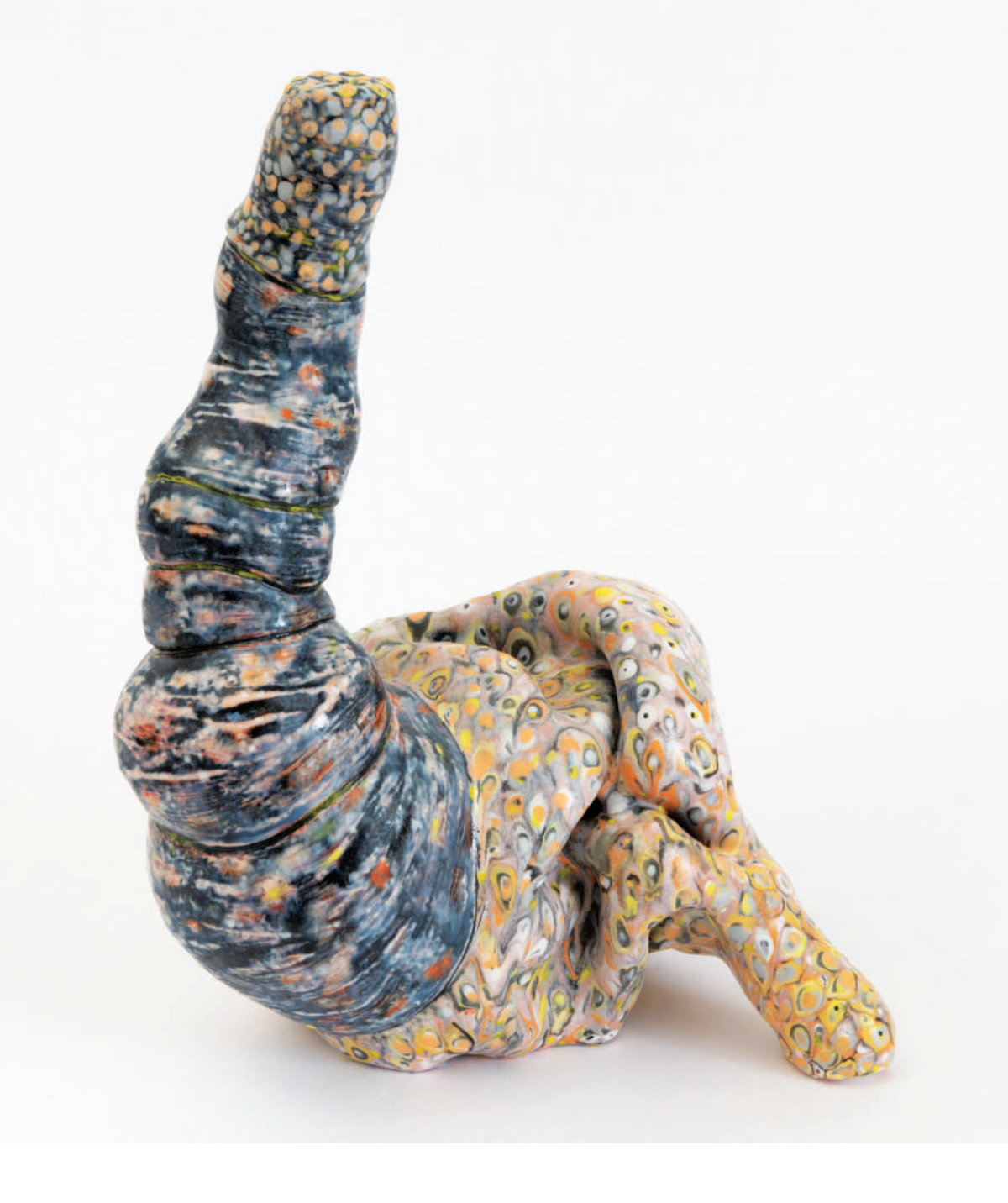
feeler, 2019, 9.5 x 6 x 8 inches