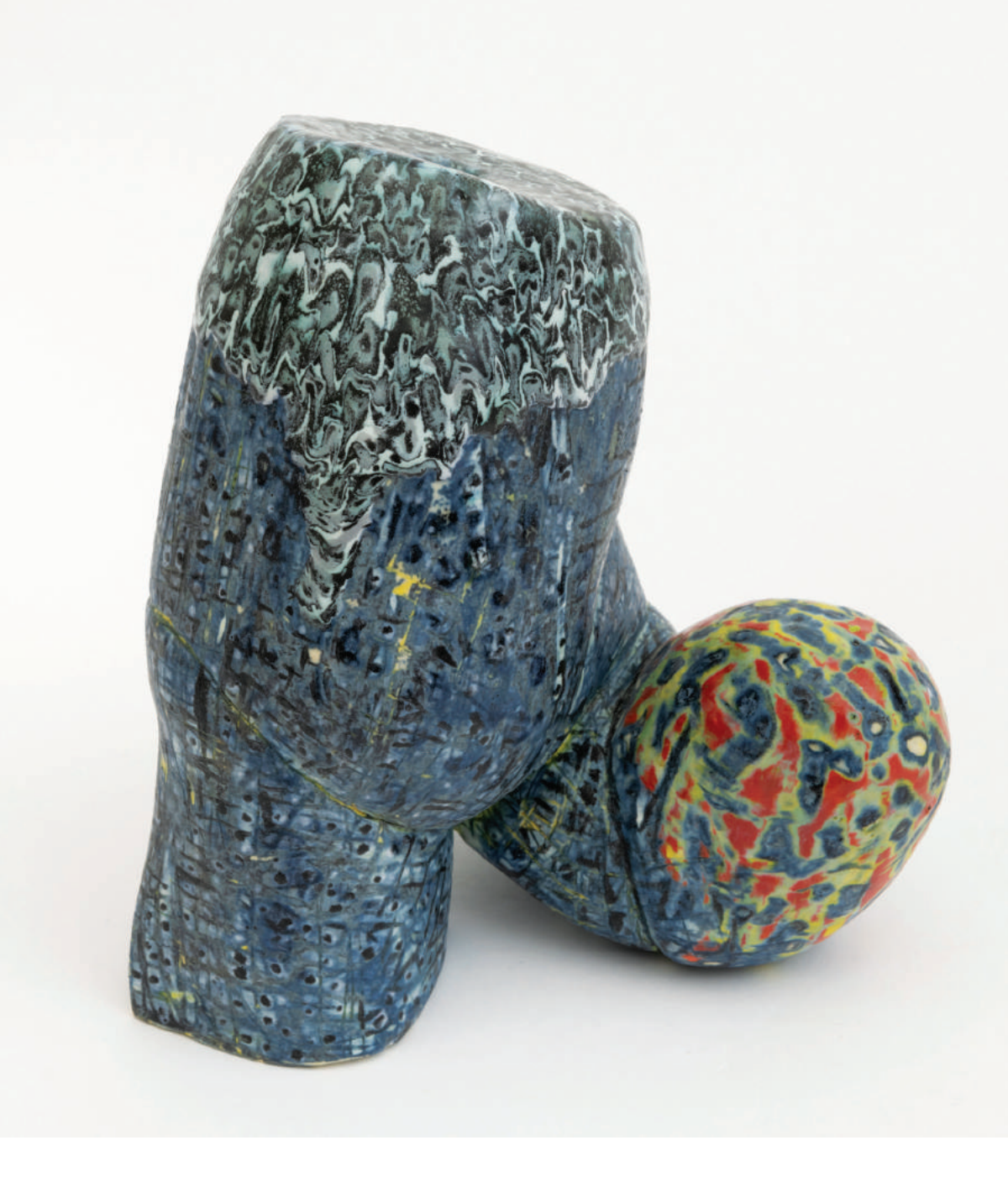
roundout, 2020, 6.5 x 5 x 5 inches opposite page: blue blau, 2020, 8 x 8 x 6.5 inches