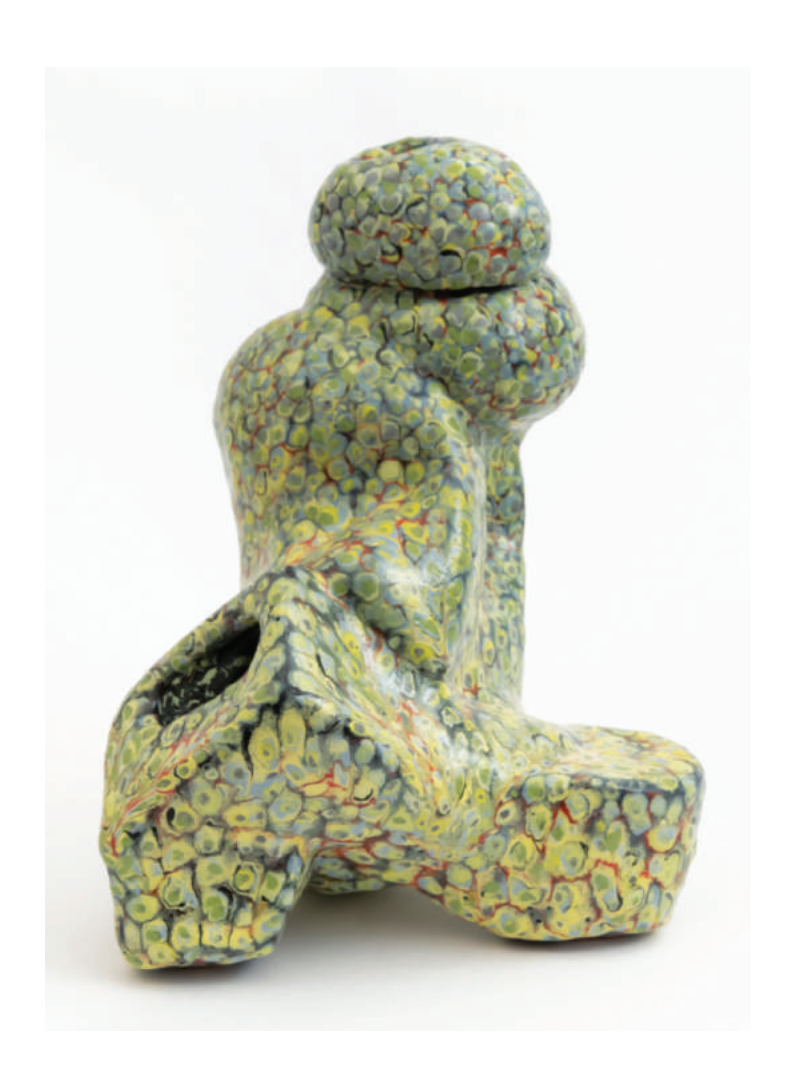
stancer 5, 2020, 8 x 7 x 6.5 inches