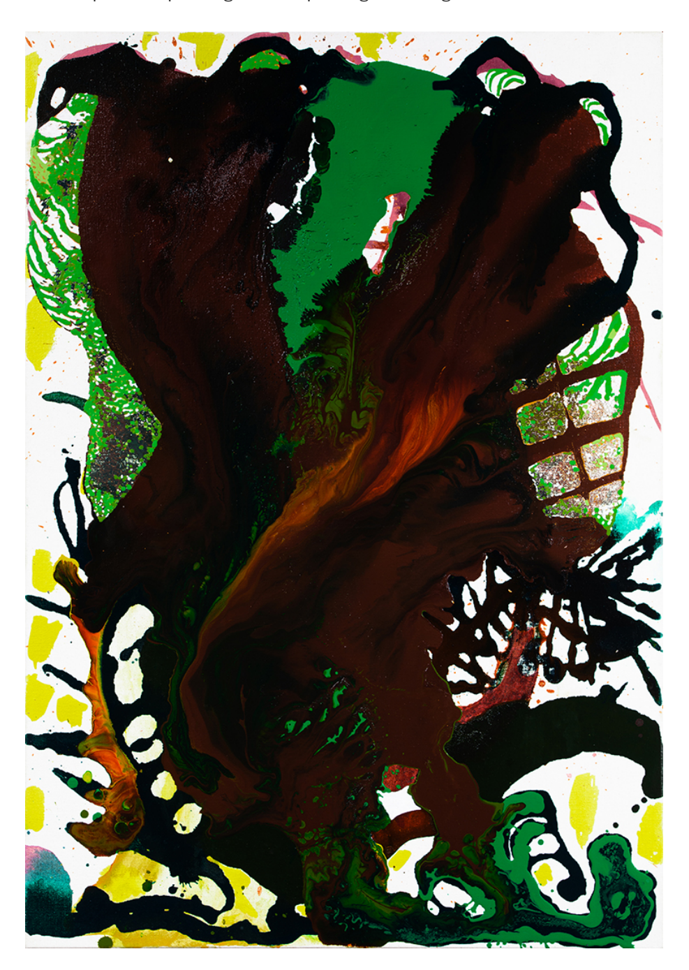
Everything is Fine, 2020, acrylic and ink on linen, 30 x 21 inches.

strength and succor. As Elizabeth Murray once said of Cezanne, "someone is at home in there." The sense of life lived and companionship through landscape is a goal and a gift.