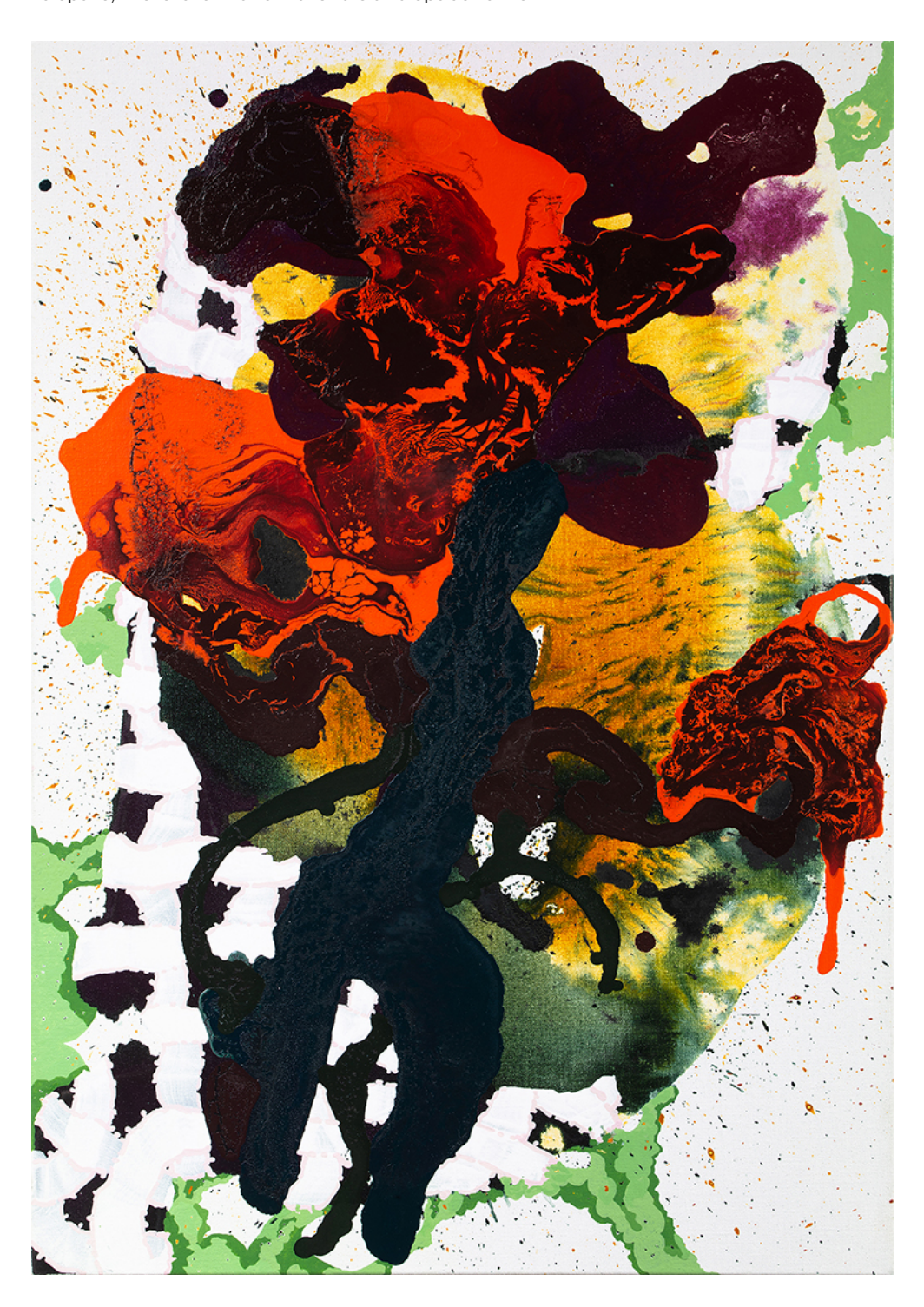
Checkers, 2020, acrylic and calligraphy ink on linen, 30 x 21 inches.

I also began painting on discarded wood scraps and linen. I want to bring scrappiness to the elegance of the linen. The flowers I've been painting in New York the past five years have shifted from more literal translations of vintage textile patterns to curdled pours of color bound by lattice patterns. I'm really excited about these poured flowers, and ordered ten canvases that I picked up in the nick of time. My husband is an artist and paint maker, so he has pigments and binder to spare, therefore I have materials and space to work.