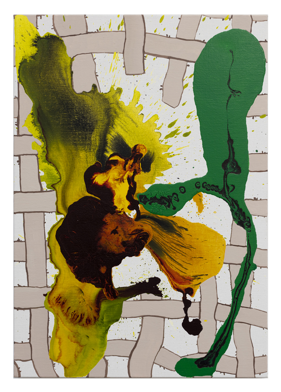
The Unexpected Orchid, 2019, acrylic and ink on linen, 30 x 21 inches.