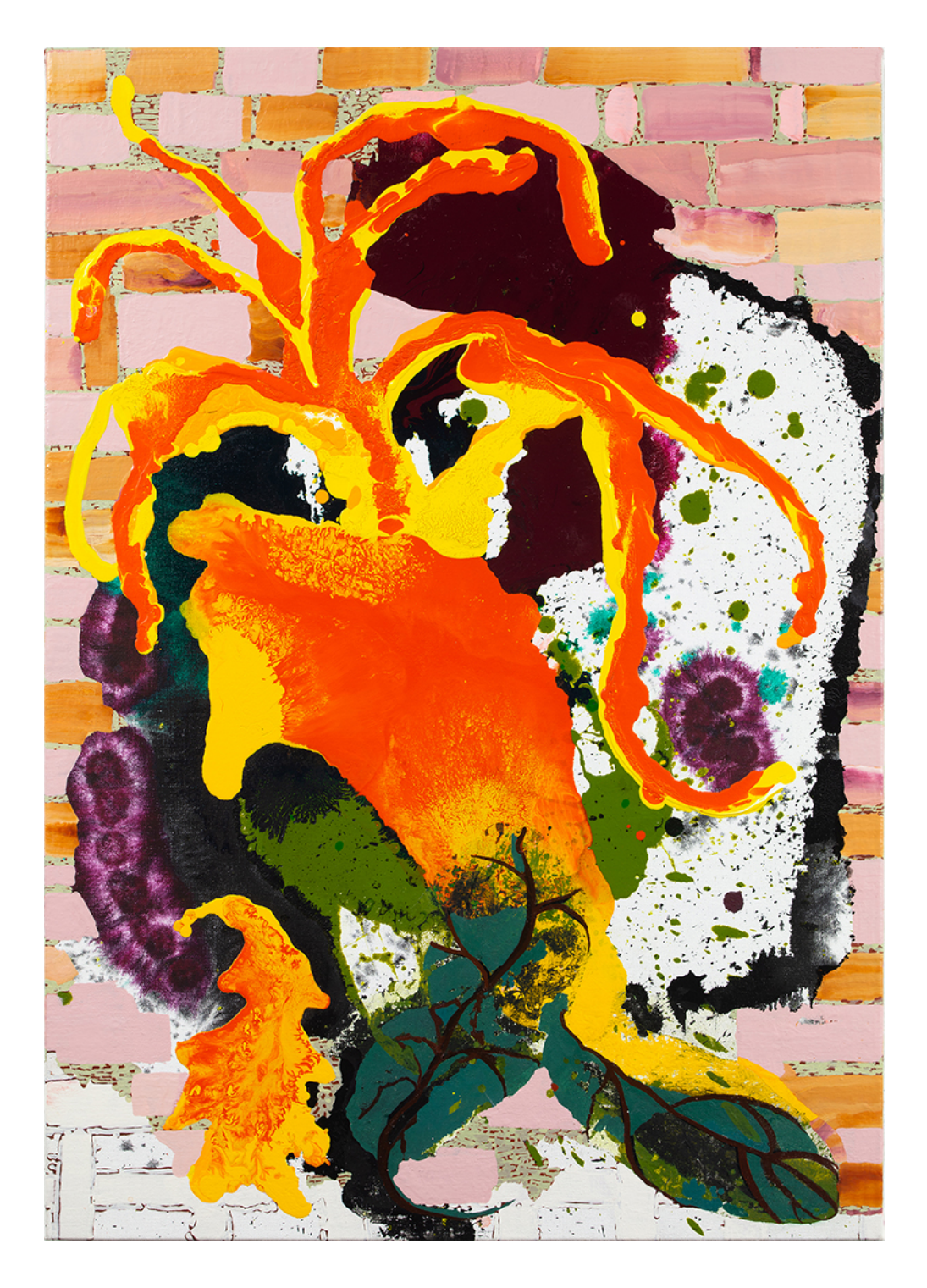
Brick Wall, 2020, acrylic and calligraphy ink on linen, 30 \times 21 inches.