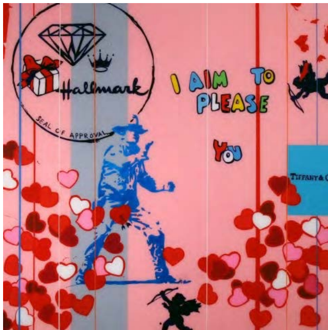
Craig Hill, I Aim to Please , 2008, acrylic and resin on canvas, 24 x 24 in.