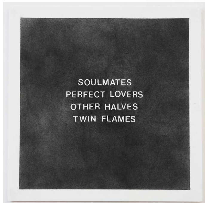
Julie Wills, Twin Flames , 2023, graphite on paper, 8 x 8 in.