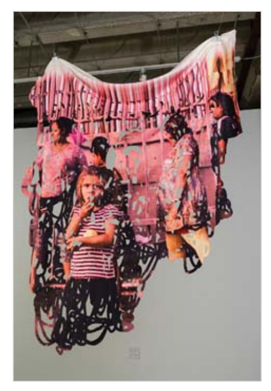
Untitled (caravana1), 2019.

Ruff was born in Chicago, moving to Miami Beach when she was eight years old. She's indelibly marked by those years in Chicago, where her grandparents owned a scrap-paper business. "When I was very small, I used to go to the warehouse and see these gigantic bales of