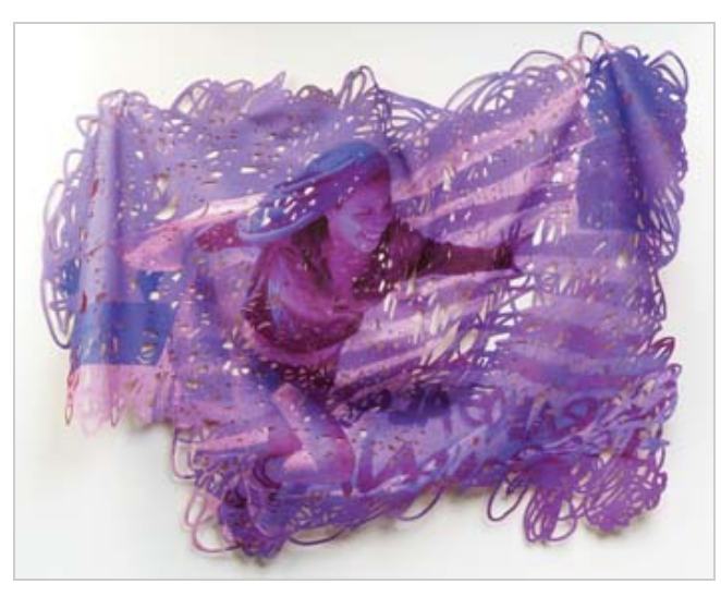
La Prensa 5 (purple), 2019. Photo by Alain Fleitas

Since 1997, more than 60 venues have exhibited her art in cities that include New York, London, Madrid, Miami,