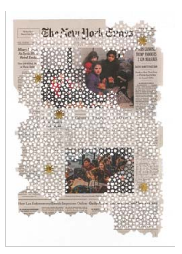
2.21.18, 2018.

One series, "La Prensa," adapts and enlarges newspaper photographs published in Mexico and Central America, showing migrant children and parents on their long journey to the United States. The photos have been transferred to large pieces of hanging fabric. Cuts and slices in the fabric intensify the