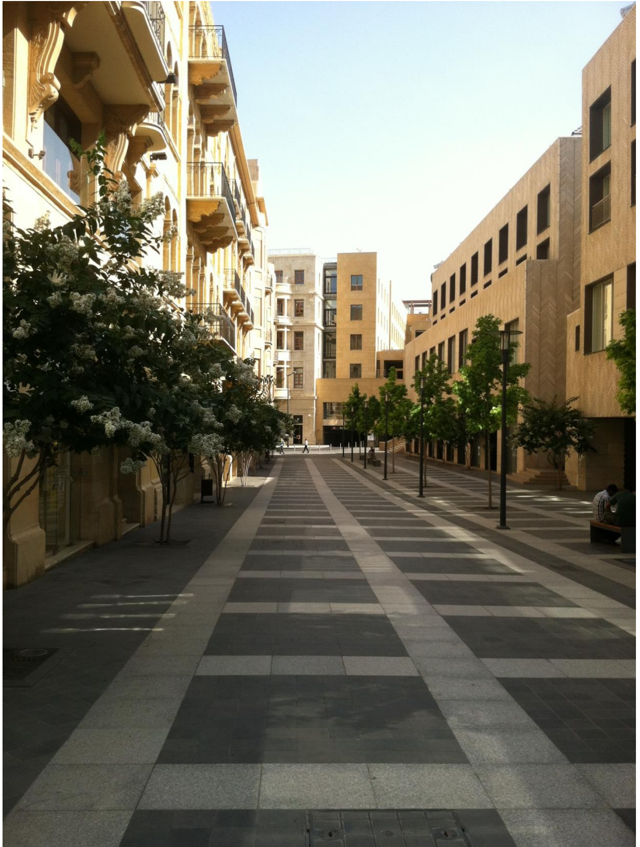
Figure 2: Solidere. Photograph by author, 2013.