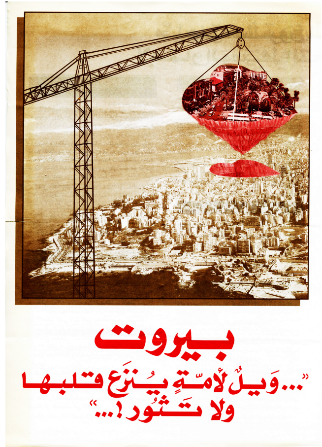
Image 1: A poster by the Association of Owners Rights in the Beirut Central District that reads "Woe to a nation that rips out its heart and does not revolt!" Circa 1993. Source: Archives of The Arab Center for Architecture (ACA). Copyright: The Association of Owners Rights in the Beirut Central District. Used with permission.

forced into a company." 8 Many of property right holders supported the creation of Solidere, as property rights over the years had become fragmented into thousands of different claims. But many other property owners did not agree with the formation of Solidere and were often violently dispossessed of their claims.