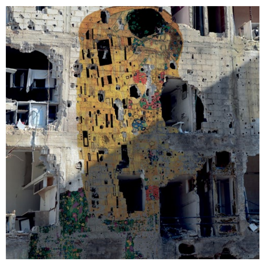
Tammam Azzam, Gustav Klimt's The Kiss (Freedom Graffiti), 2013 Digital Print and Mixed Media, 140 x 140 cm, Courtesy of the artist © Tammam Azzam

show us that attempts to violently impose certain urban arrangements can never be fixed and always leave open the possibility of rearrangement.