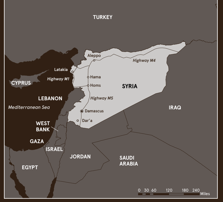
ArcGIS World Countries Layer Package (http://www.arcgis.com/home/webmap/viewer.html?useExisting=1).

Images of decimated urban corridors from across Syria have circulated widely in news media since the outbreak of armed conflict in early 2011. Such images are often mobilized as evidence of conflict's futility and inherent evil. The urban ruination on display – from cities such as Aleppo, Hama, Homs, and the surroundings of Damascus – is on a scale not witnessed since the vast urban destruction of World War Two. These images highlight the fact that the destruction of the built environment has extended well beyond military targets or "collateral" damage to include, for example, entire residential neighborhoods.