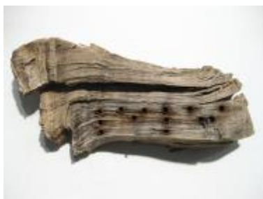
Cui Fei, Leaves , 2014, Mixed media 8 1/2 x 4 1/4 x 1 1/2 inches (21.6 x 10.8 x 3.8 cm).