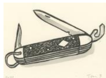
Thomas Slaughter, Boy Scout Jack Knife , 2014, Ink on paper 9 x 12 inches (22.86 x 30.48 cm). Courtesy of the artist.