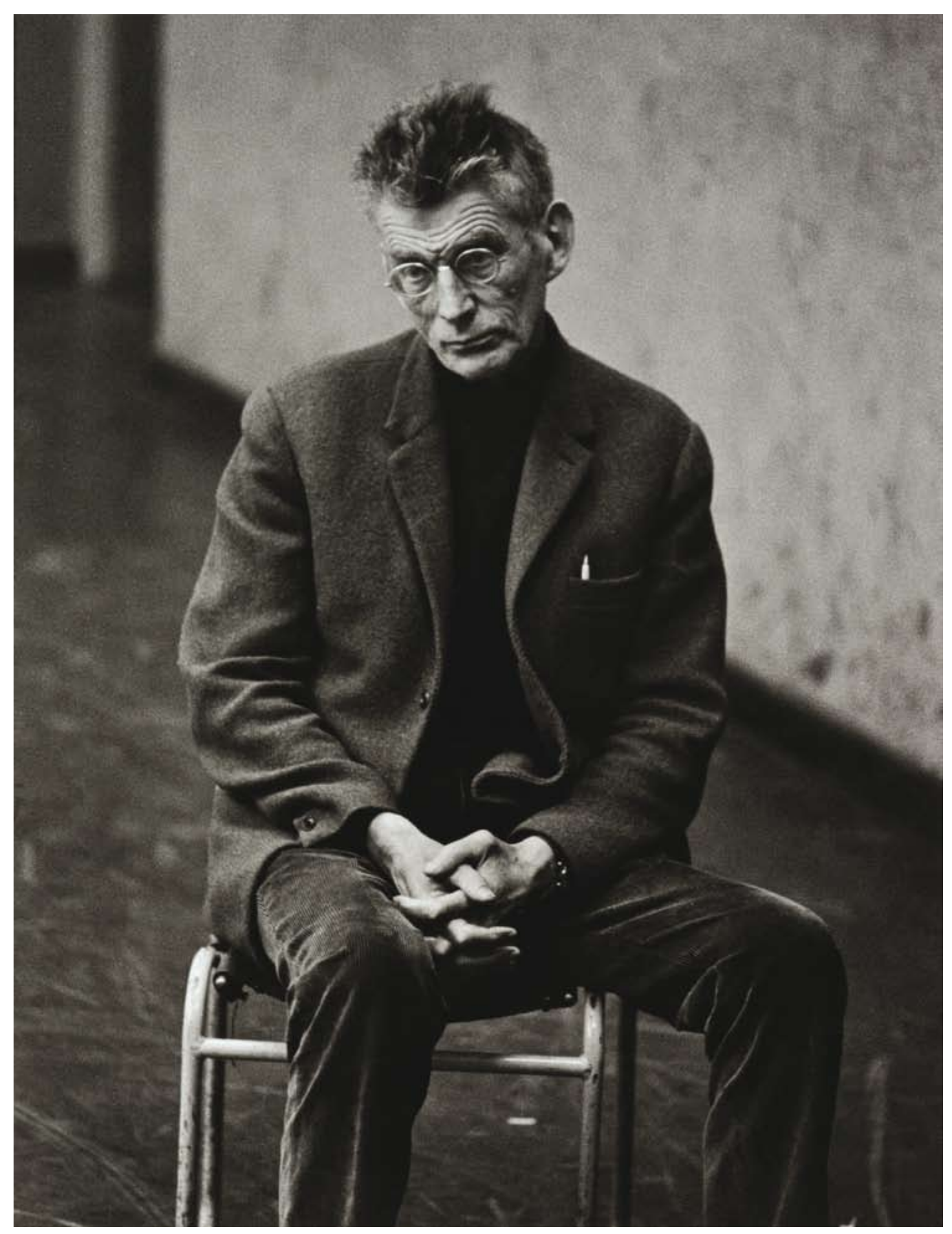
◆ Samuel Beckett 1965