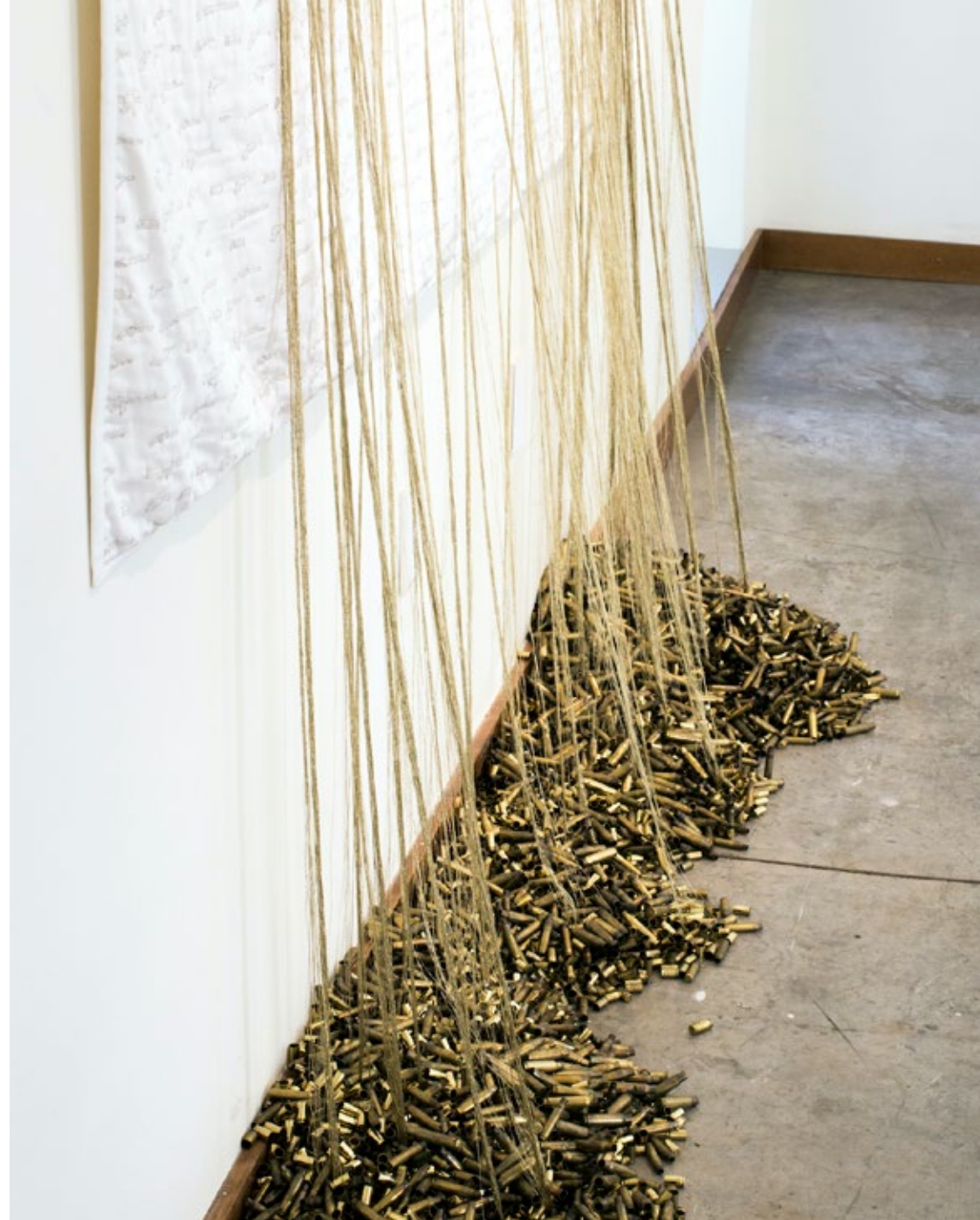
TextileArtist.org Stitch Club