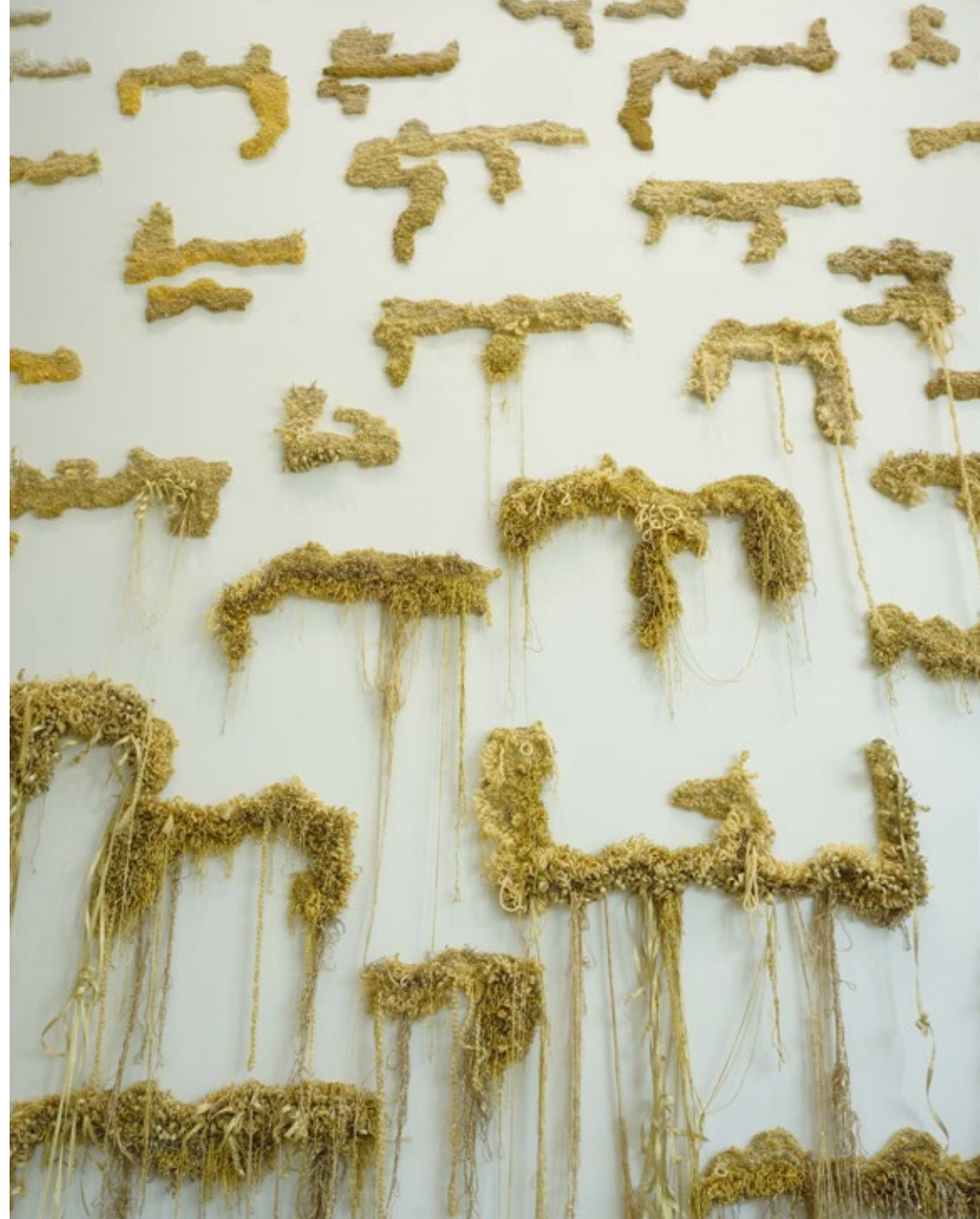
TextileArtist.org Stitch Club