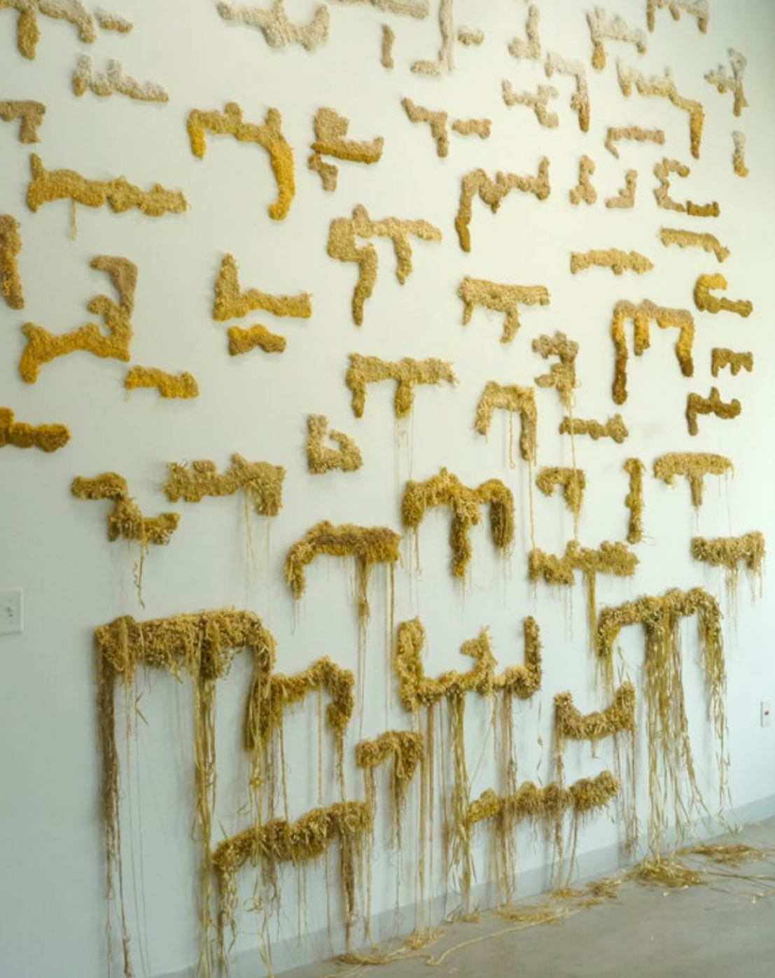
Mending Moss, 2019