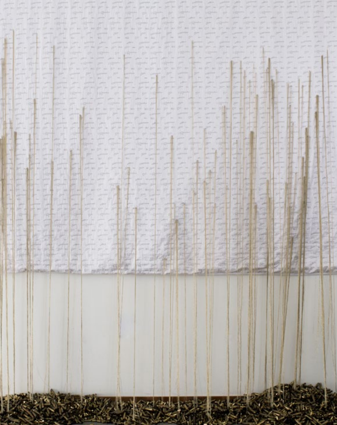
Mending Gold: When Will It Be Enough, 2017 - present