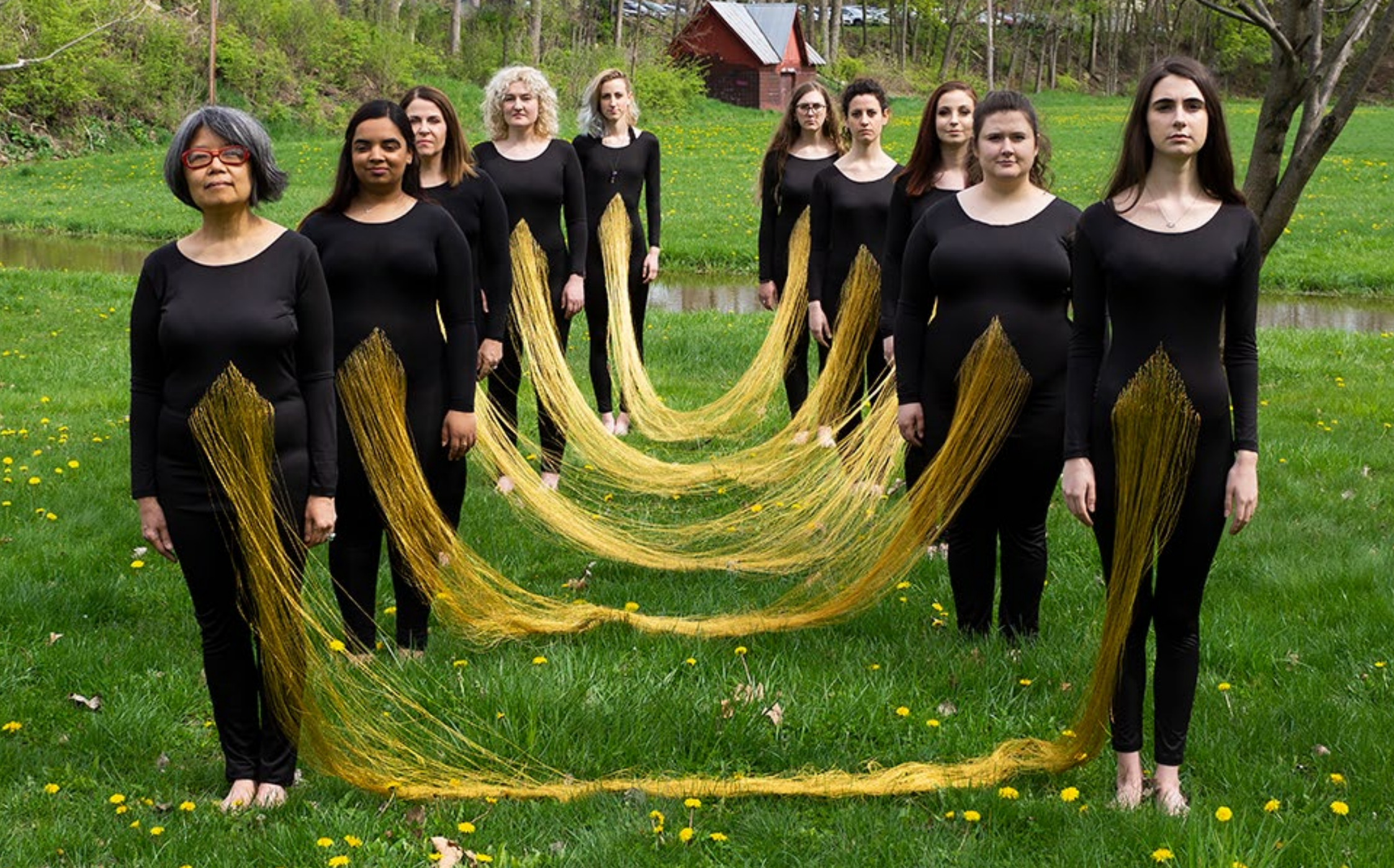
Mending Gold: Connective Space (detail), 2019