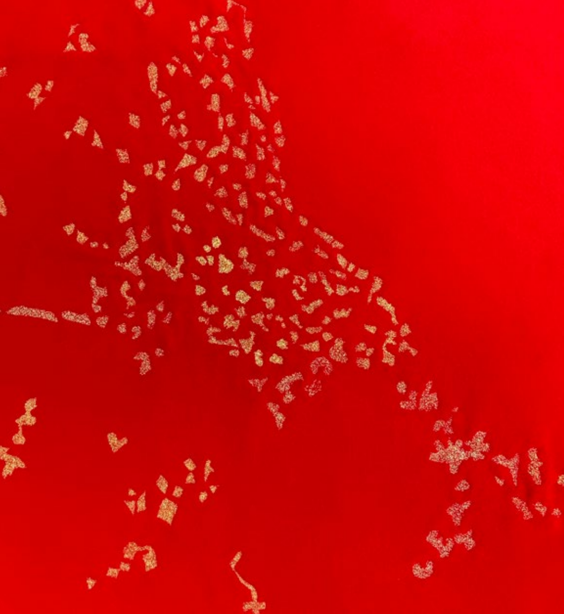
Distant Dialog, 2020, seed stitching on wool