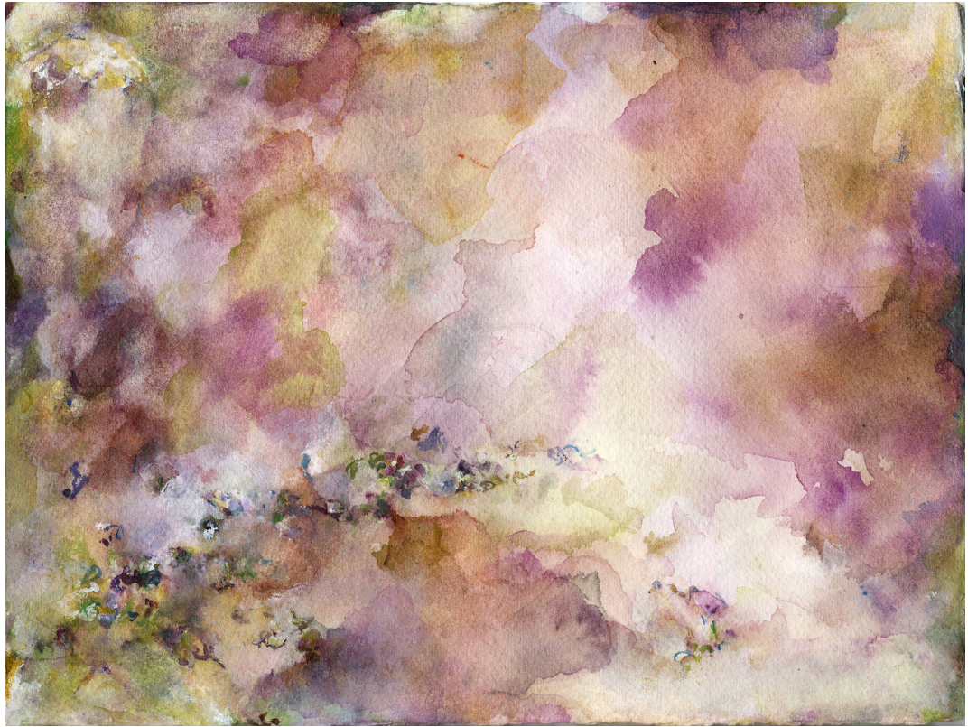
Somewhere watercolor on archival paper 7 in x 11 in