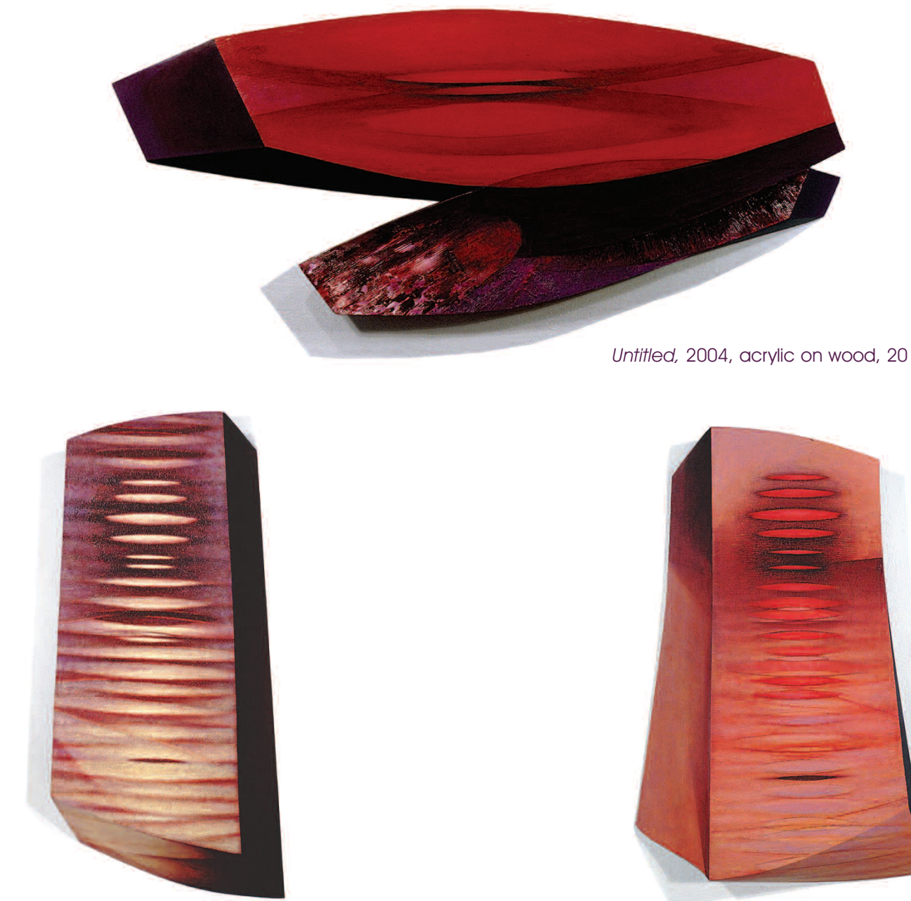
Untitled , 2004, acrylic on wood, 20 x 47 x 2