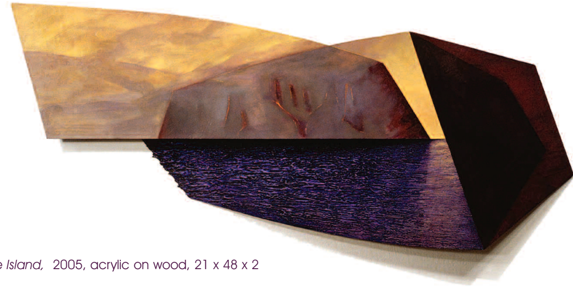
Shadow of the Island, 2005, acrylic on wood, 21 x 48 x 2