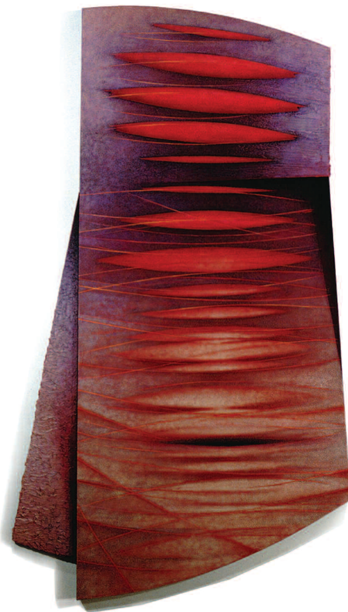
Reflections , 2001, acrylic on linen, 92 x 53