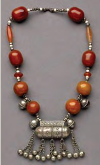
Koranic Amulet (xirsi) , from Africa, 18th Century made of silver, agate, amber, and ivory