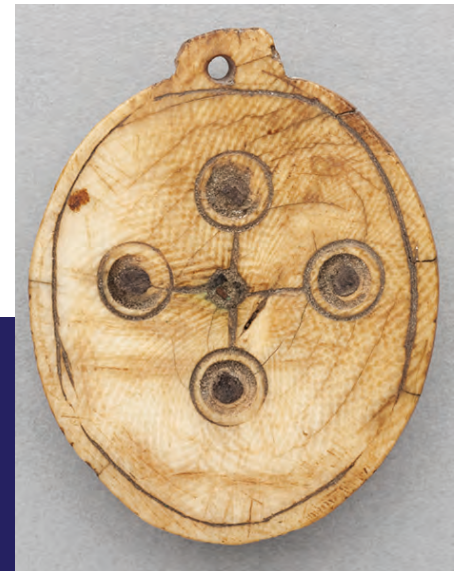
Ivory pendant , Mboma peoples, 19th century Royal Museum For Central Africa

Personal adornments are things we wear like hats, rings, or other objects to decorate our body. Sometimes these adornments are used to make a person more attractive. Other times, these adornments are used to identify who a person is or to show that a person is special in some way. Adornments can tell you how important a person is, what kind of job they do, where they live, or how they want to be known. Personal adornments will often have bright colors and patterns, use special materials, or are very valuable.