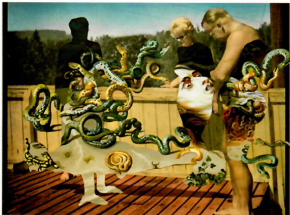
American Nudism, after Rubens, 2009 Oil with Collage on Linen, 28.12 x 42.12 in.

N U D I S M a statement designed to question the morality of those who frequented nudist camps, summer vacation enclaves were very popular in the United States during the 1950s and 1960s. Joseph, however, has permeated this image with a scene of writhing snakes emerging from the head of Medusa (derived from a painting by Peter Paul Rubens, ca. 1615), as well as rattlers, lizards and scorpions from the Colorado countryside (near where she resides). For the artist, the results represent a critique on the corruption of American society, not only as it exists in the art world, but even within the confines of an entrenched capitalist system, which, due to the current financial crisis, has crippled our ability to be free—to fulfill our dreams and live the lives we desire.