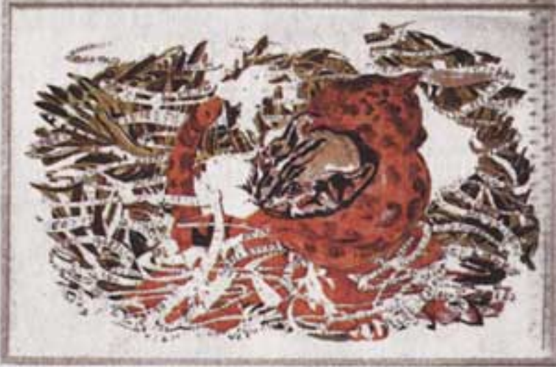
I WILL BE FERVENT, I'LL BE OBSERVANT