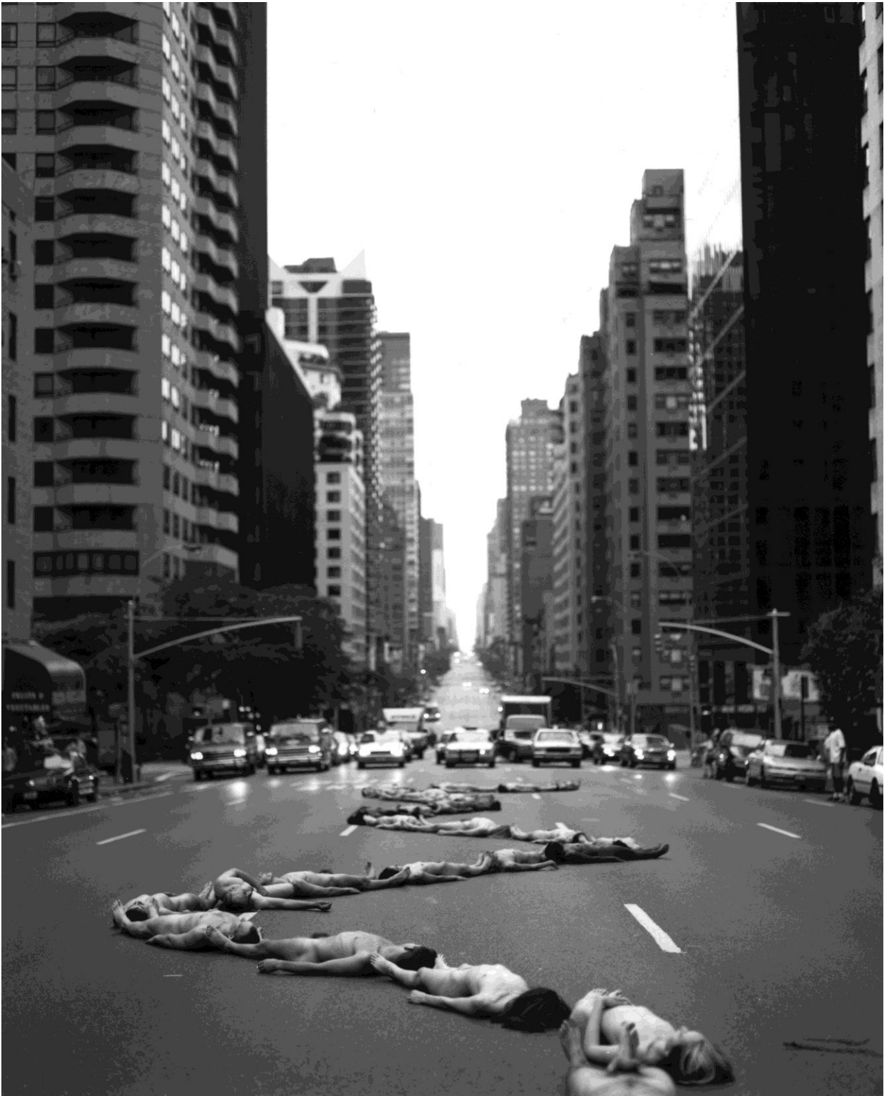
Fig. 1: Spencer Tunick, Wavy Line (42nd Street and 2nd Avenue NYC) 1994. Courtesy of the artist

Tunick's relationship with the city in his works is complex, because even though he has photographed all over New York City, from Wall Street to Brooklyn, often the background is blurred, as in his 1994 work Wavy Line (Figure 1): "I liked the grittiness of the city, but I mostly liked the idea of the grittiness – the people in the