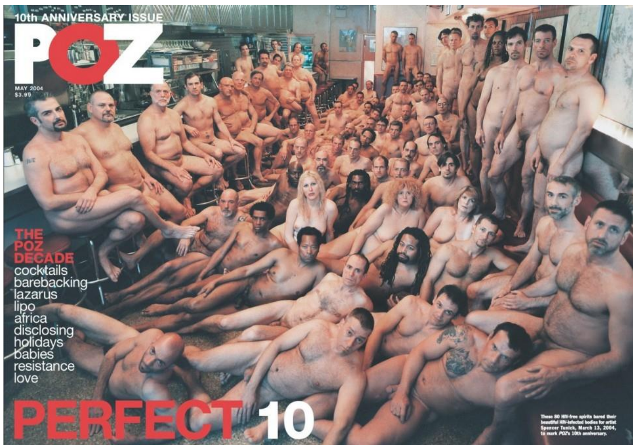
Fig. 7: Spencer Tunick, Cover POZ Magazine New York 1 (HIV Positive) 2004.

quite often with our bodies changing due to meds – premature aging, lipo, wasting. And to be with my peers knowing they too have had to deal with these issues was comforting. We don't often have the place to let it all hang out. It was kind of tribal" ("Witness"), one person said. Even if the shoot took place indoors, the magazine describes it as a thrilling, dangerous and public event: "[we were about to] create our most important cover ever. It was classic POZ : provocative, communal, possibly illegal, potentially moving and meaningful [...] On the bitter-cold Saturday of the shoot, a line of men and women stood outside Restaurant Florent at dawn, waiting to take off their clothes and stand naked and positive for all the world to see." With a circulation of over 100,000 issues, Tunick may have taken his POZ photo indoors, but the cover was all out. Although the magazine received few complaints, they did allegedly get a very high profile one from Doctor Tom Coburn, who was co-chair of the president's advisory committee on HIV/AIDS – he was so offended by the cover that he had his subscription cancelled (Strub; Press Pass).