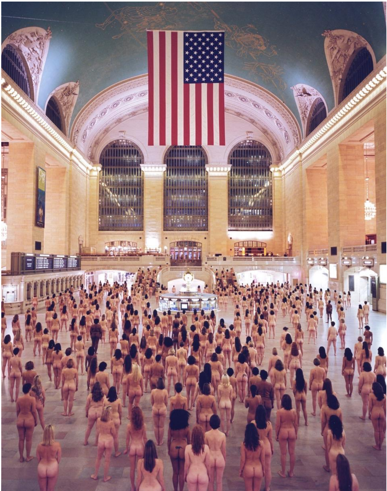
Fig. 8: Spencer Tunick, Grand Central 2 2003. Courtesy of the artist

York surroundings was fleeting yet permanent – his photographs and court victory are what remains from these hurriedly staged moments.