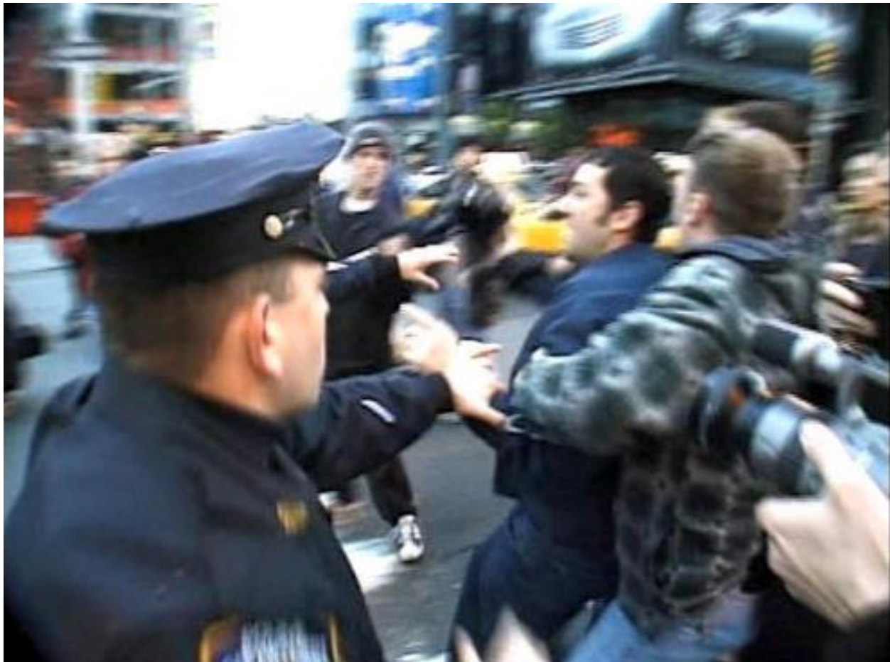
Fig. 6: A still from the film of the Times Square photoshoot shows Spencer Tunick's arrest.

calling for the withdrawal of funds for supposedly “obscene” artists such as Robert Mapplethorpe (see e.g. McLeod and MacKenzie).