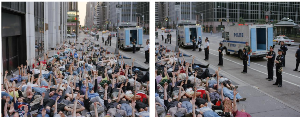
Fig. 5: Spencer Tunick, Sex Drive (41st Street and 6th Avenue, NYC) 1999. Courtesy of the artist

police vans and officers with folded arms (El-Mecky 2017). “I was very nervous – you can tell from the diptych’s right frame – it’s a little bit out of focus.”