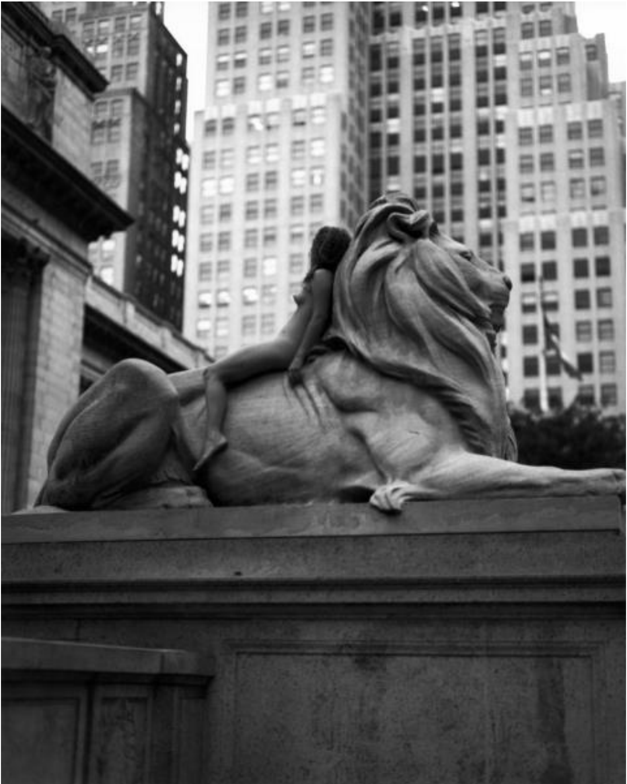
Fig. 3: Untitled #11 (Public Library, NYC) 1990-1996.

playful or joyous relationship with their surroundings, such as in Untitled #8 , where a woman is swinging from the ceiling in the subway as though she were a kid in a jungle gym, or Untitled #11 where another woman reclines on one of the gigantic stone lions in front of the New York Public Library as though it were a reclining chair in a spa (Figure 3).