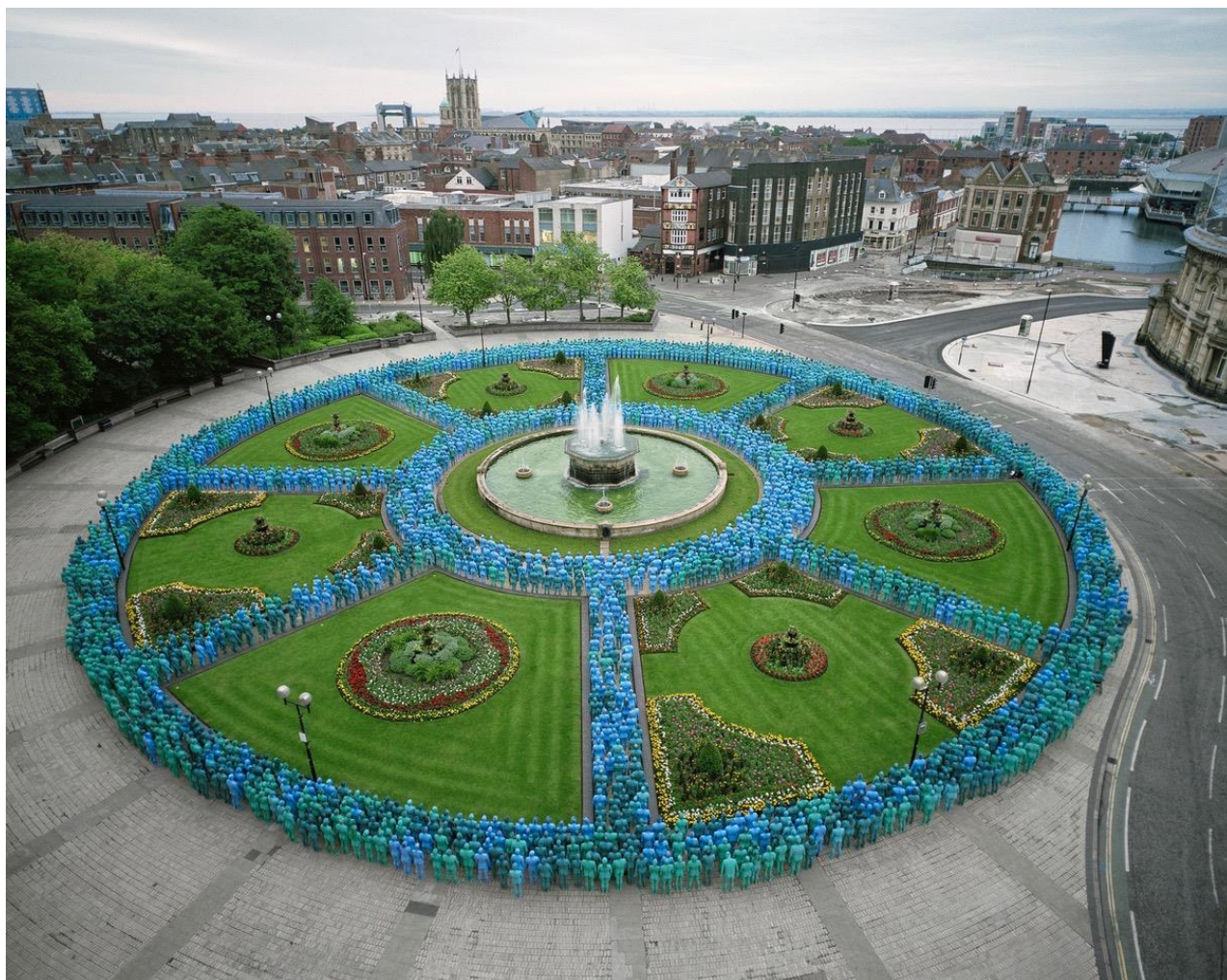
Fig. 4: Spencer Tunick, Sea of Hull (Rosebowl, Hull, United Kingdom) 2016.

More than its architecture, Tunick's relationship with New York is through its inhabitants: "The reason why I love New York, and why it's my home, is because of its people. I think New York is this juggernaut of humanity." Some of his works focus on one or just a handful of people, whilst other works show many bodies arranged into "an action painting, a splash of bodies, very much like a Jackson Pollock." These works show entire crowds kneeling, lying down, standing up or even painted blue (as in a later work called Sea of Hull , Figure 4). Often, it becomes impossible to distinguish between one body and another as the group of undressed people becomes a flesh-coloured mass, sculpted by the photographer. He refers to his works as installations – the end result might be a photo, but he stages both intimate and enormous interventions in space before he takes his shot.