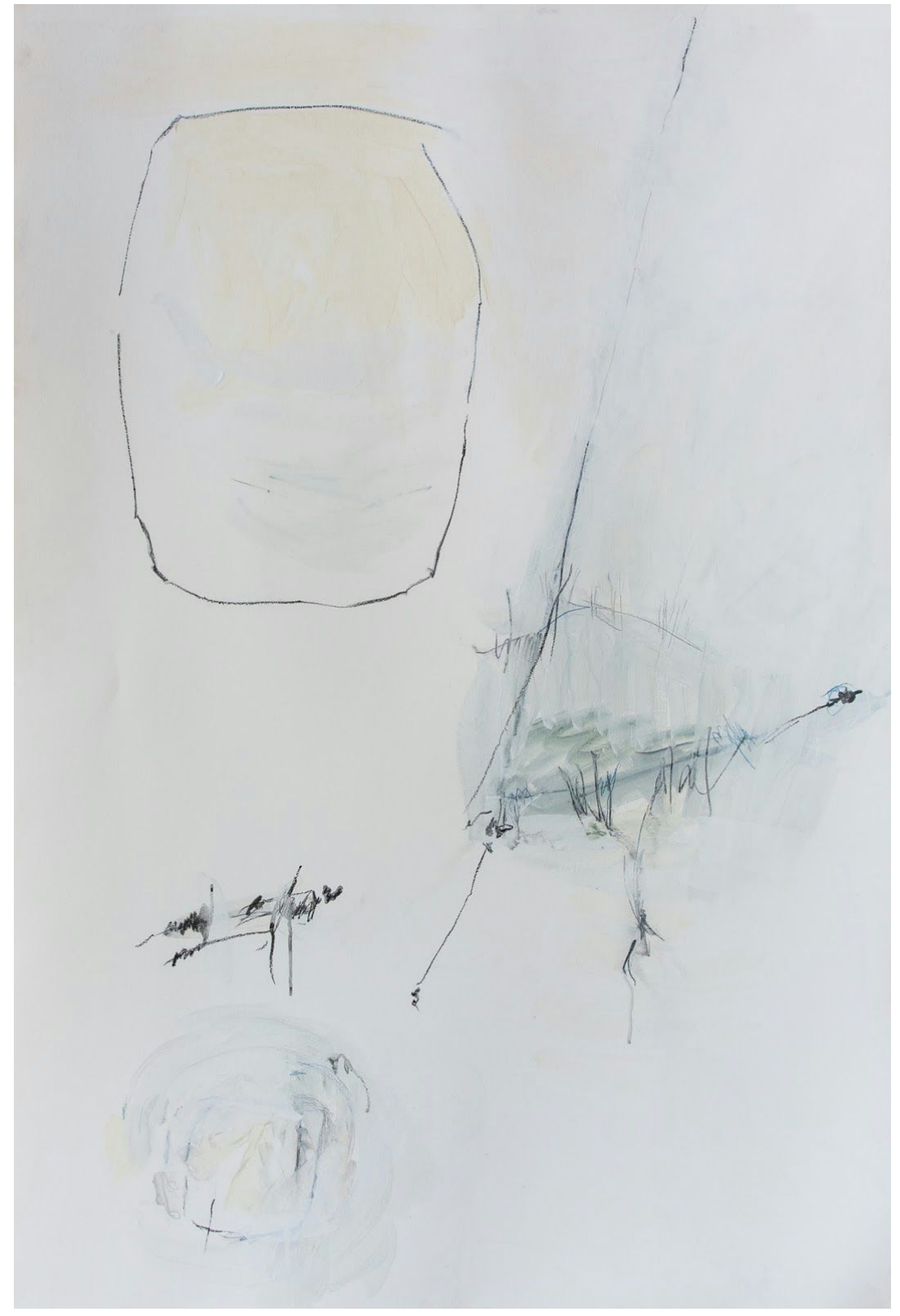
Teresa Waterman, Untitled, 2014, mixed media on paper 60x41"