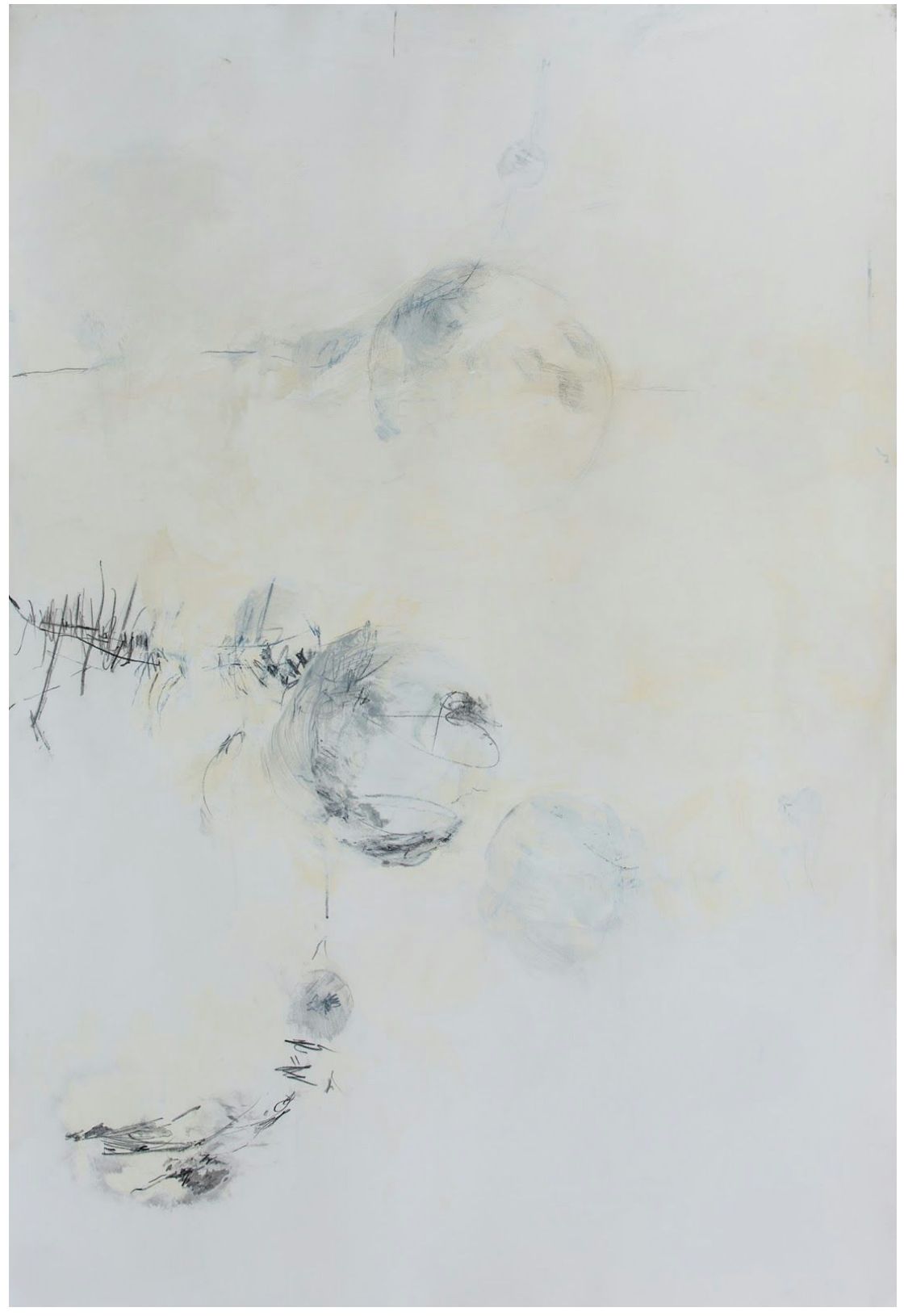
Teresa Waterman, Untitled, 2014, mixed media on paper 60x41"