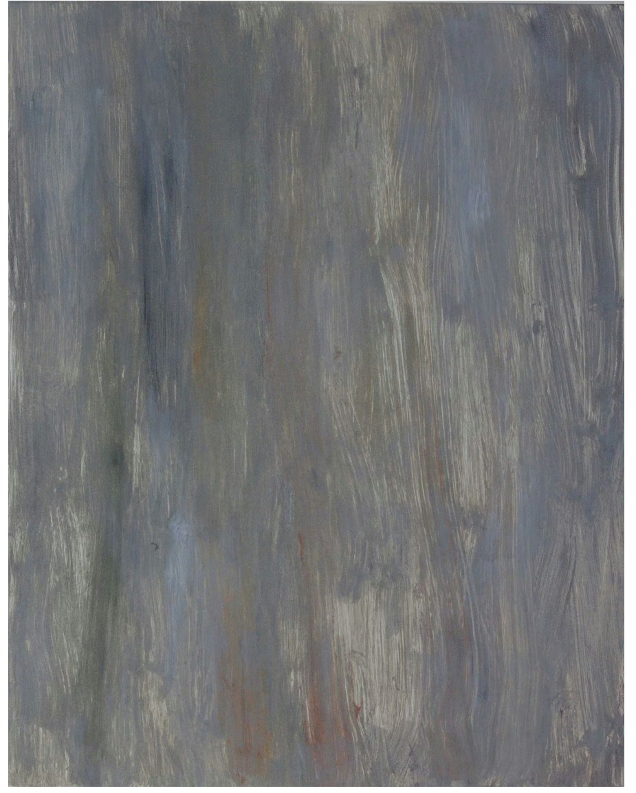
Lou Hicks, Grey Wall, 2014, montoype, 20x15.5, 30x22 (paper)