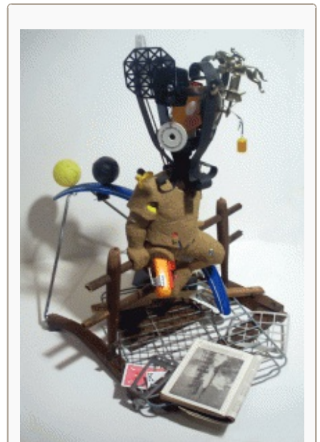
D. Dominick Lombardi, Urchin #36 (2009), sand, acrylic medium, found objects.

http://www.michelinadocimo.com/spirited-trees/