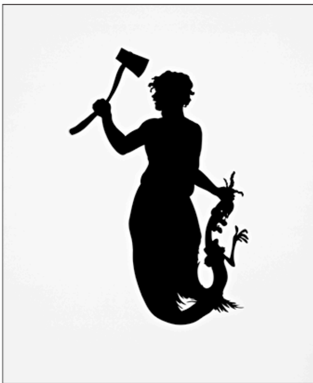
Kara Walker, "Bureau of Refugees: March - Bradley killed freedwoman with an axe in Montgy," 2007

Volume 2, Number 6 | The Weekly Newspaper of Chelsea | November 9 - 15, 2007