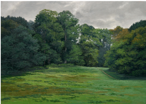
Nellie's Lawn, Rainy Day No. 2