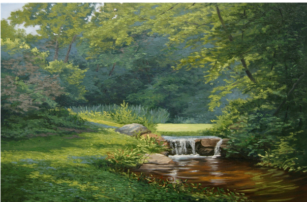
Bennine Water Waterfall