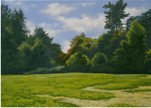
Floating Water Primrose, Prospect Park