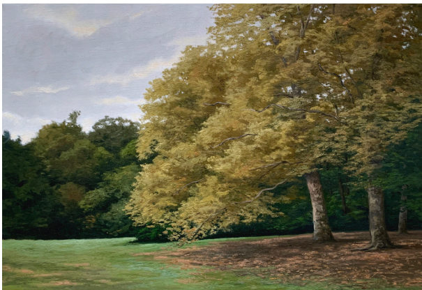
Plane Trees, The Nethermead, Prospect Park