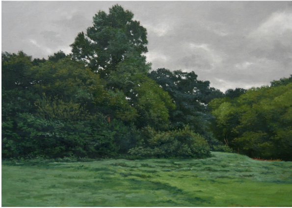
Nellie's Lawn, Rainy Day