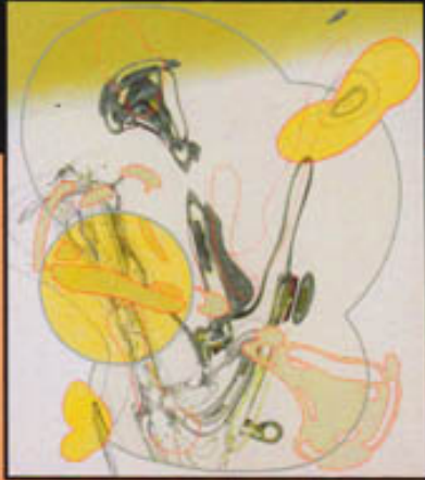
Anatoly, 54" x 47" Oil, Ink, Acrylic on Canvas, 2005