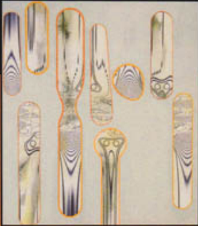
Norelco I, 36" x 32" Oil, Ink, Acrylic on Canvas, 2004