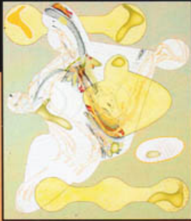
Lazhlo, 54" x 47" Oil, Ink Acrylic on Canvas, 2005