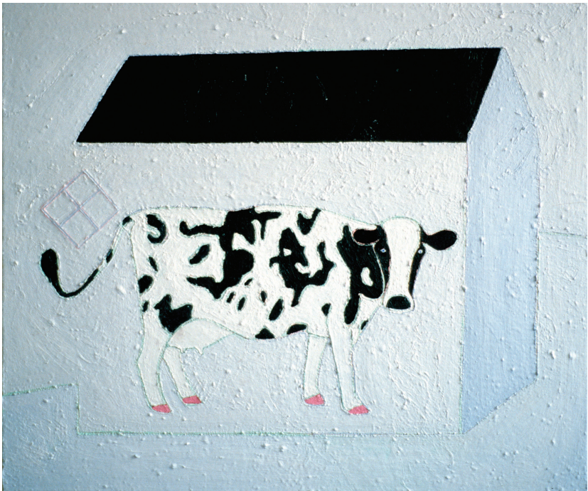
Cow with Pink Toes