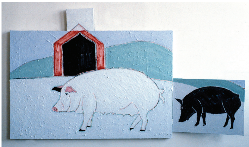
Two Pigs (three sections, right section hinged) 1983 oil on linen 48" X 76"