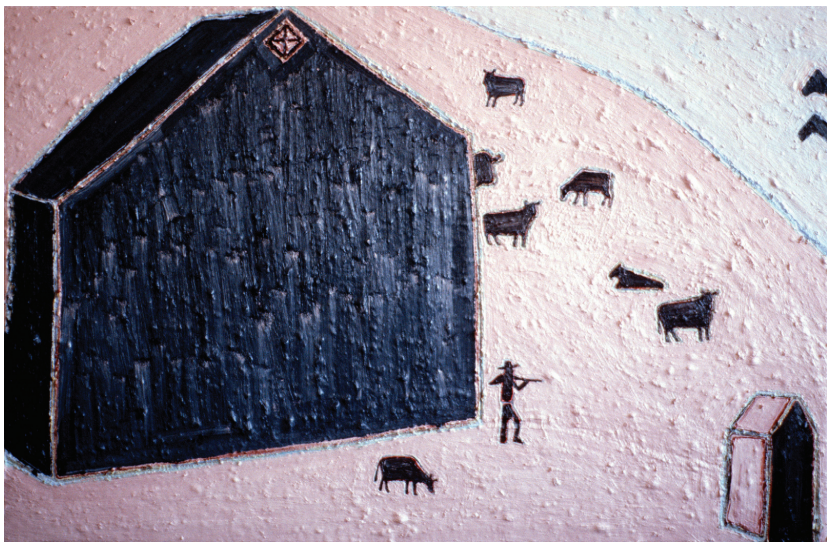
Hunter and Herd 1982 oil on linen 38" X 59"