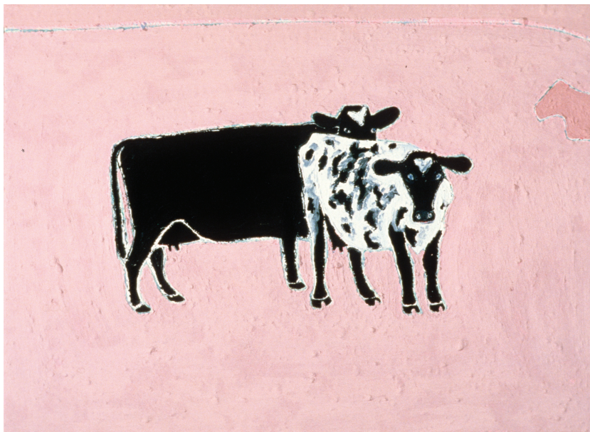
Three Cows 1982 oil on linen 26" X 36"