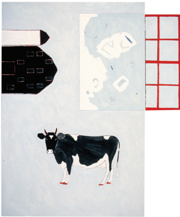
Cow and Window (two sections, right section hinged) 1983 oil on linen 74" X 61"