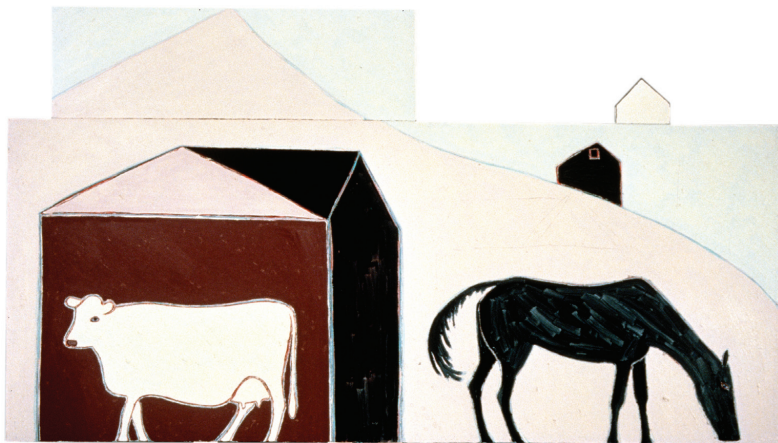
Cow and Horse (shaped painting, three sections)