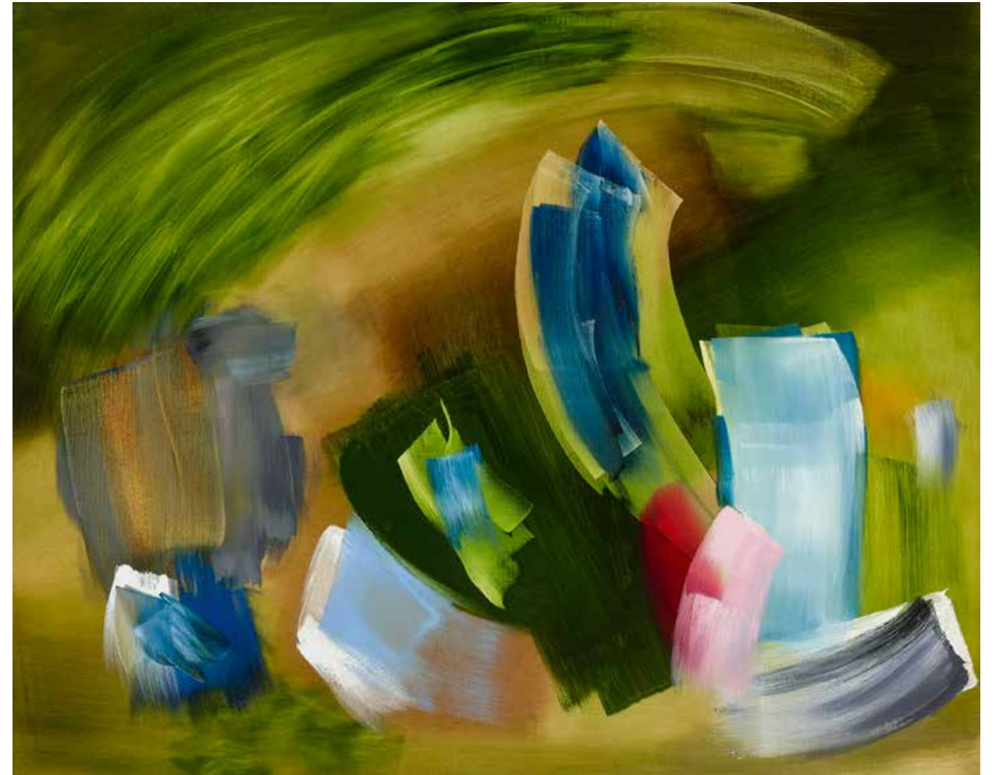
Feast of the Gods III , 2021 oil on linen, 48 x 60 inches