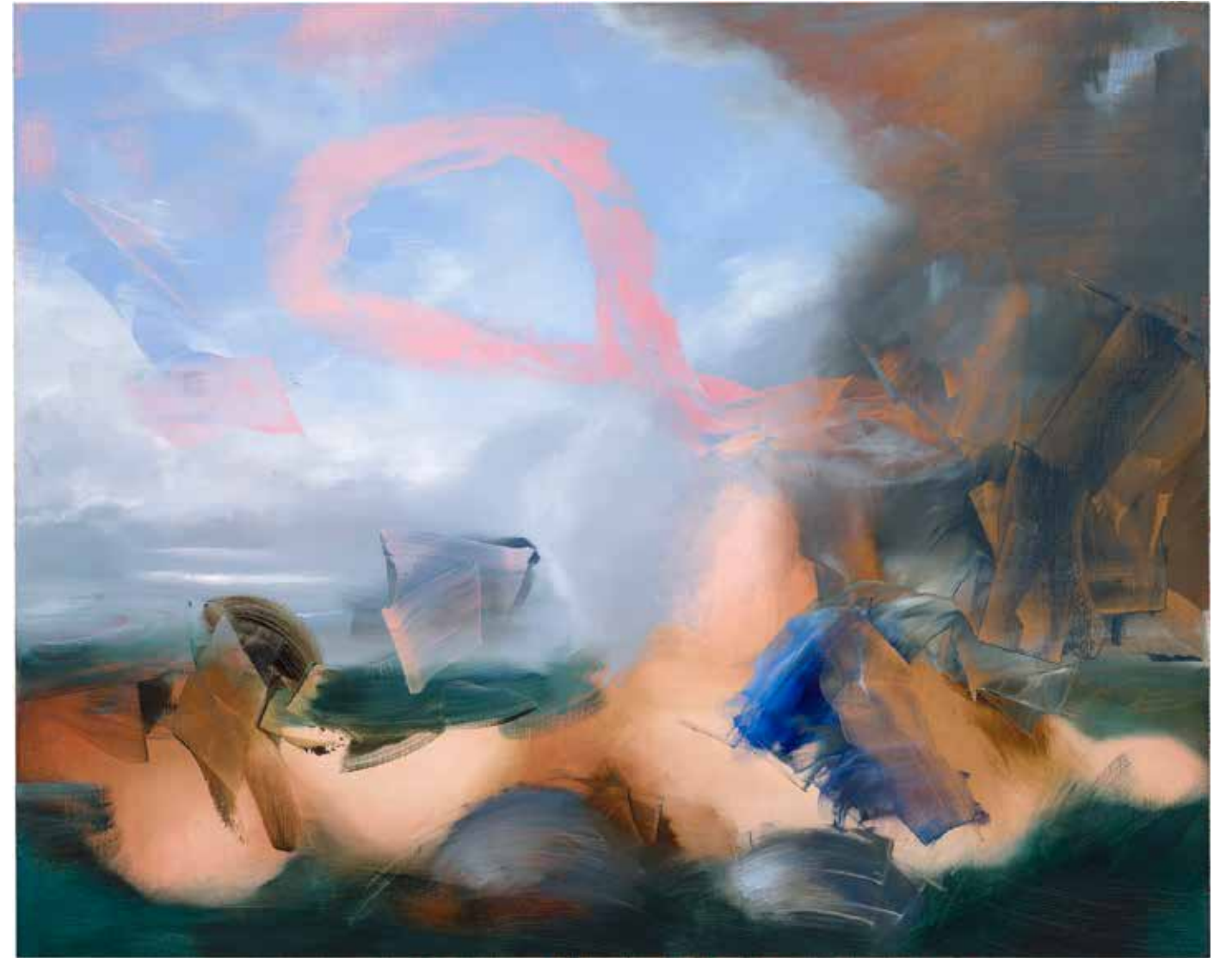
Triumph of Venus III , 2021 oil on linen, 40 x 50 inches