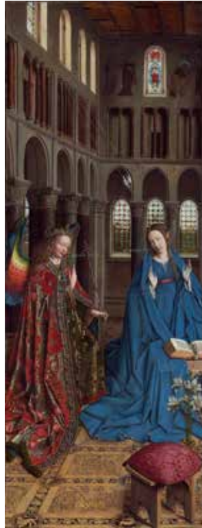
Jan van Eyck The Annunciation , c. 1434/1436, oil on canvas transferred from panel, 36.6 x 14.5 inches Collection National Gallery of Art, Washington, DC