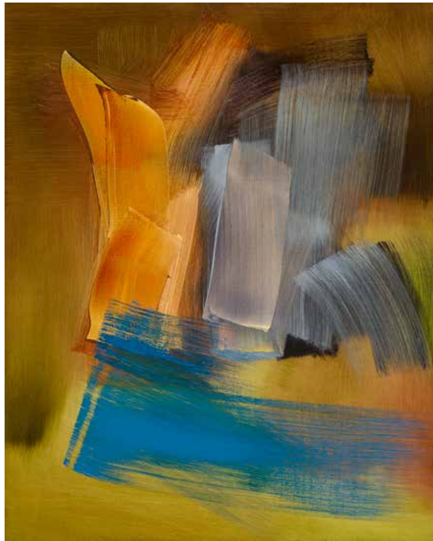
Silenus , 2021 oil on linen, 30 x 24 inches