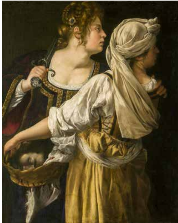
Artemisia Gentileschi Judith and Her Maidservant , ca.1615, oil on canvas, 45 x 36.8 inches Collection Pitti Palace, Florence, Italy