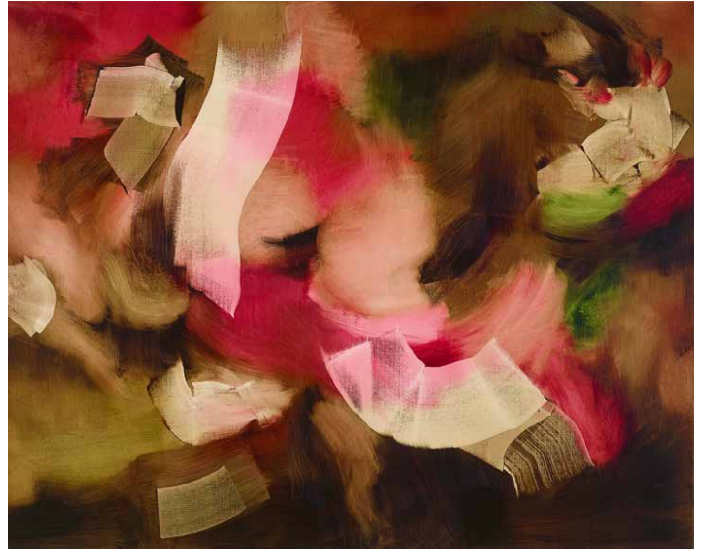
Sardanapalus , 2021 oil on linen, 40 x 50 inches