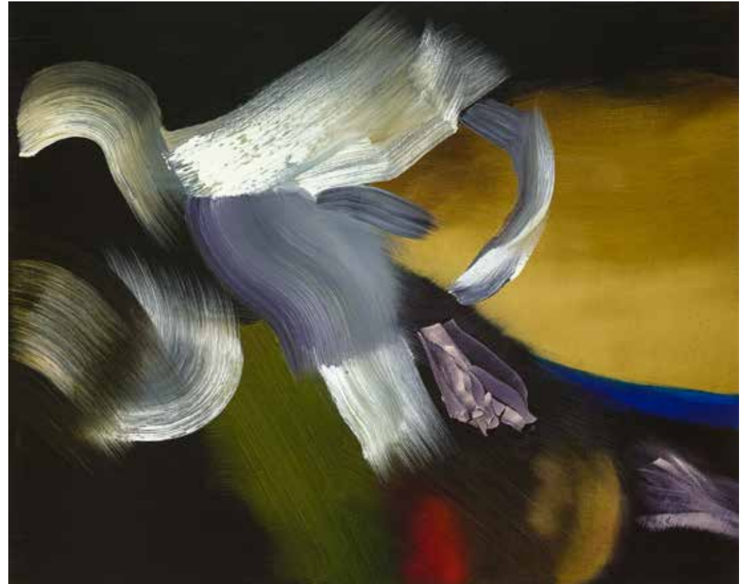
Judith and her Maidservant I , 2021 oil on linen, 24 x 30 inches