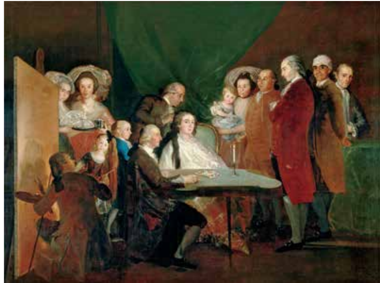
Francisco Goya The Family of the Infante Don Luis , 1784-84, oil on canvas, 97.6 x 129 inches Collection Fondazione Magnani Rocca. Parma, Parma, Italy