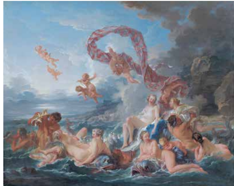
François Boucher The Triumph of Venus , 1740, oil on canvas, 51 x 64 inches Collection Nationalmuseum Sweden, Stockholm