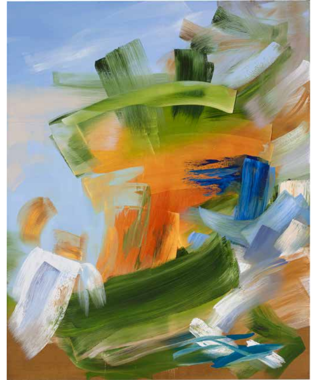
Generosity II , 2021 oil on linen, 60 x 48 inches