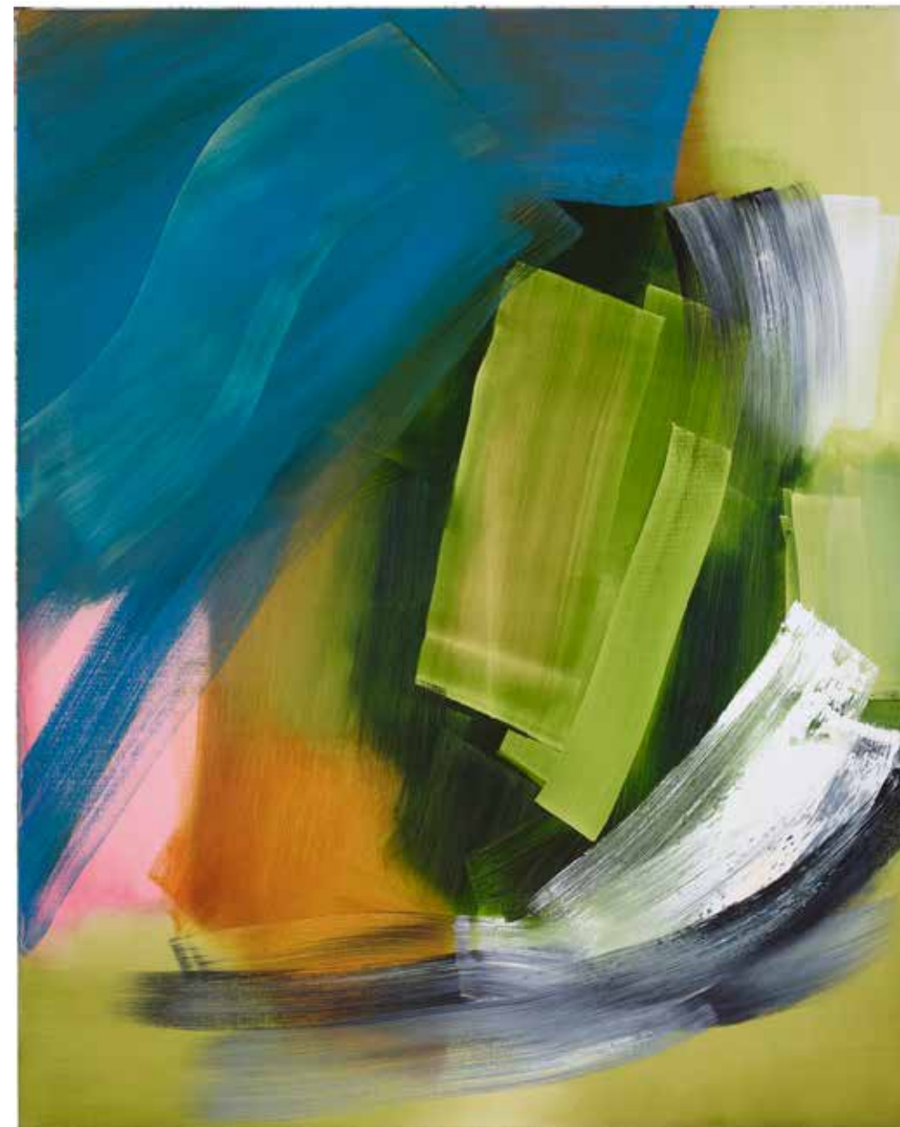
Lotis III , 2021 oil on linen, 60 x 48 inches