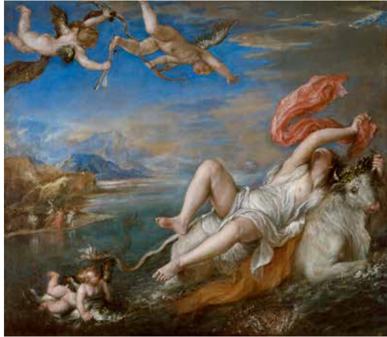
Titian The Rape of Europa , 1559-1562, oil on canvas, 70 x 81 inches Collection Isabella Stewart Gardner Museum, Boston, MA