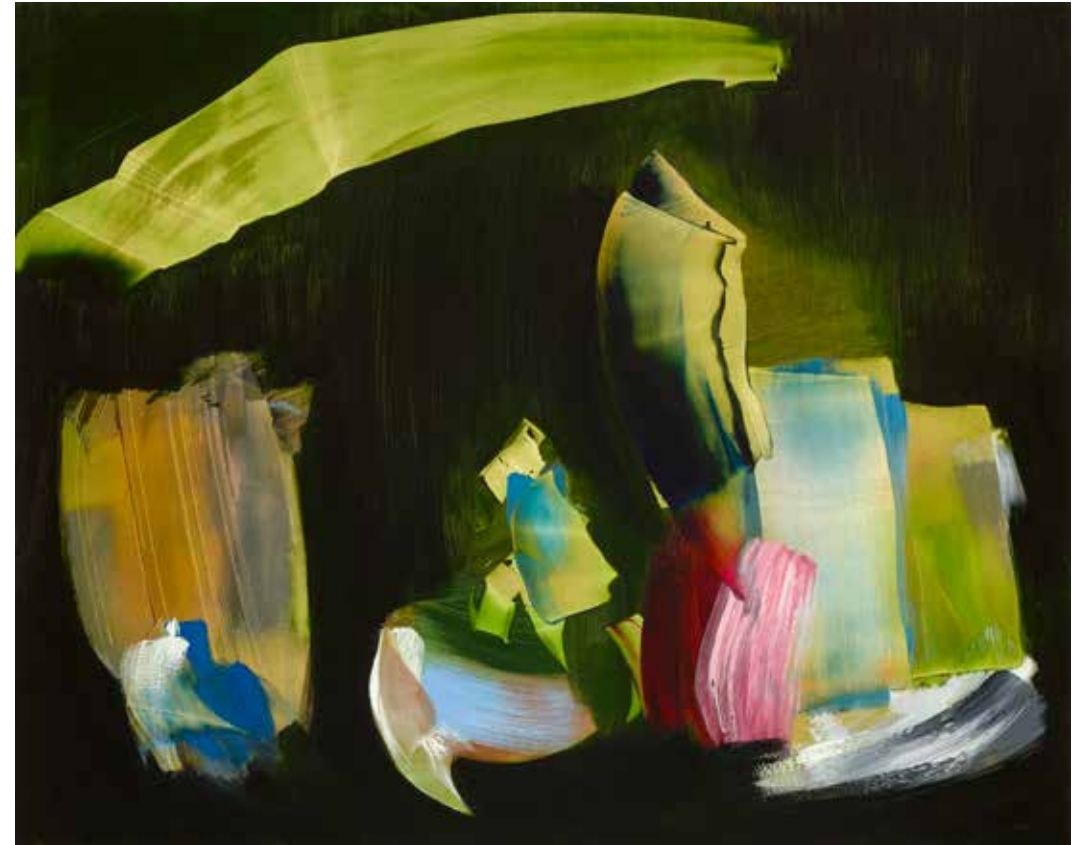
Study for Feast , 2021 oil on linen, 24 x 30 inches