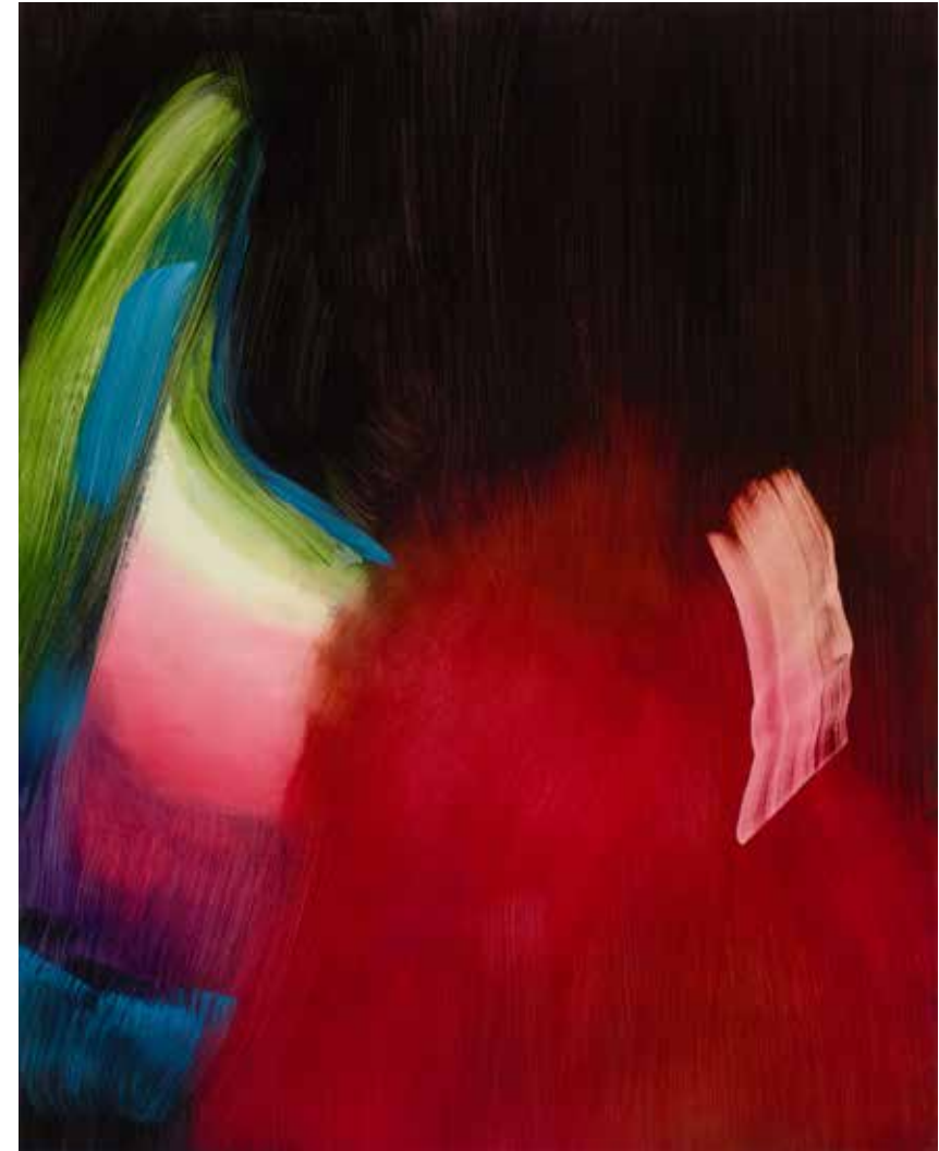
Outrageous Interference I , 2021 oil on linen, 30 x 24 inches