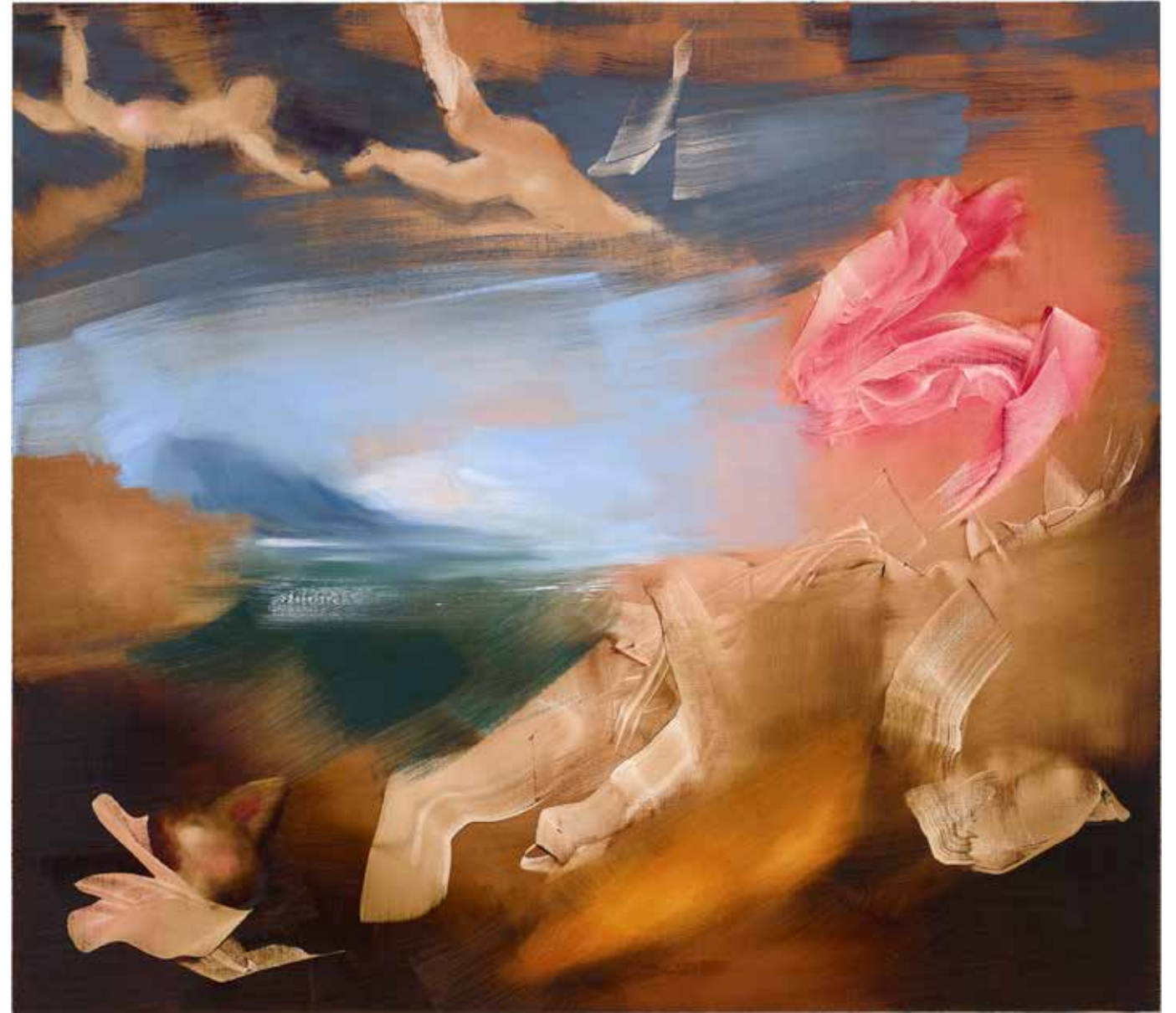
Europa , 2021 oil on linen, 44 x 50 inches