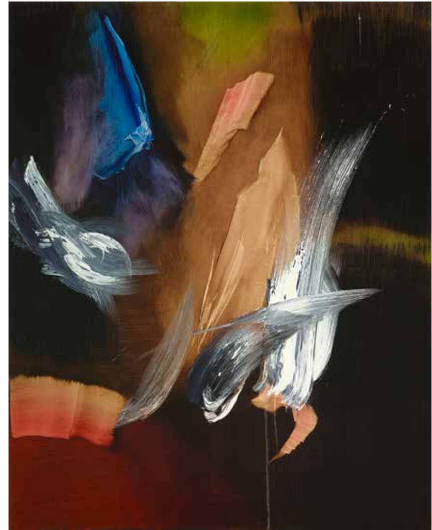
Judith IV , 2021 oil on linen, 30 x 24 inches