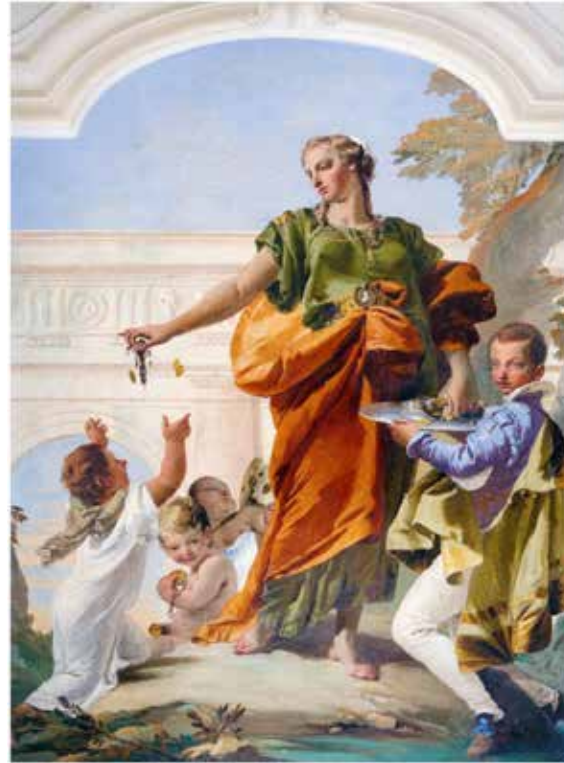
Giovanni Battista Tiepolo Generosity Bestowing Her Gifts , 1734, fresco Collection Villa Zileri, Monteviale, Veneto, Italy