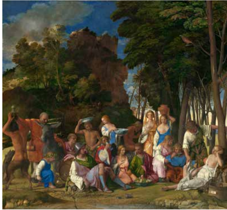
Giovanni Bellini and Titian The Feast of the Gods , 1514/1529, oil on canvas, 67 x 74 inches Collection National Gallery of Art, Washington, DC