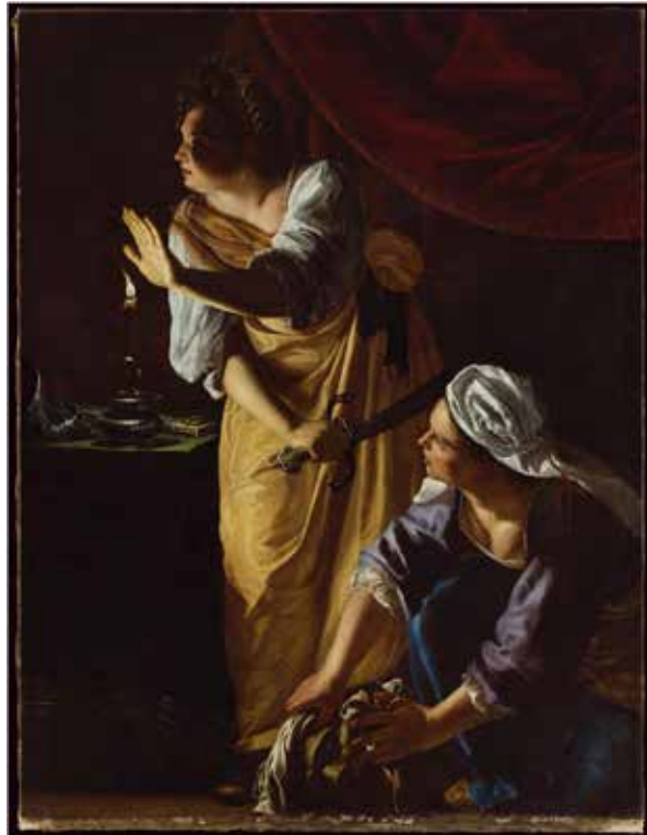
Artemisia Gentileschi Judith and Her Maidservant with the Head of Holofernes , ca.1623-1625, oil on canvas, 74 x 56 inches Collection Detroit Institute of Art, Detroit, MI