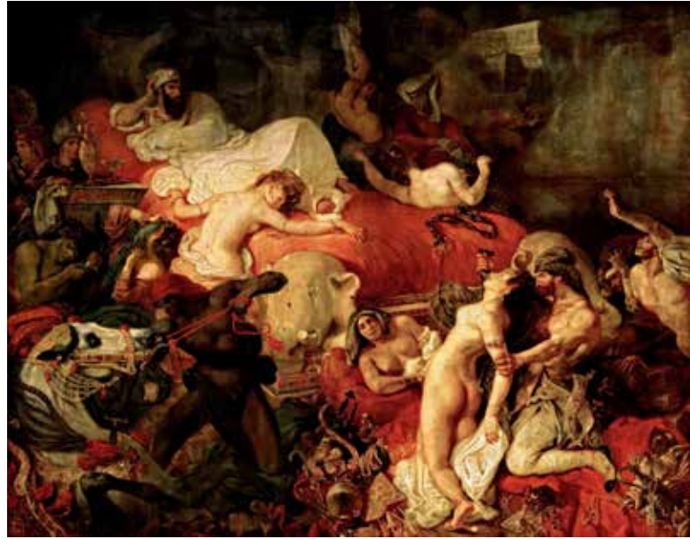
Eugène Delacroix The Death of Sardanapalus , 1827, oil on canvas, 154 x 195 inches Collection Musée du Louvre, Paris, France