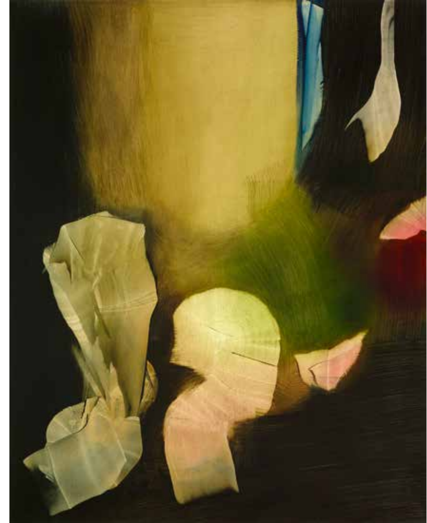
Judith and her Maidservant II , 2021 oil on linen, 30 x 24 inches