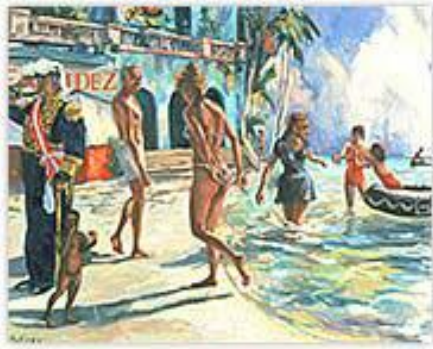
THE PALACE GUARD, 1993

The series begins with pictures of raunchy rowdyism painted in lurid, expressionist colors. As the paintings move forward in time, they become less comic and more sexually tense. The climax of this progression is a fishing-boat scene called 'Gulf Stream Magic' that places the viewer right in the center of the action.